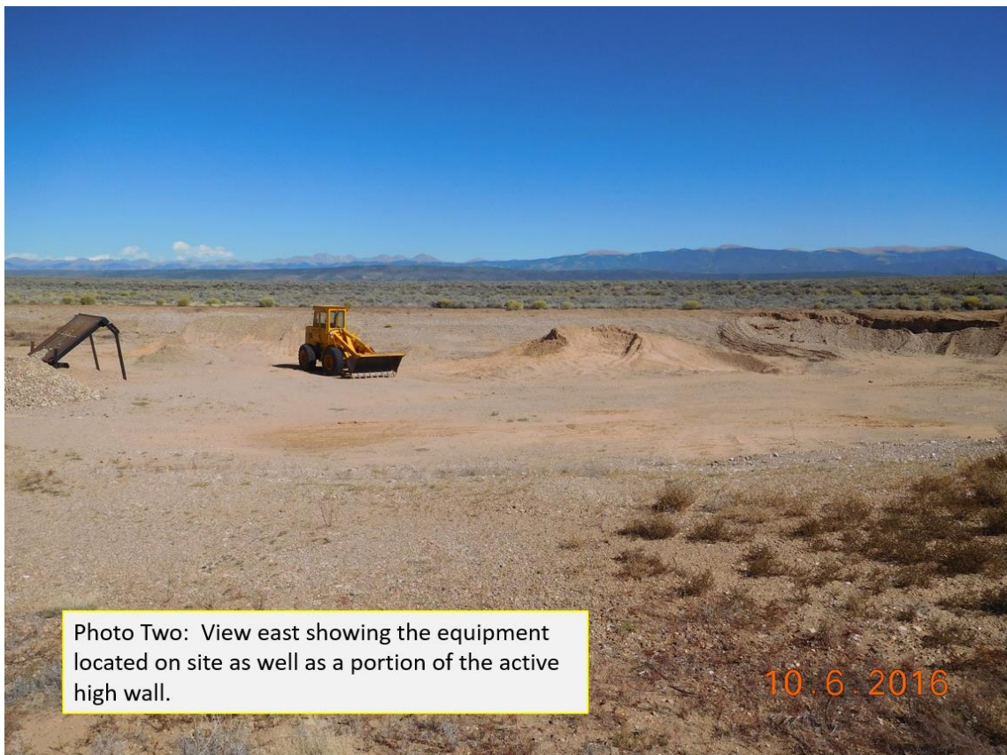
Photo Two: View east showing the equipment located on site as well as a portion of the active high wall.