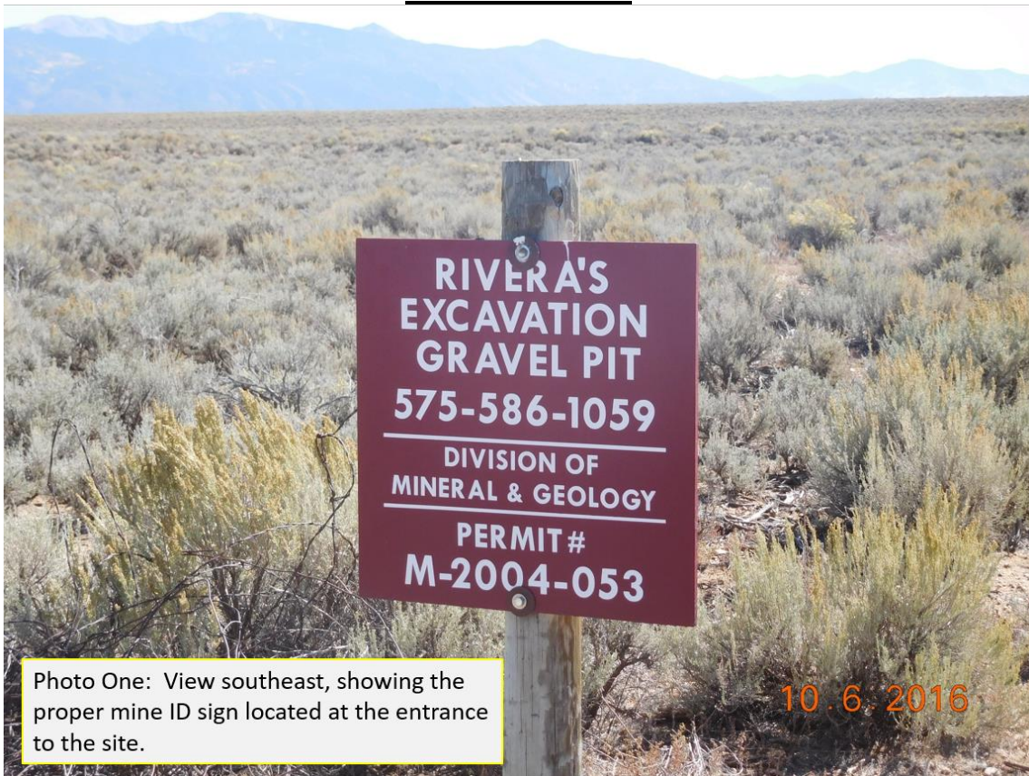
Photo One: View southeast, showing the proper mine ID sign located at the entrance to the site.