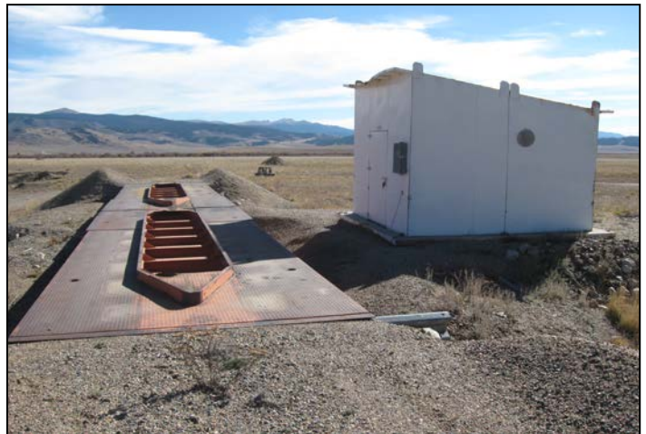
4. Scale house and scale.