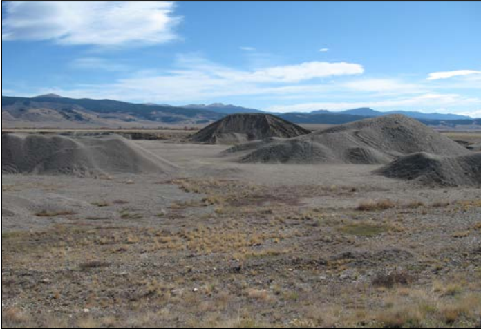
1. Product stockpiles on pit floor.