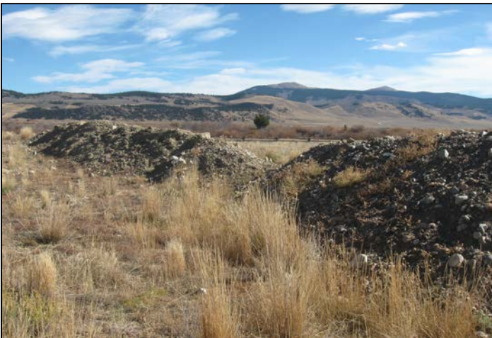
3. Topsoil stockpiles.