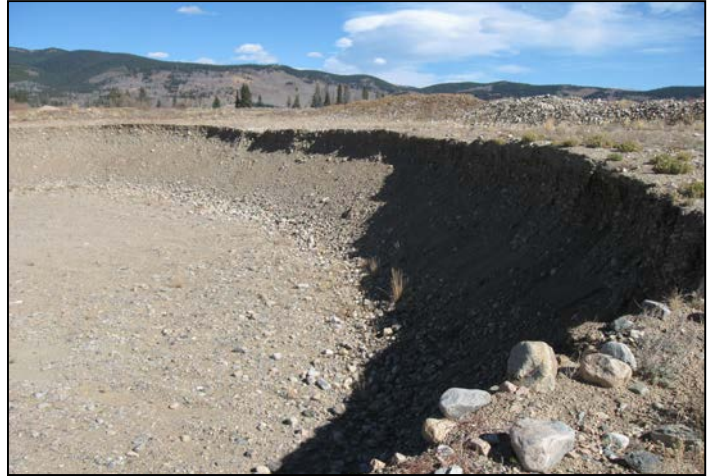
2. Unreclaimed pit walls.