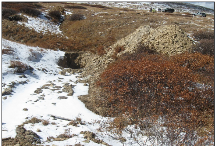
6. Overburden from third excavation.