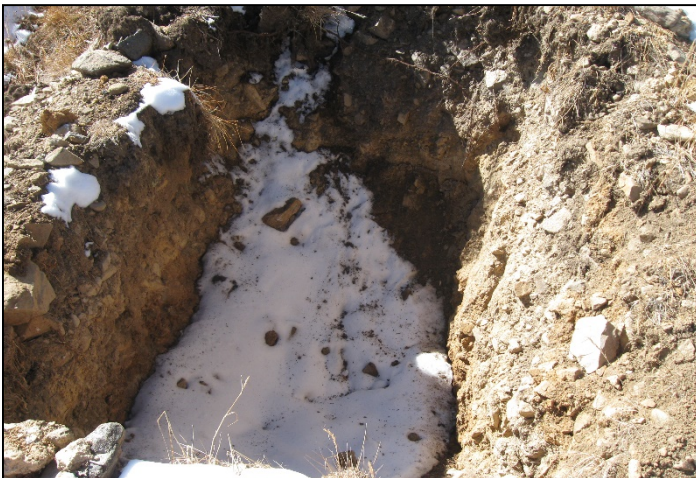
3. Second Excavation.