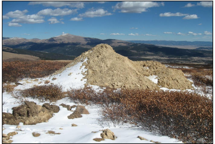
2. Overburden from first excavation.