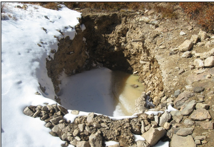
5. Third excavation.