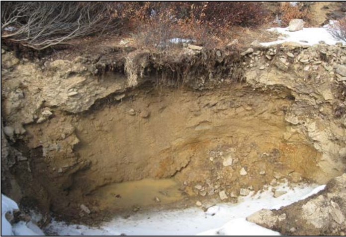
1. First excavation.