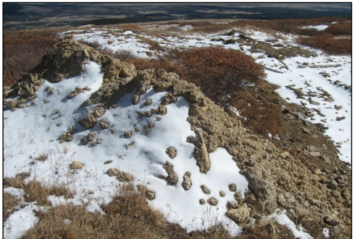
4. Overburden from second excavation.