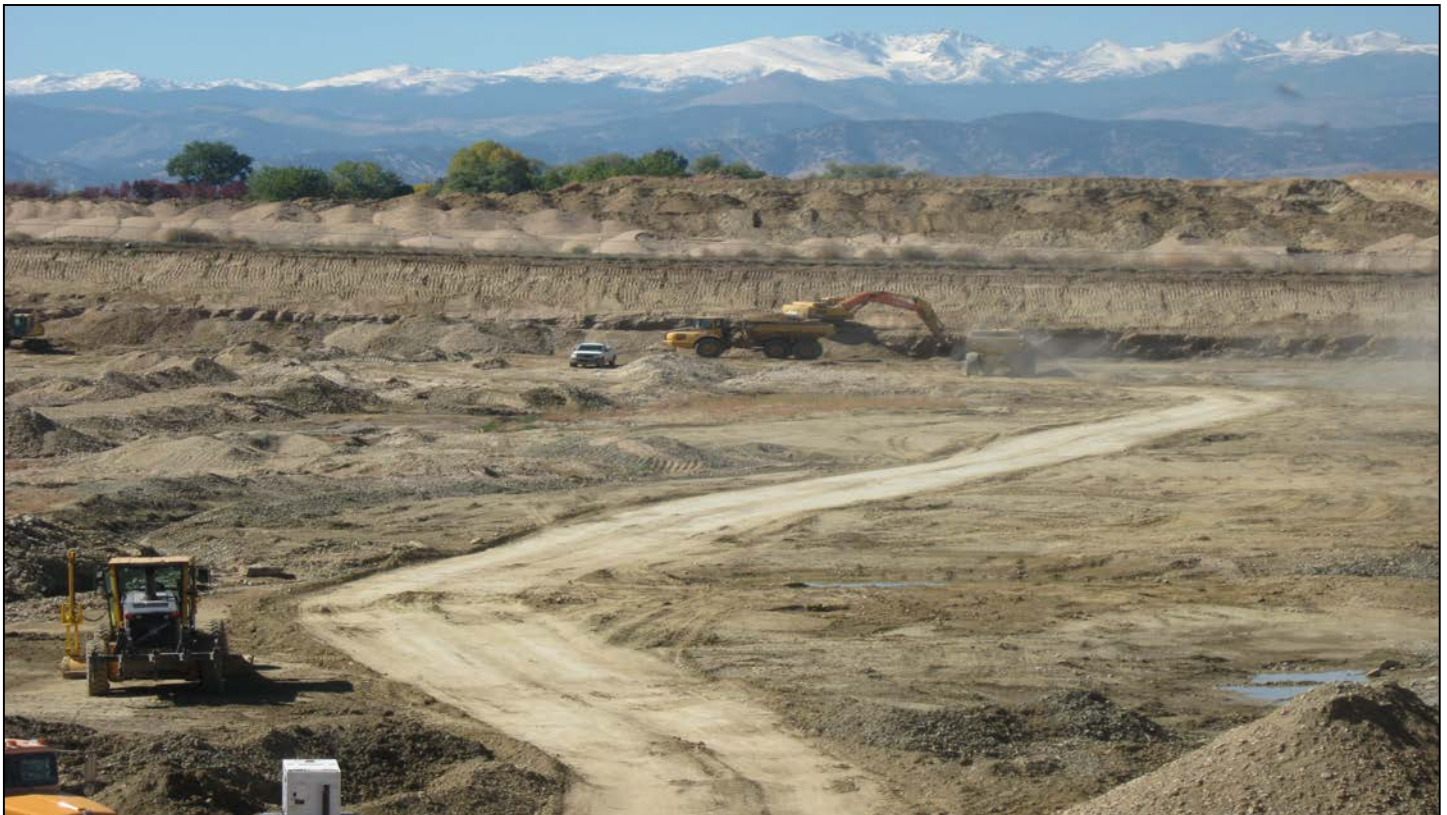
2. Overview of the southern reservoir.