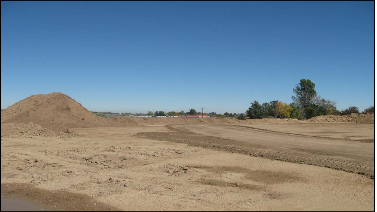
1. Remaining overburden, adjacent to the processing area.