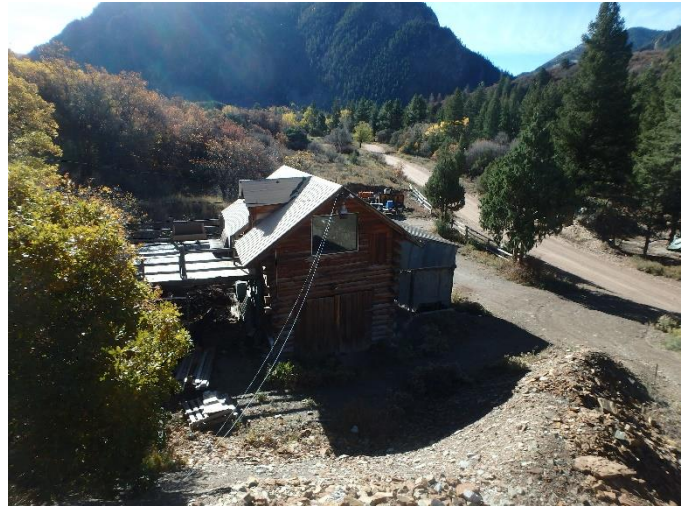
Figure 4: Mine building viewed from portal bench