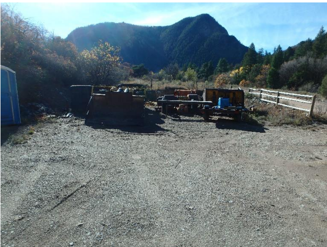
Figure 5: Equipment storage on east side of building