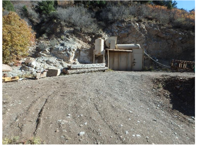
Figure 2: Portal area