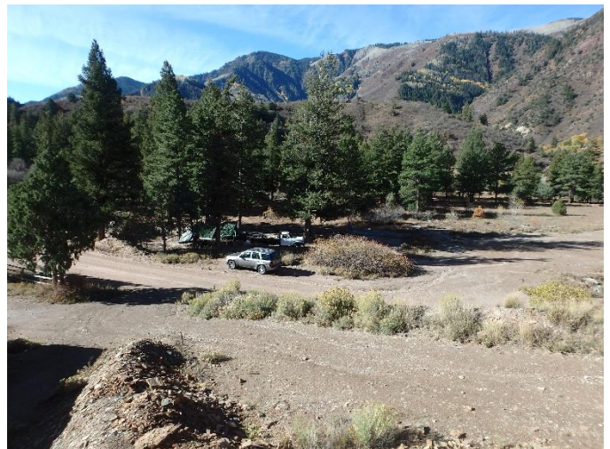
Figure 6: Parking area viewed from portal bench