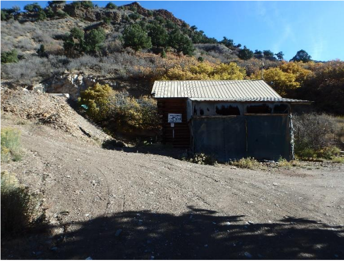
Figure 1: Mine building