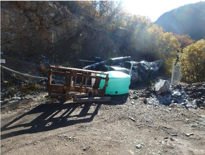
Figure 3: Portal area