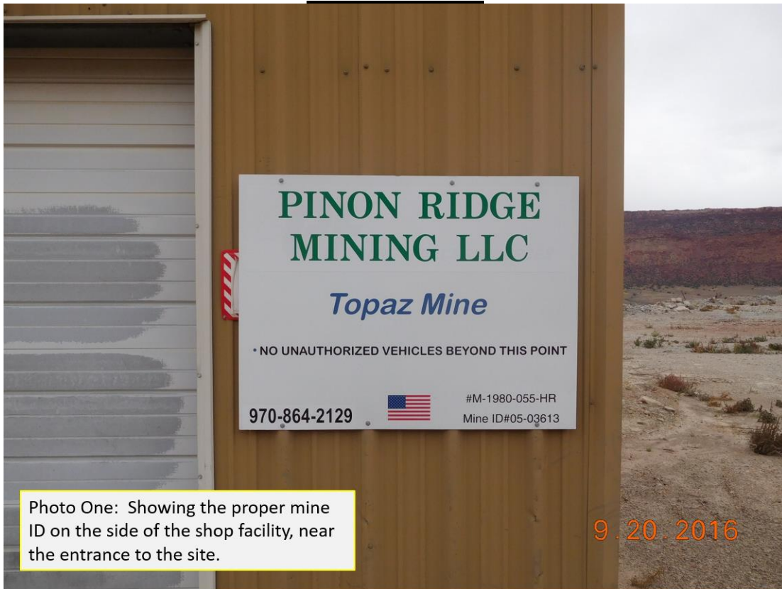
Photo One: Showing the proper mine ID on the side of the shop facility, near the entrance to the site.