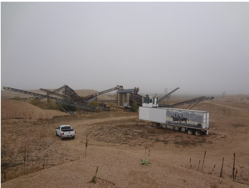
View of processing plant looking north from stockpile