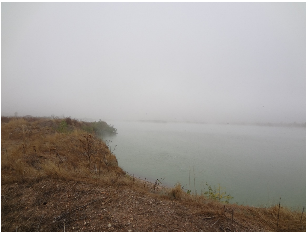
View of Sharkey Lake from SW corner looking NE