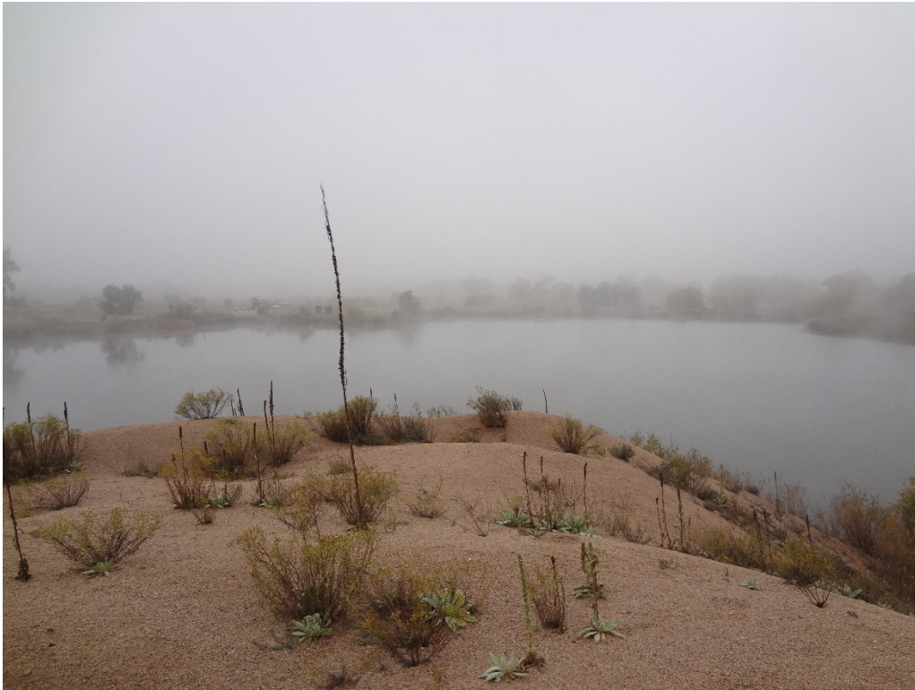
View of dredge pond looking west from stockpile