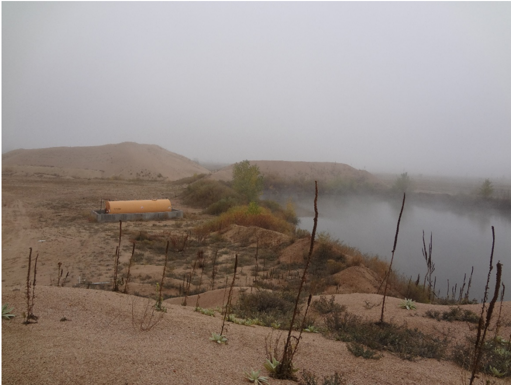
View of dredge pond looking east from stockpile