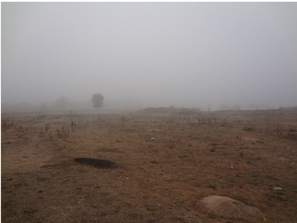
View of slurry wall around Sharkey Lake from SE corner looking west