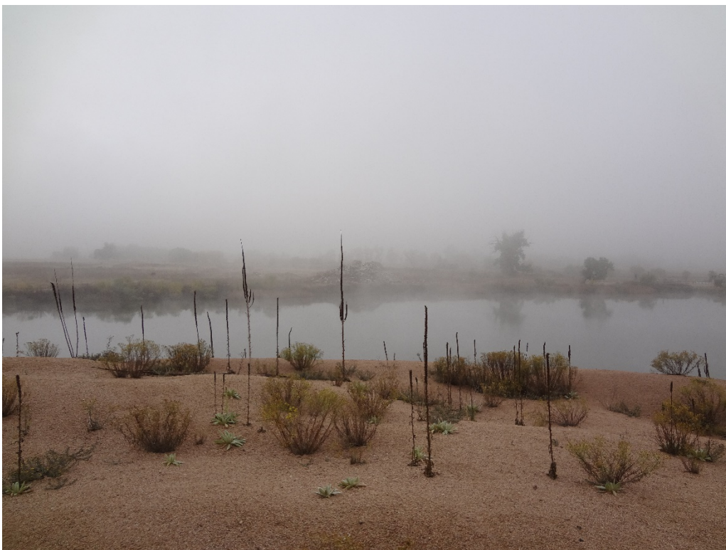
View of dredge pond looking north from stockpile