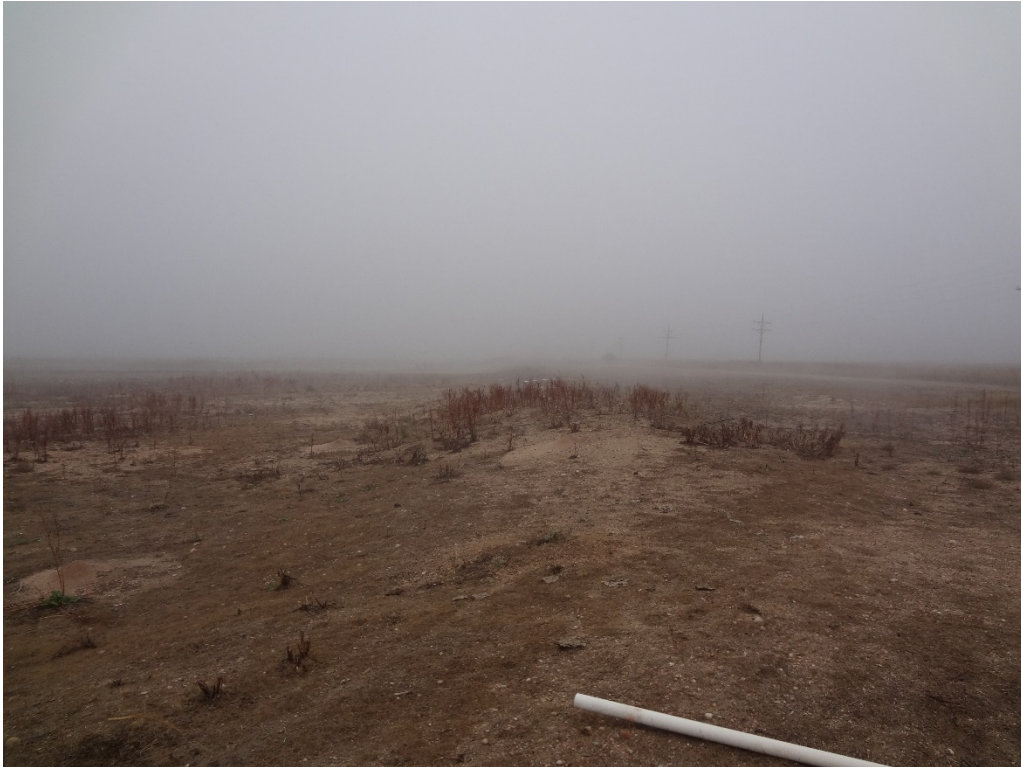
View of slurry wall around Sharkey Lake from SE corner looking north