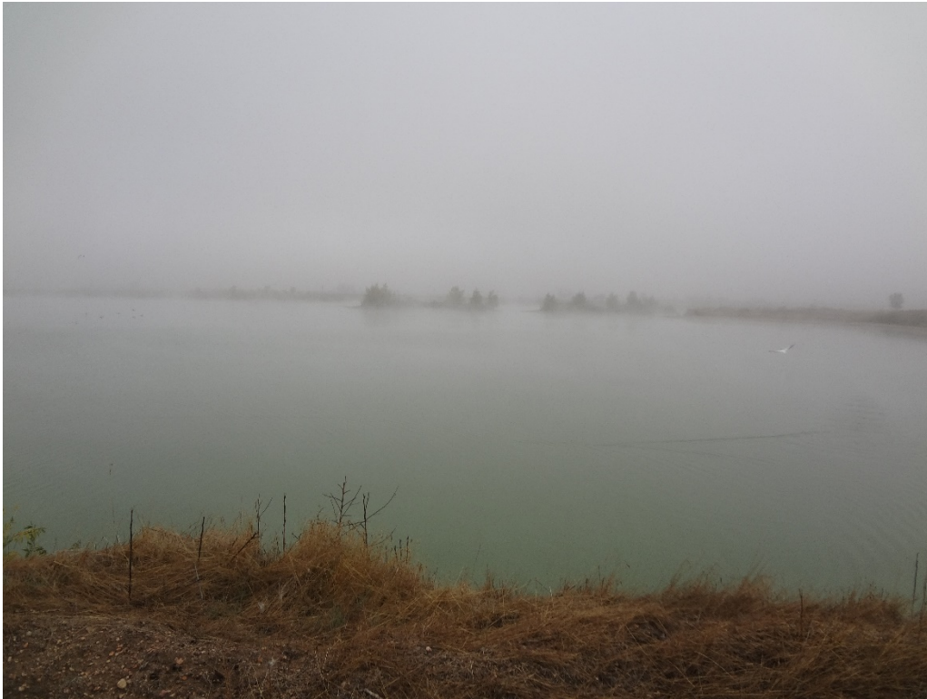
View of Sharkey Lake from SW corner looking east