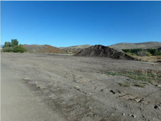
Figure 3: Stockpile area on south side of Tomichi Creek