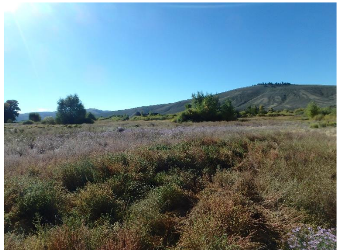
Figure 6: Noxious weeds noted on north side of Tomichi Creek