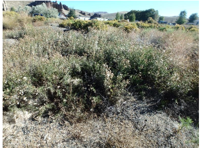
Figure 8: Noxious weeds noted on north side of Tomichi Creek