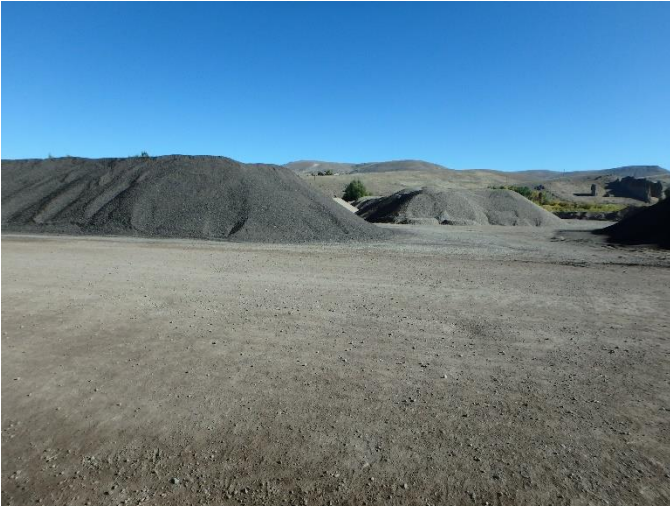
Figure 1: Stockpile area on south side of Tomichi Creek