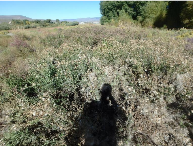
Figure 7: Noxious weeds noted on north side of Tomichi Creek