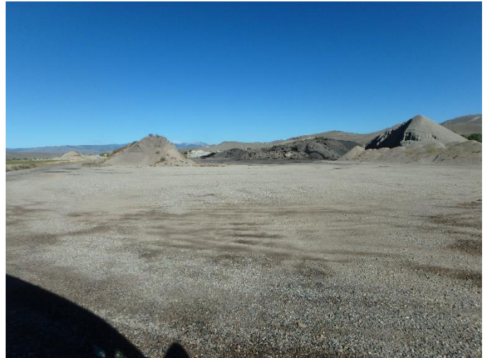
Figure 4: Stockpile area on south side of Tomichi Creek