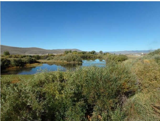
Figure 5: Pond on north side of Tomichi Creek