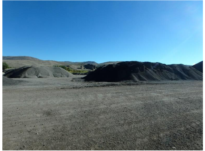
Figure 2: Stockpile area on south side of Tomichi Creek