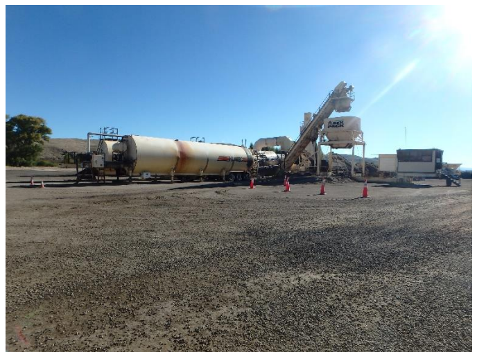
Figure 6: Plant/stockpile area in northeast permit area