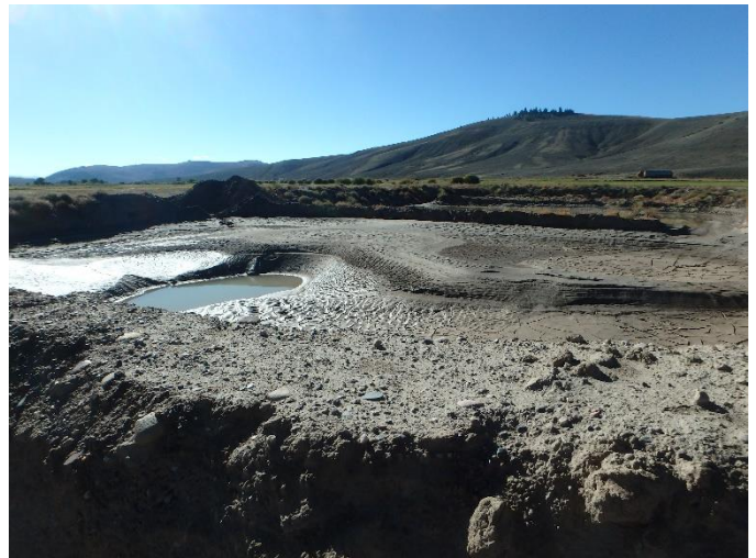
Figure 4: Sediment ponds at east end of pit