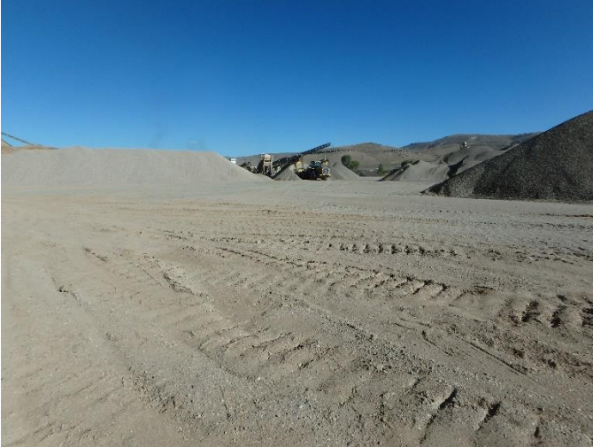
Figure 7: Plant/stockpile area in northeast permit area