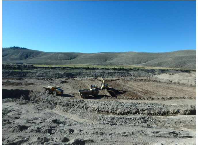
Figure 2: View from north side of pit