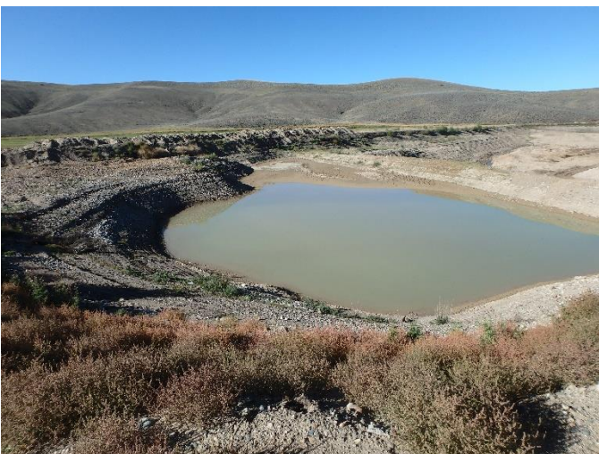
Figure 5: Sediment ponds at east end of pit