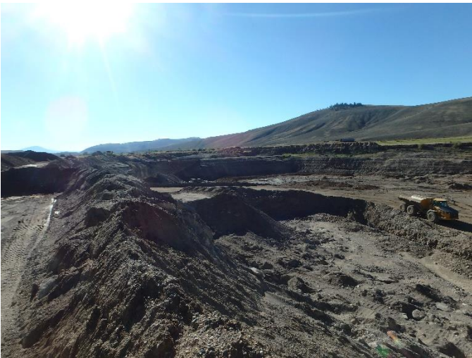
Figure 3: View from north side of pit