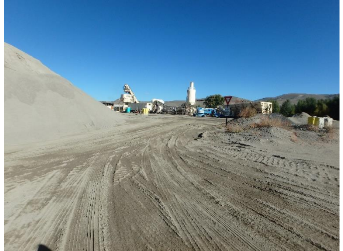
Figure 8: Plant/stockpile area in northeast permit area

Jason Burkey Oldcastle SW Group, Inc. dba United Companies of Mesa County 2273 River Road Grand Junction, CO 81505