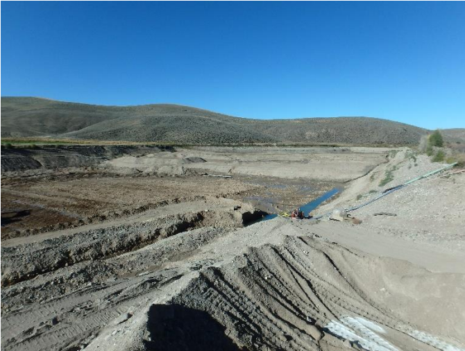
Figure 1: View from north side of pit