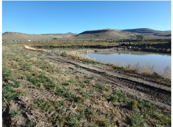
Figure 8: Wash ponds on west side of plant area