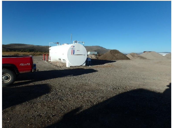
Figure 2: Fuel containment near scale house