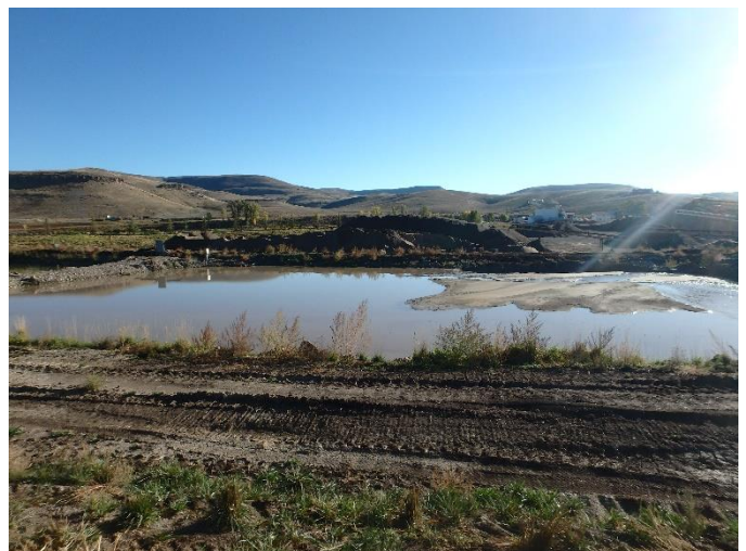
Figure 6: Sediment pond on southeast side of plant area