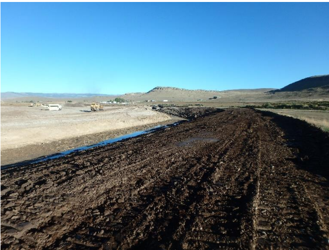
Figure 3: Phase 1 pit viewed from east side