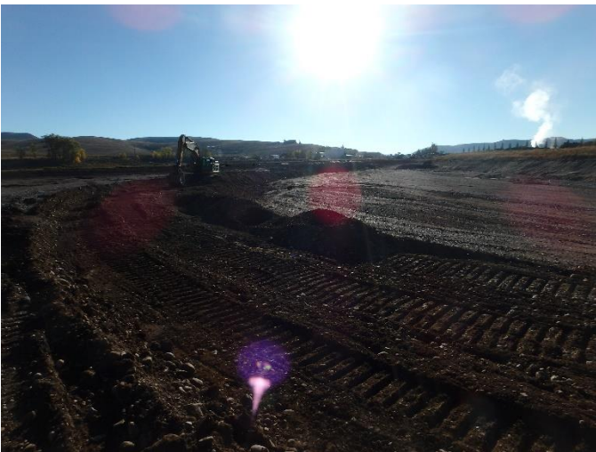
Figure 9: Phase 1 pit viewed from west side