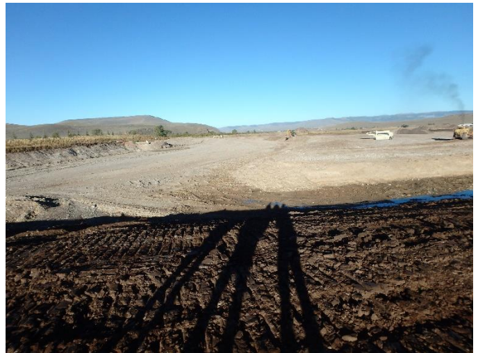
Figure 4: Phase 1 pit viewed from east side