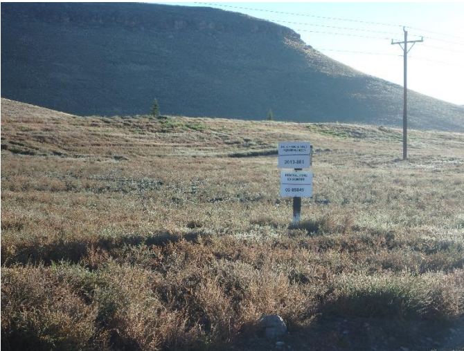
Figure 1: Mine identification sign at entrance