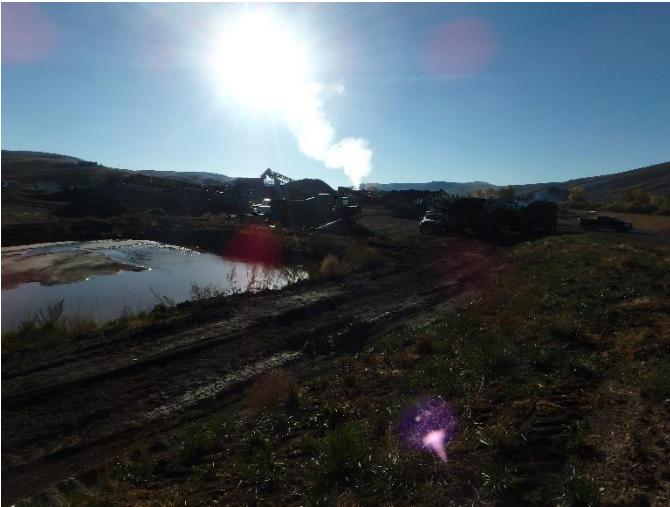
Figure 7: Sediment pond on southeast side of plant area