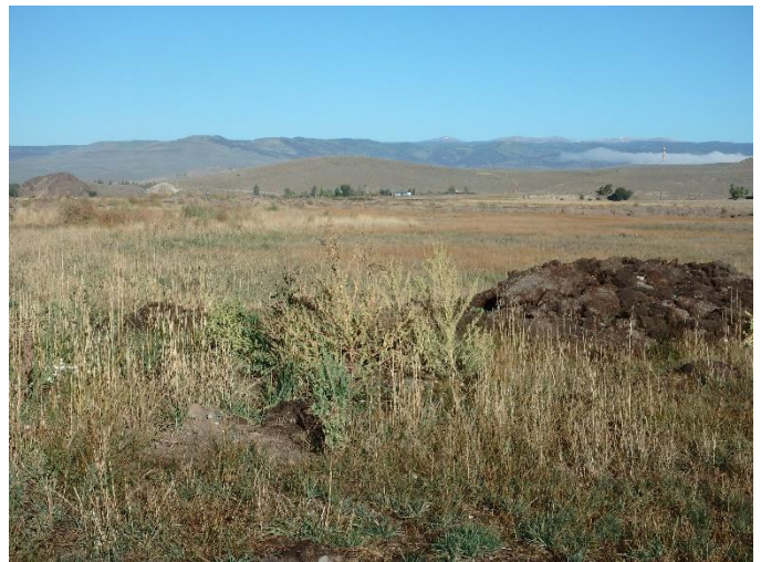
Figure 10: Phase 2 area undisturbed