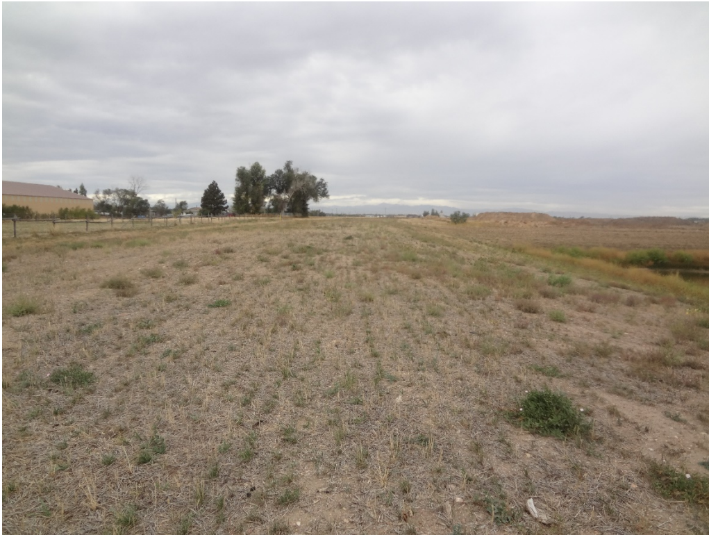
View of south parcel looking west from east end of parcel