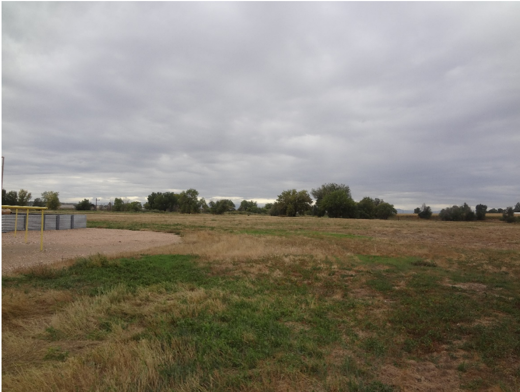
View of north parcel looking west from well pad