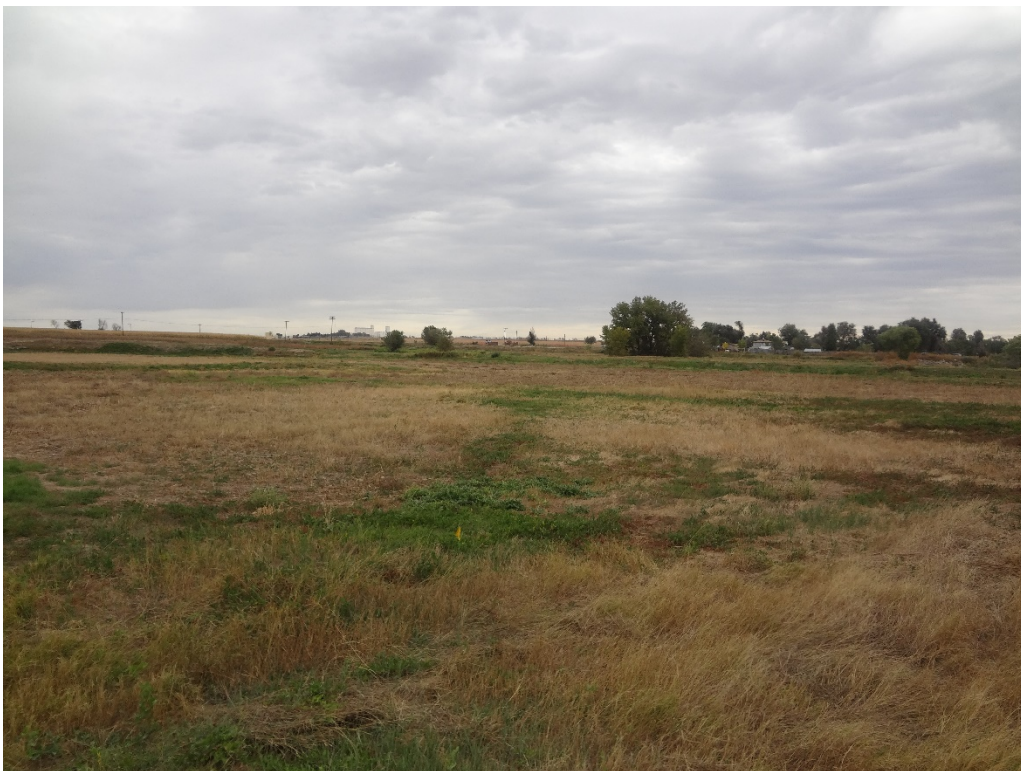
View of north parcel looking NE from well pad