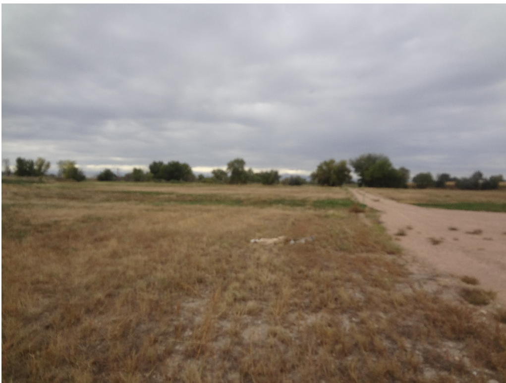
View of north parcel looking west from well pad