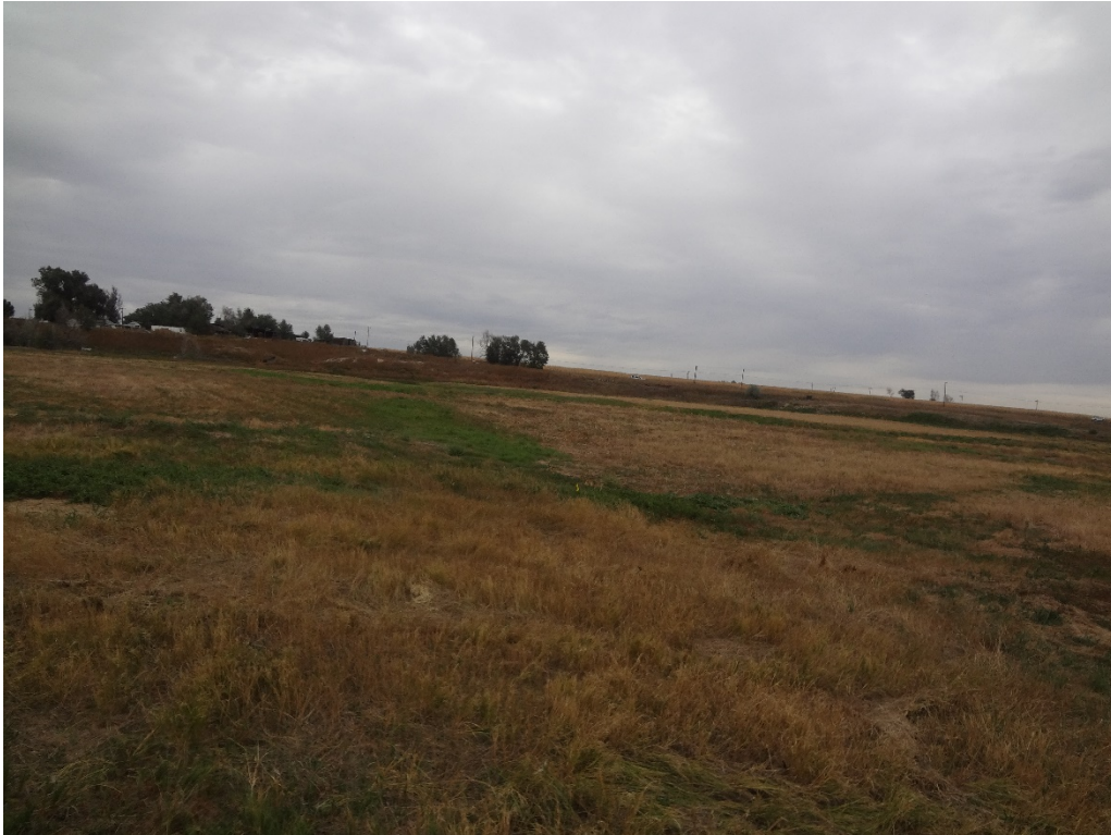
View of north parcel looking north from well pad