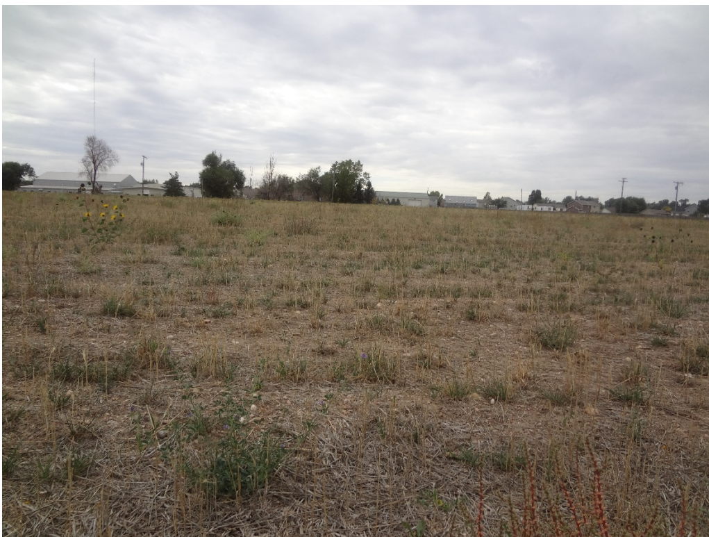
View of south parcel looking south from middle of parcel