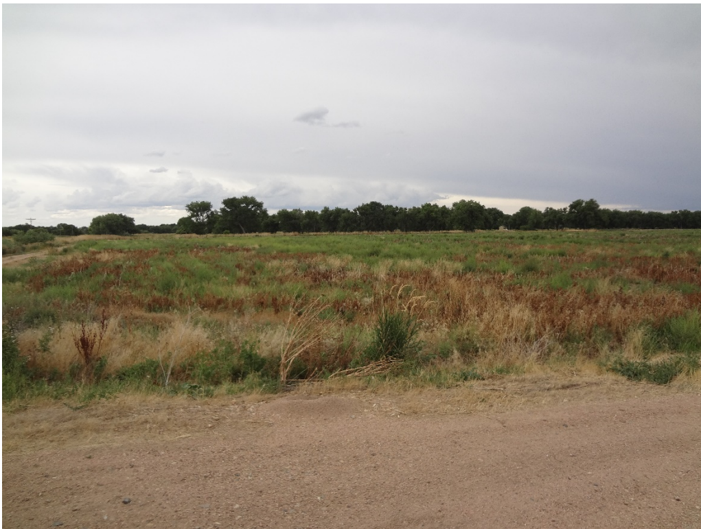
View looking east from corner of MM parcel near Section 12