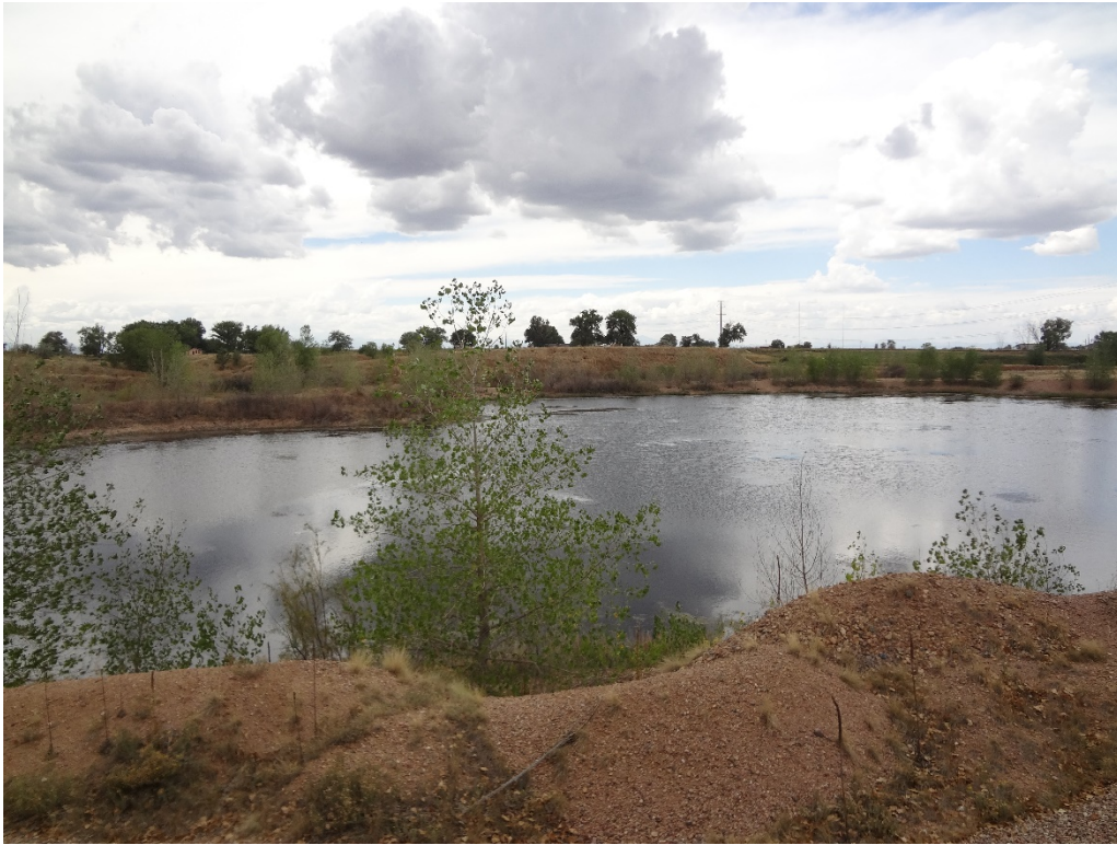
View of Old Ft. Lupton Pit lake