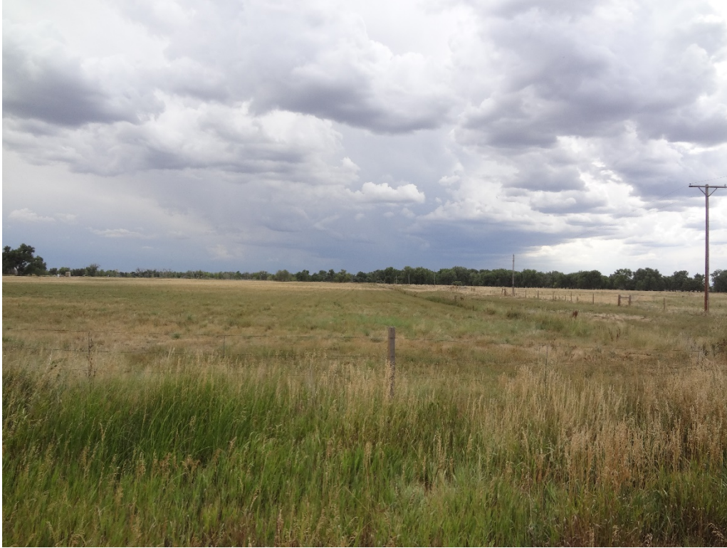
View of Stevens parcel (Aurora owned) from CR 8 looking south