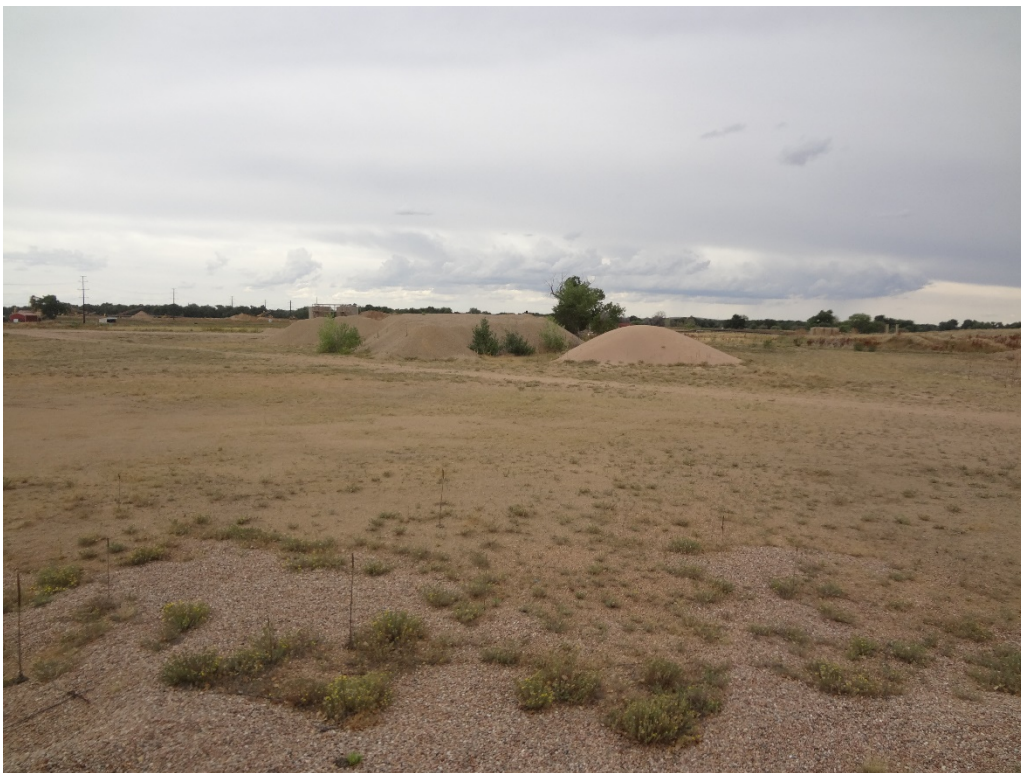
View of Old Ft. Lupton Pit stockpiles