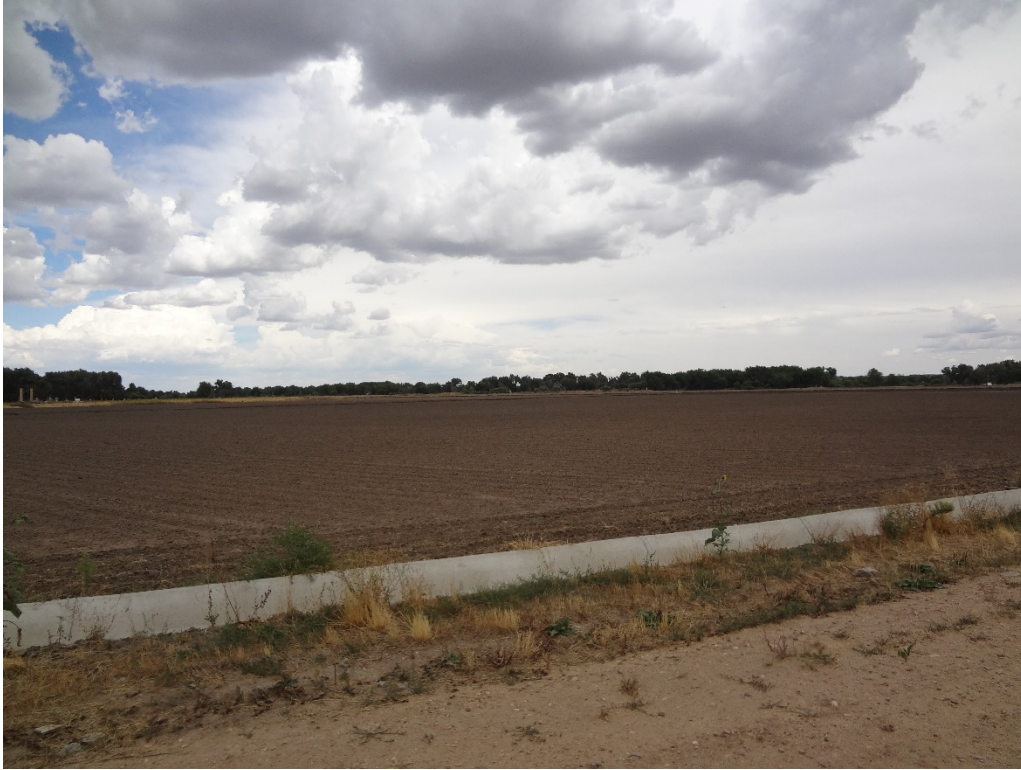
View of Chikuma parcel at end of CR 10.5 looking NE