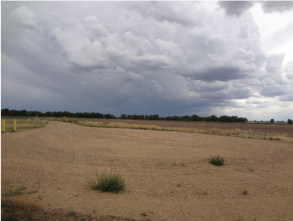
View of Chikuma parcel from gate to Thornton parcel looking south