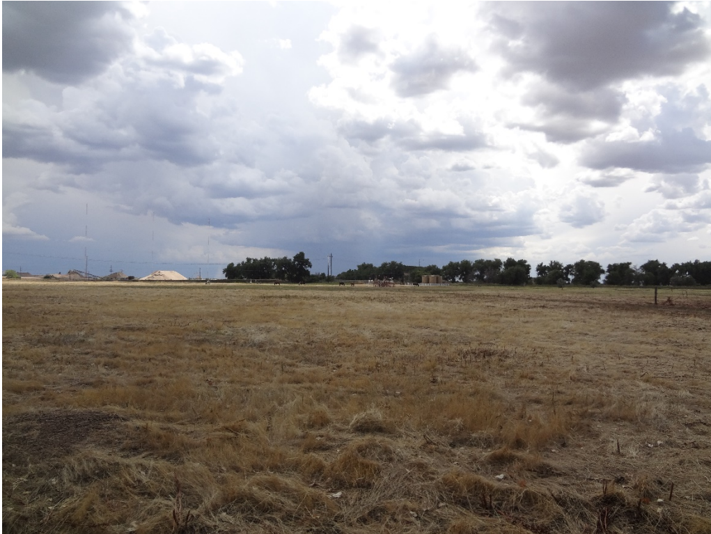
View of Rittenhouse parcel looking south from north side