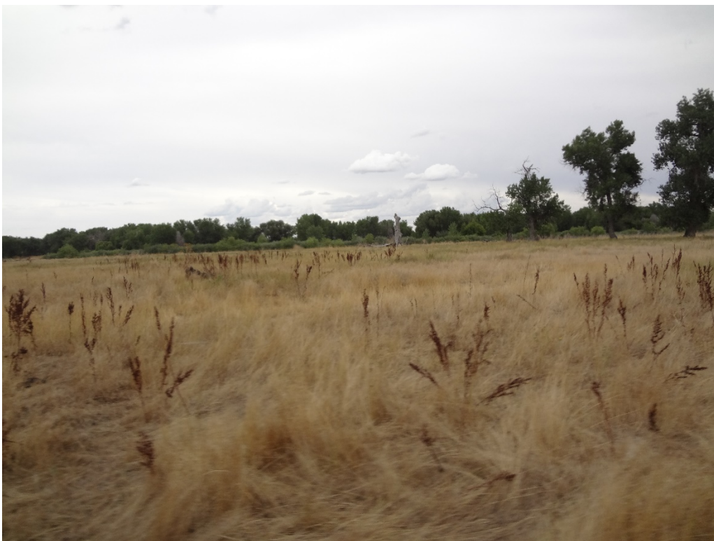
View of Thornton parcel from middle looking east