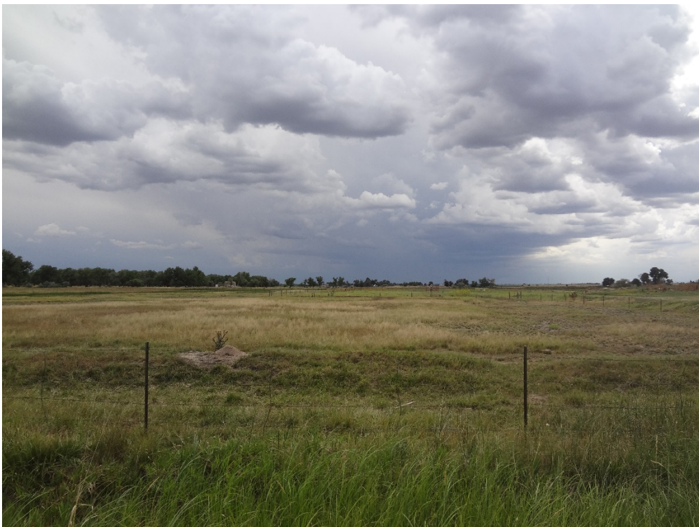
View of Martin Marietta owned parcel from CR 8 looking south