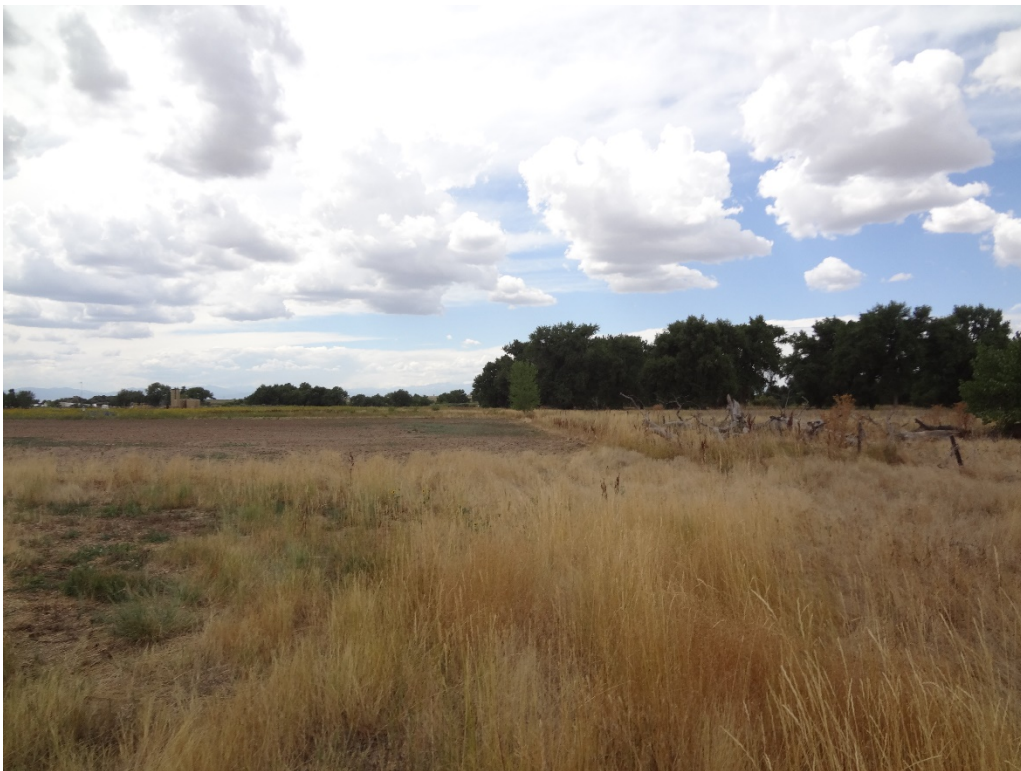
View of Chikuma parcel from gate to Thornton parcel looking west