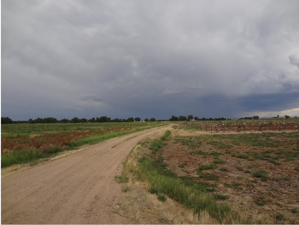
View looking south from corner of MM parcel near Section 12