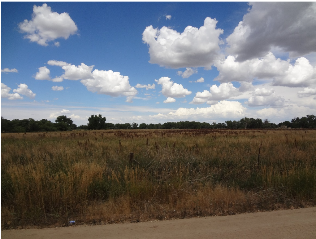
View of Martin Marietta owned parcel from CR 8 looking north