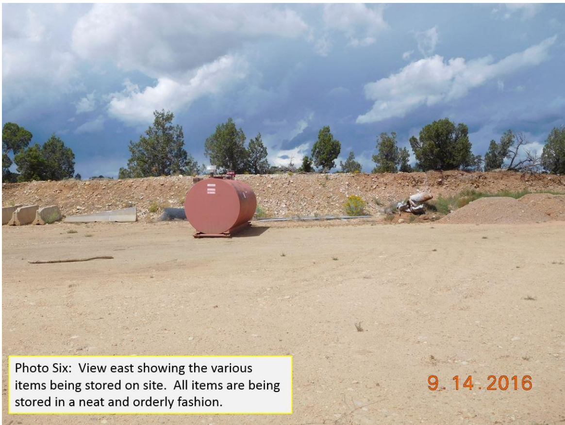
Photo Six: View east showing the various items being stored on site. All items are being stored in a neat and orderly fashion.