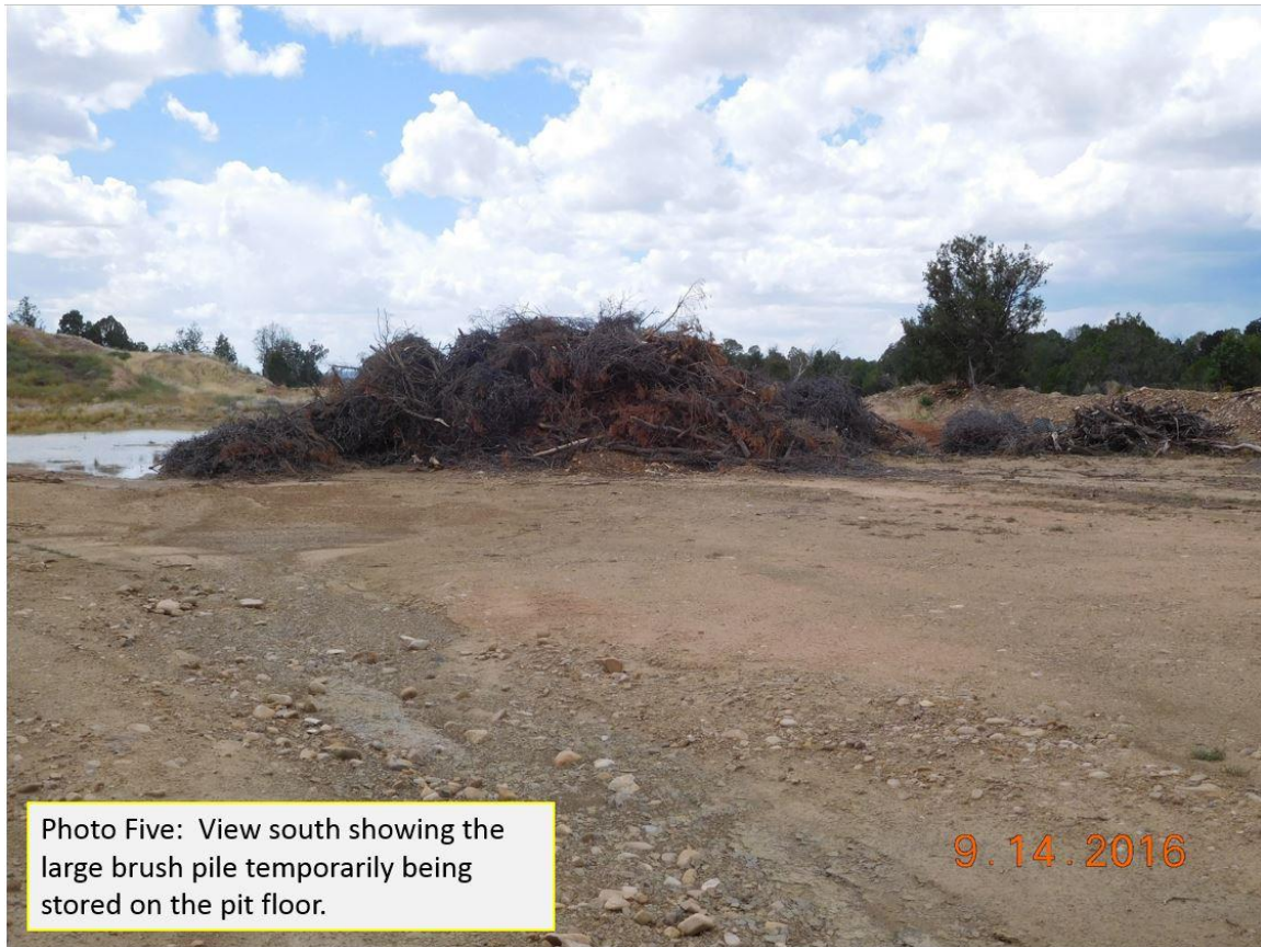
Photo Five: View south showing the large brush pile temporarily being stored on the pit floor.