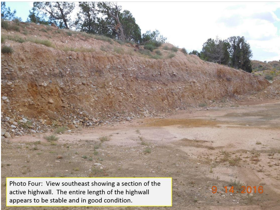
Photo Four: View southeast showing a section of the active highwall. The entire length of the highwall appears to be stable and in good condition.