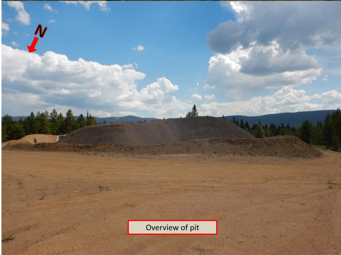
Overview of pit