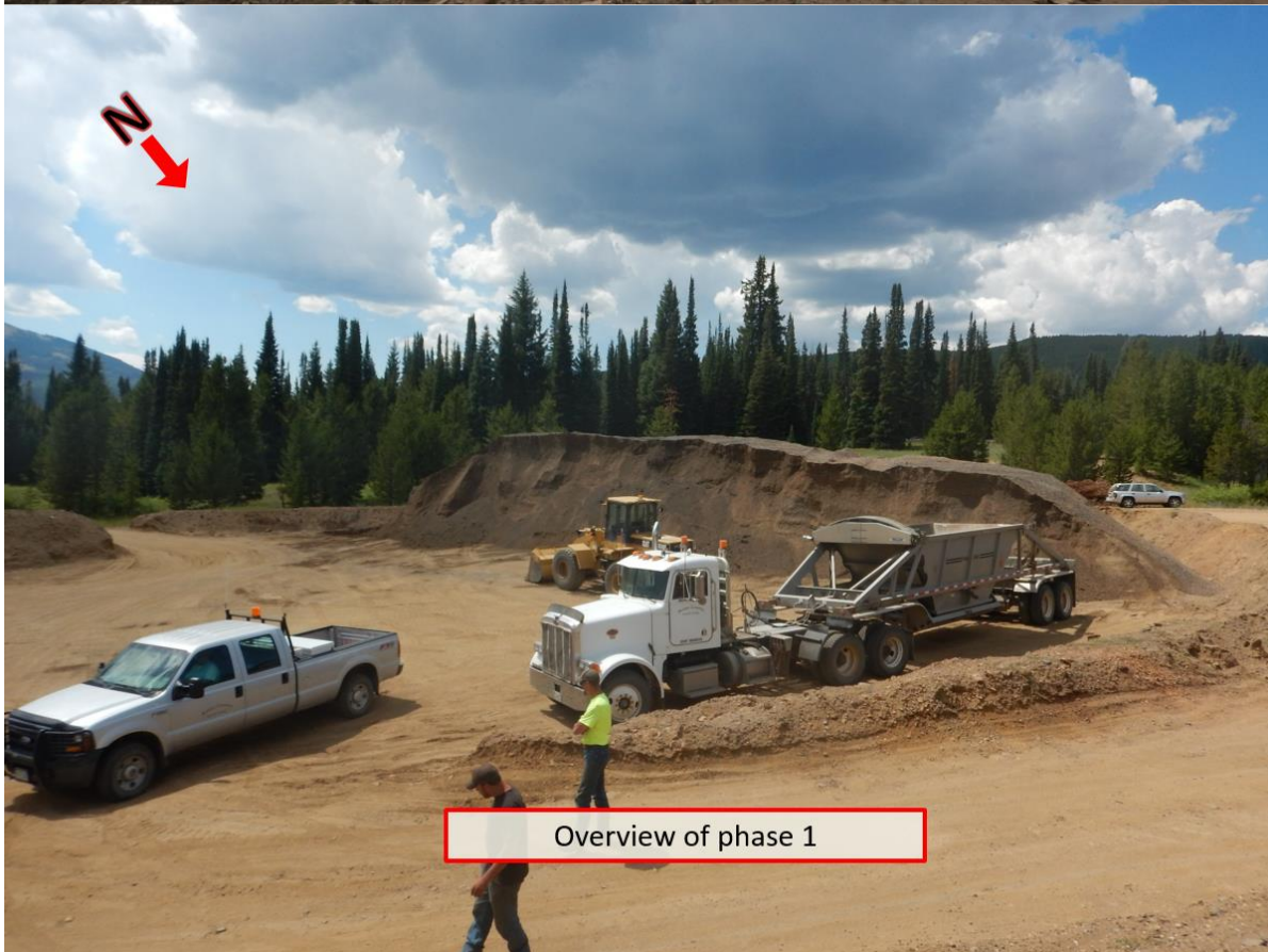
Overview of phase 1