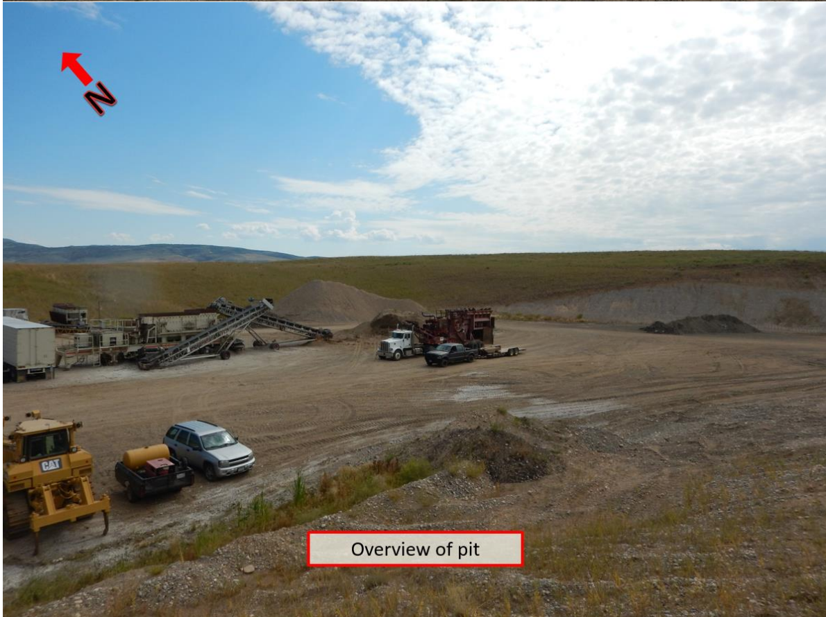
Overview of pit