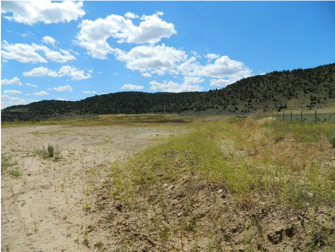
Phase 1 yet to be mined.