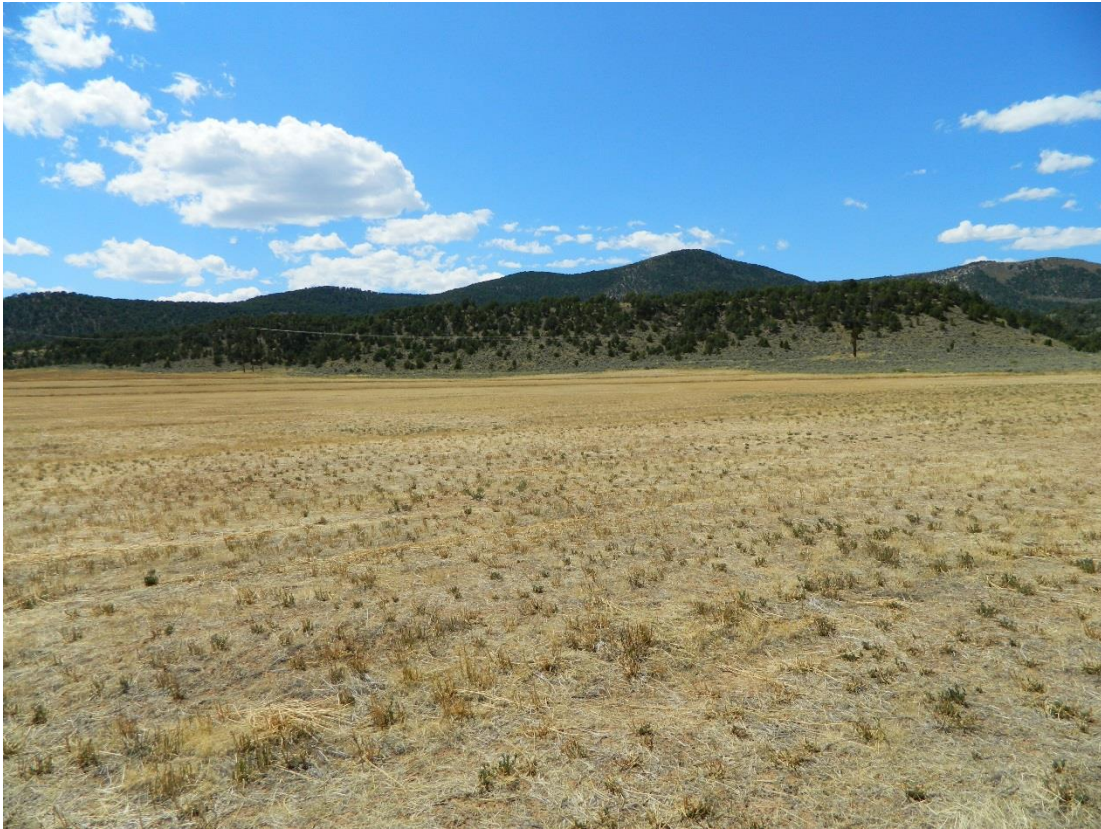
Unmined Phase 2 to be released.