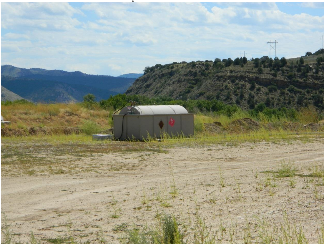
Fuel tank stored in secondary containment Phase 1.