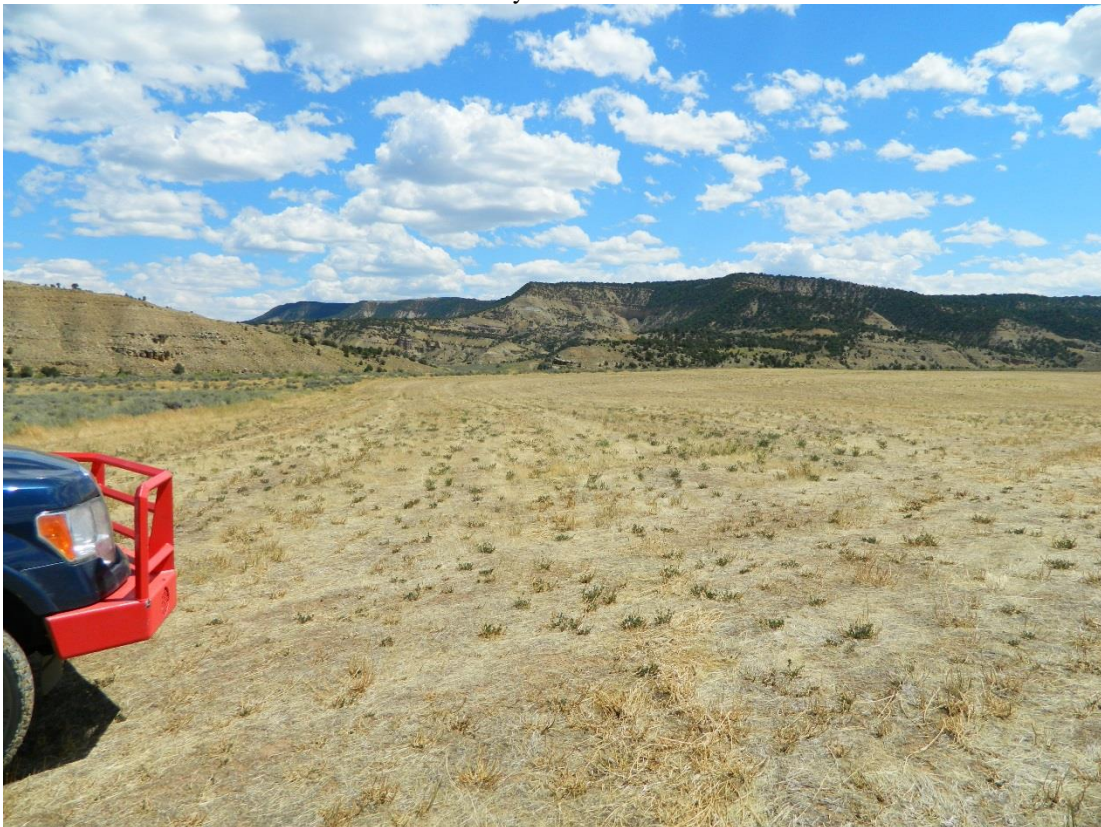
Unmined Phase 2 to be released.