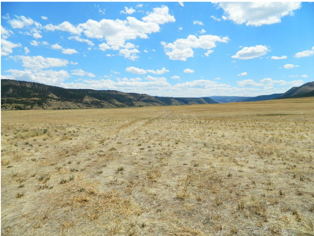
Unmined Phase 2 to be released.