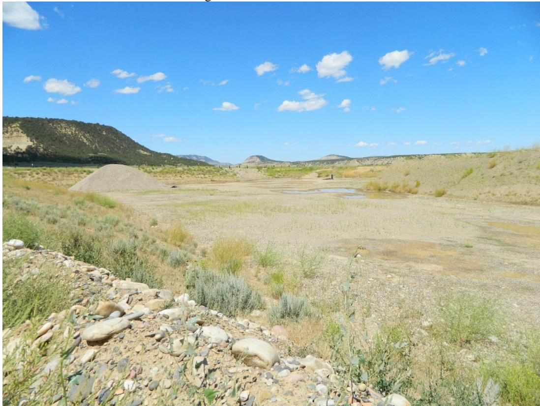
Active mining area in Phase 1.