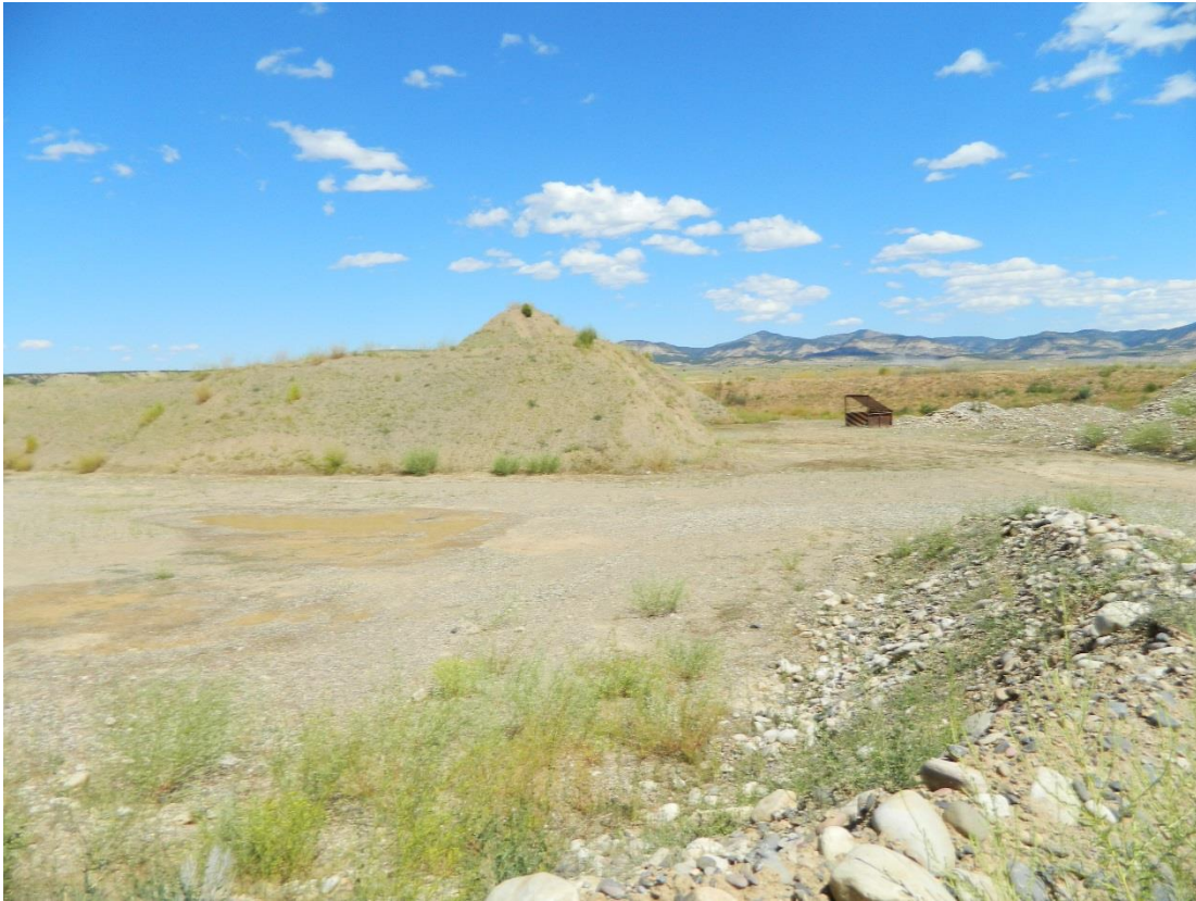
Stockpiled material in Phase 1.