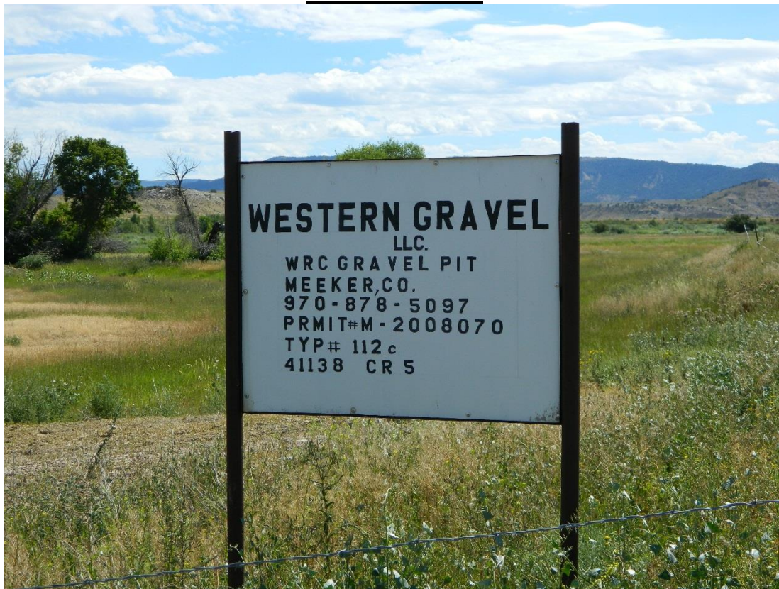
Sign located at main entrance.