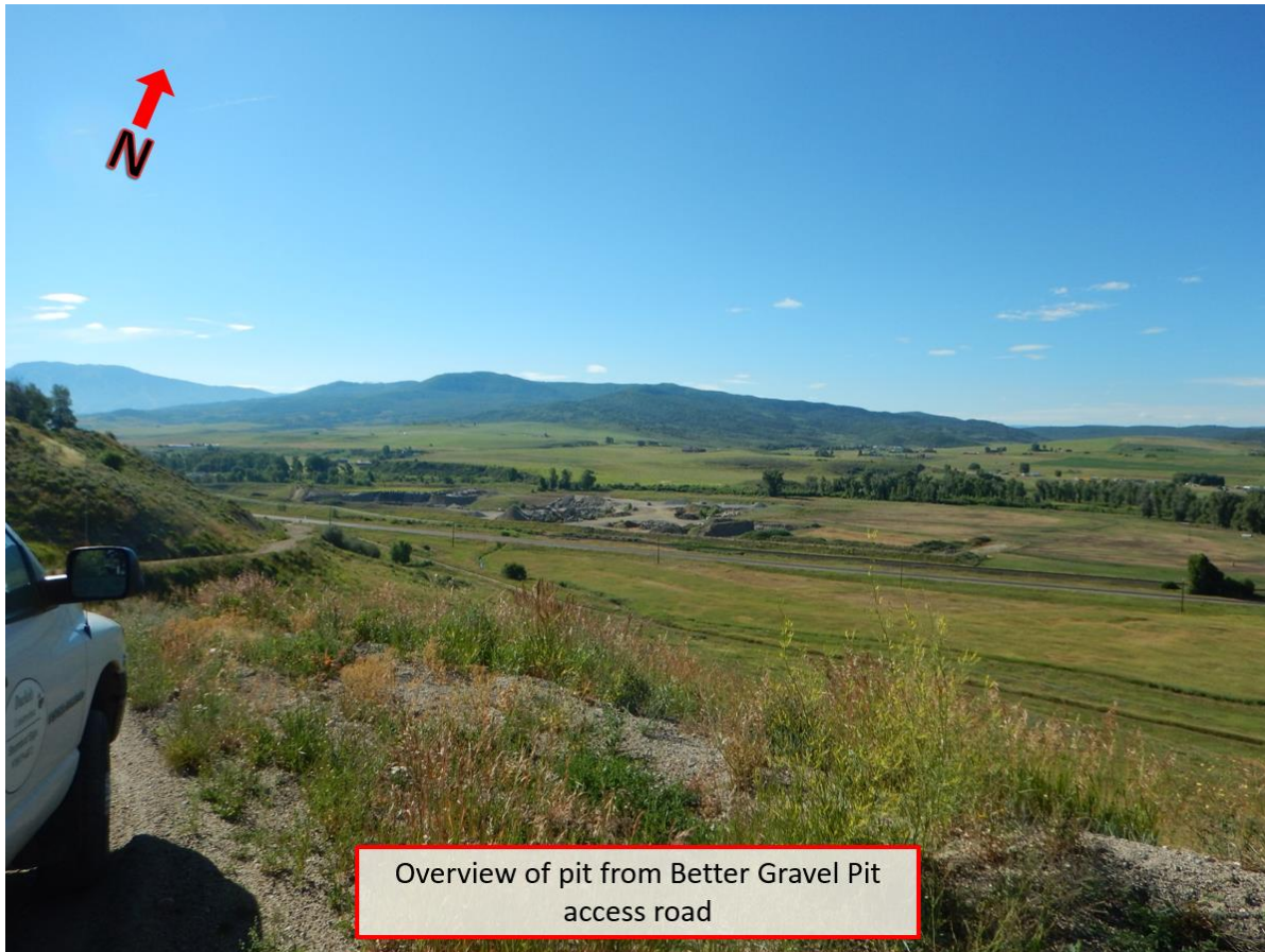
Overview of pit from Better Gravel Pit access road