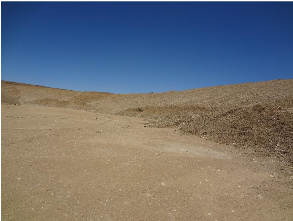
Looking north from SE corner of pit floor