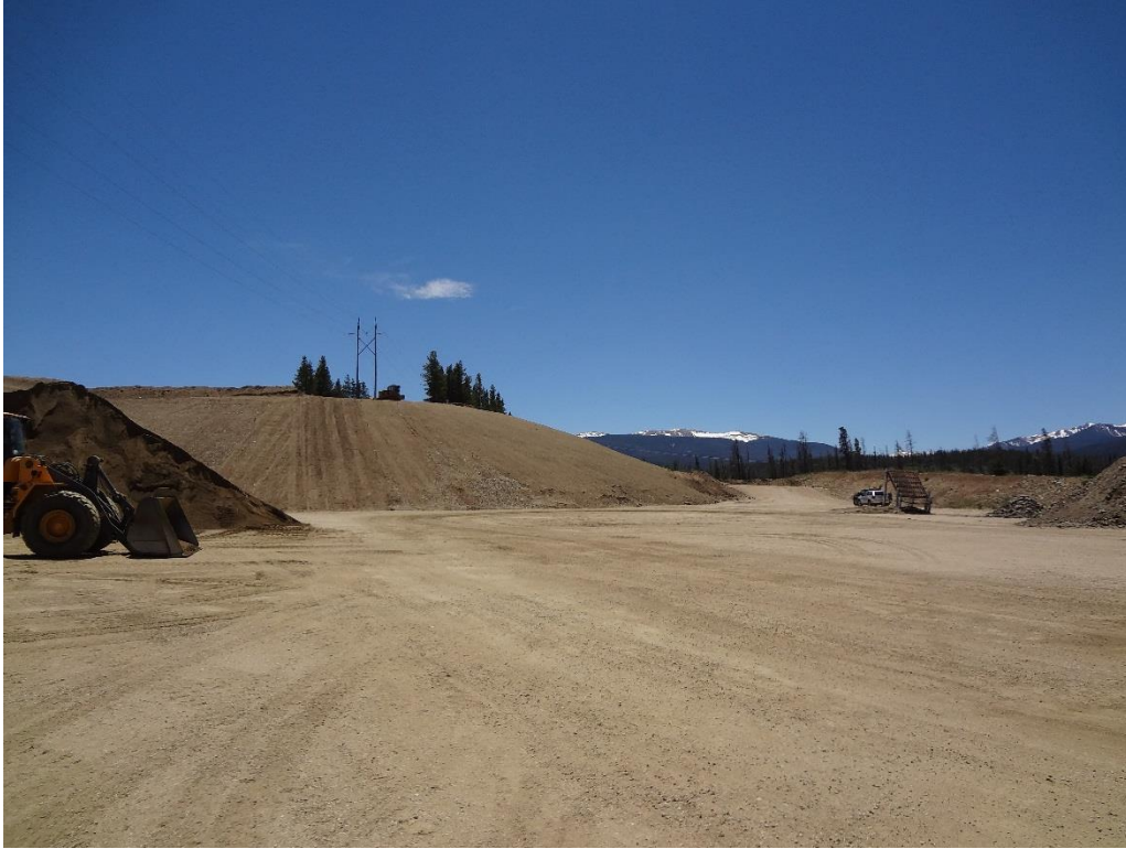
Looking south at south powerline peninsula