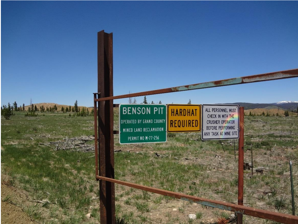
Benson Pit mine sign