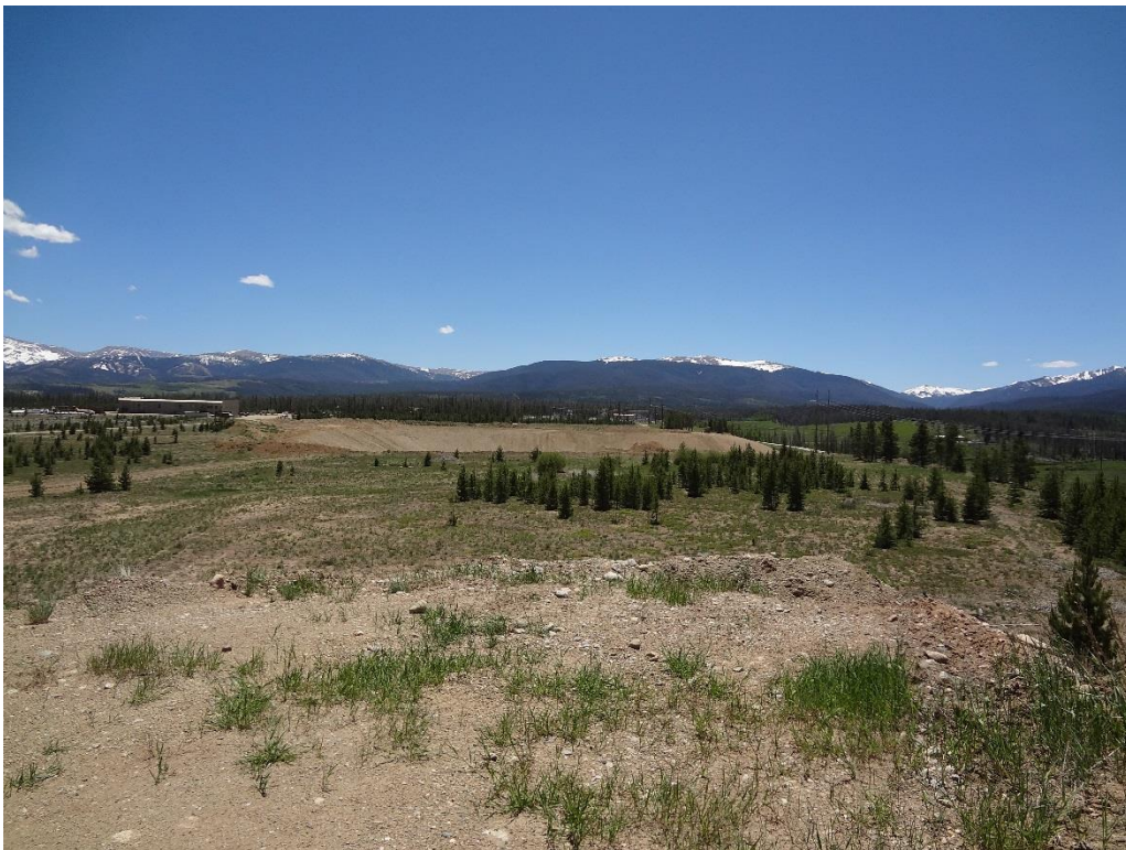
Looking south from topsoil stockpile at current pit