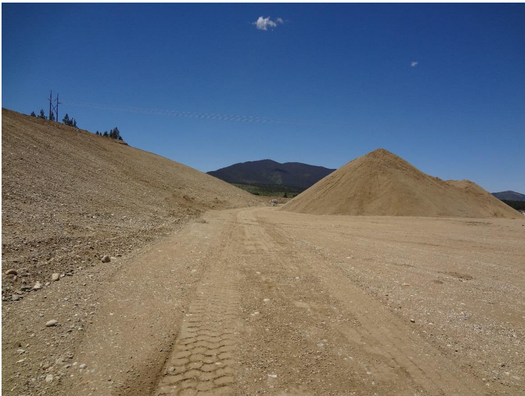
Looking west from SE corner of pit floor