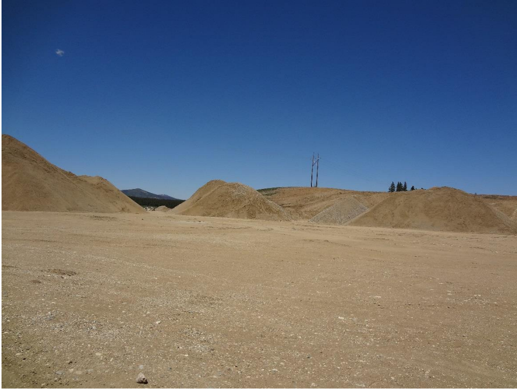
Looking NW from SE corner of pit floor