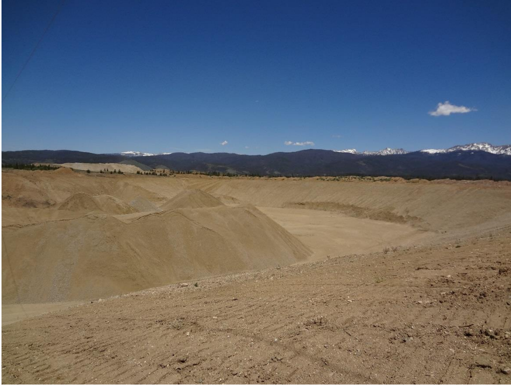
Looking NE from south powerline peninsula