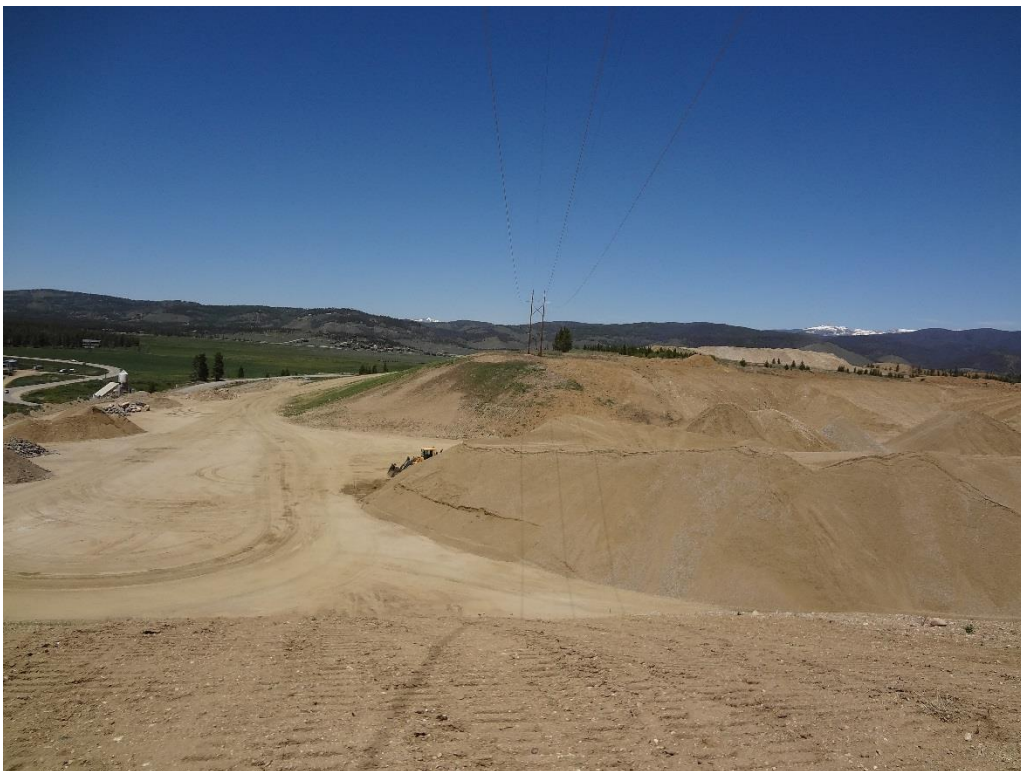
Looking north from south powerline peninsula