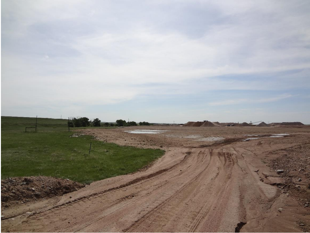
Looking SE from NW corner of site