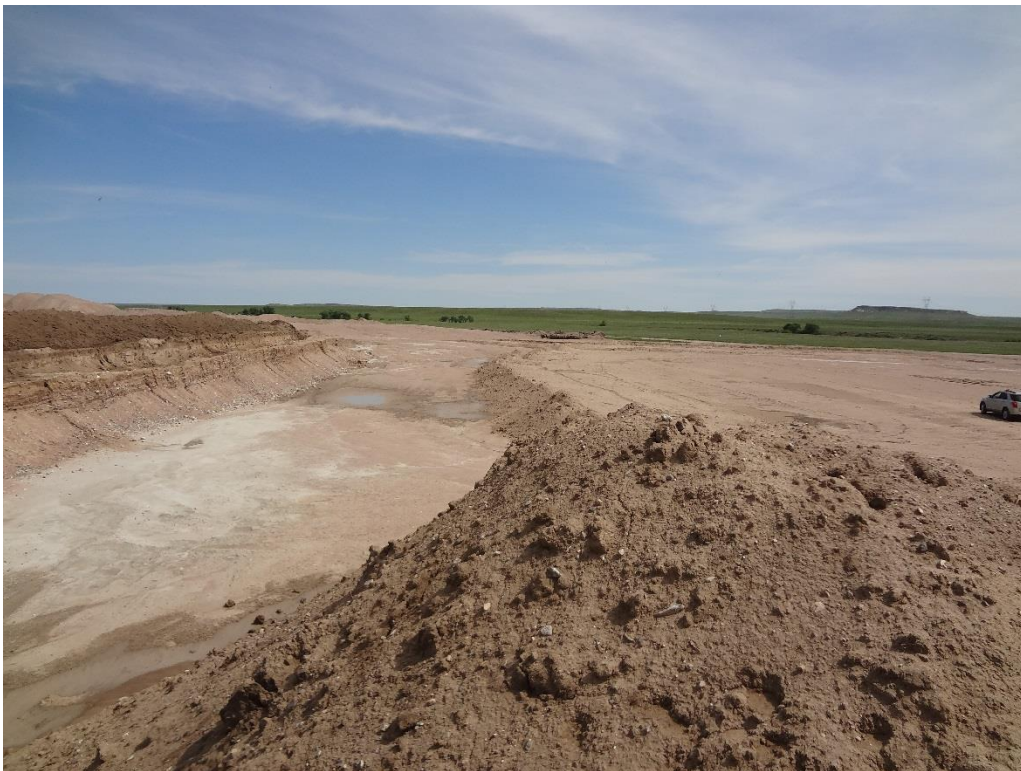
Looking north from south end of site at concurrent reclamation