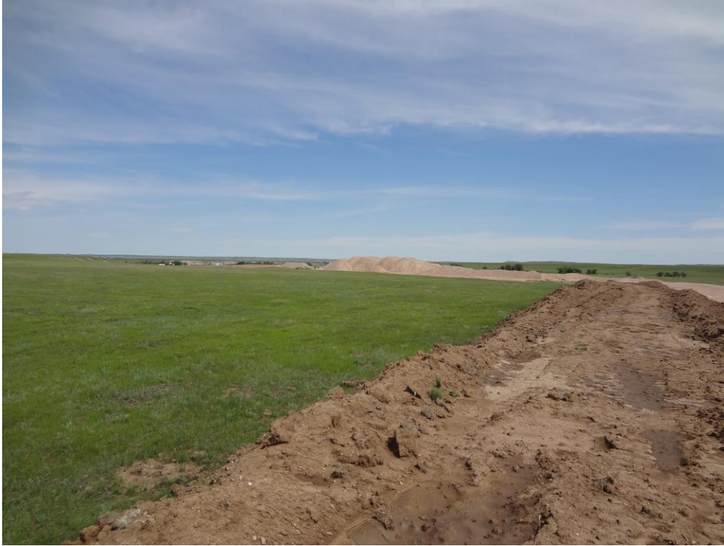
Looking NW from SW corner of disturbance area