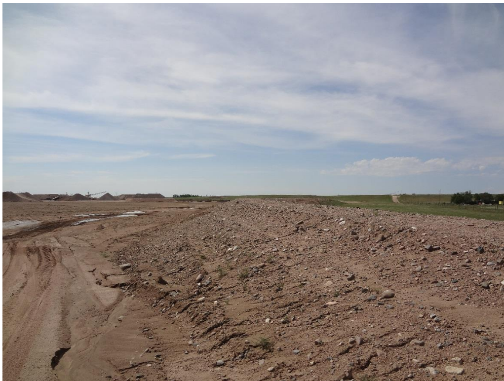
Looking south from NW corner of site