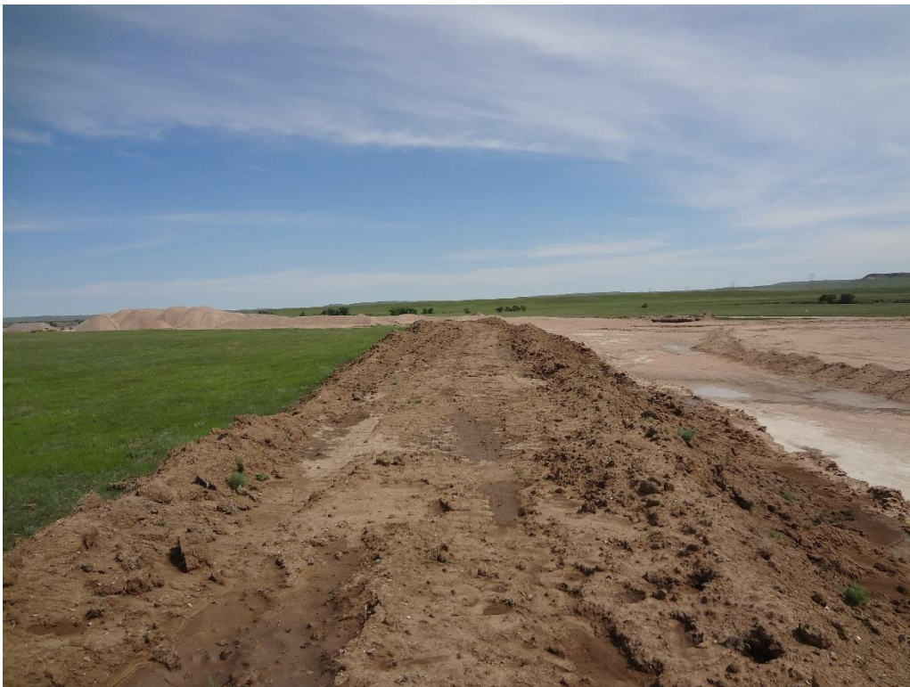
Looking north from SW corner of disturbance area