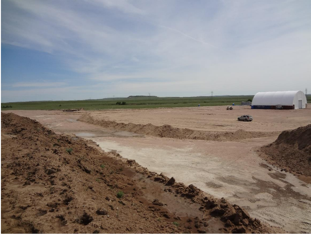
Looking NE from SW corner of disturbance area