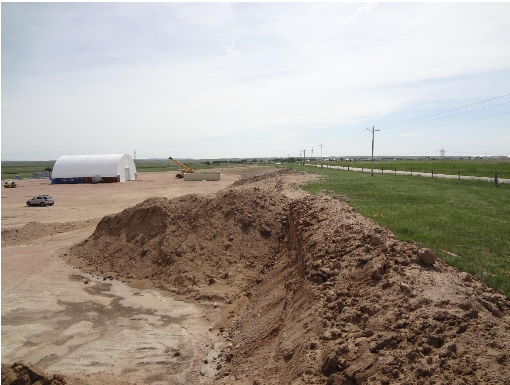
Looking east from SW corner of disturbance area