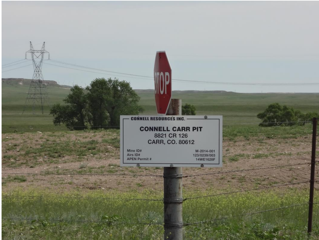
Connell Carr Pit sign