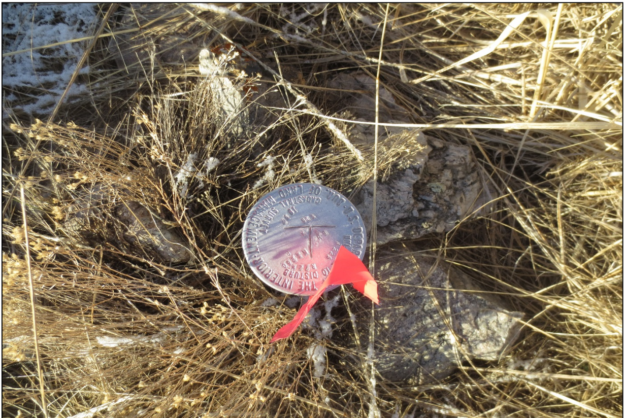
Photo 4: BLM monument, which is being used as a affected land boundary marker.