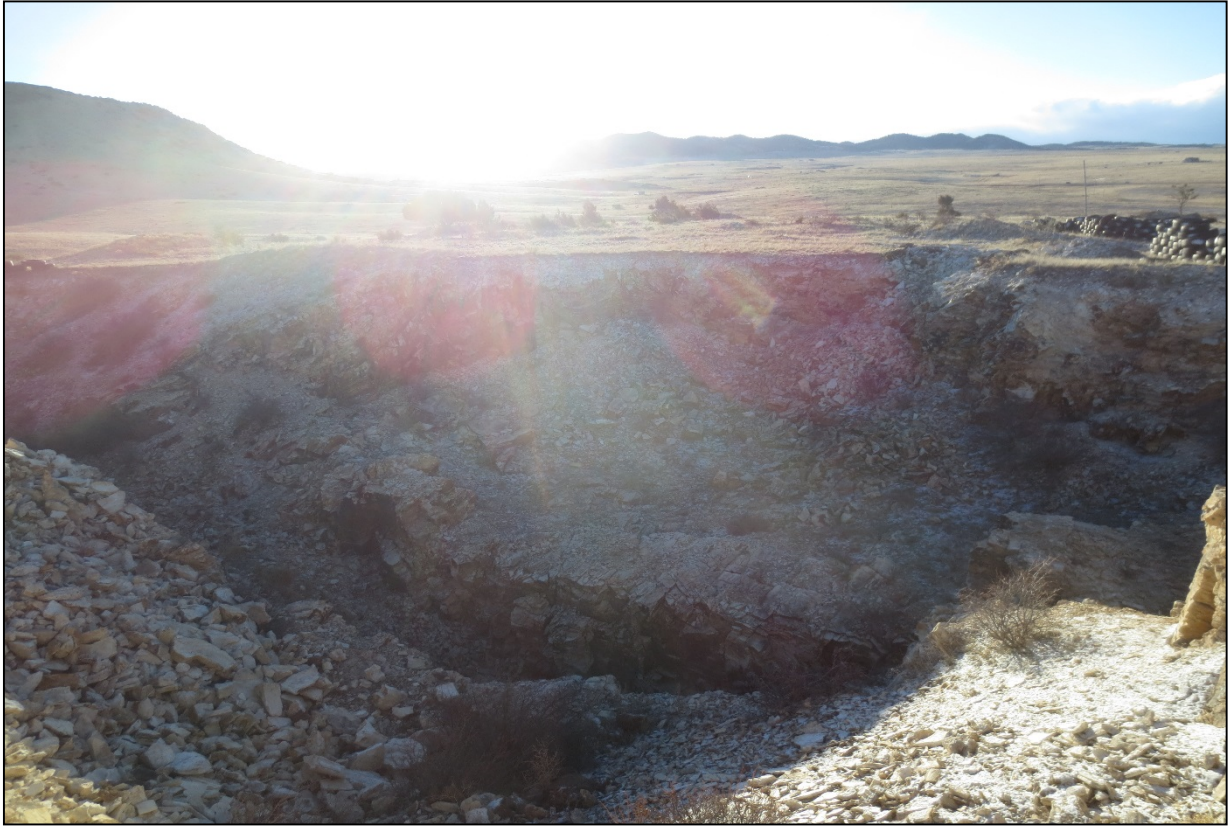
Photo 1: Slot where quarrying will beginning. The slot is as deep as 30 feet in a few areas.