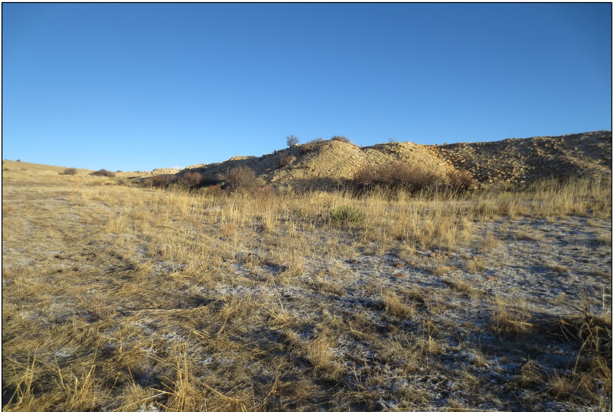
Photo 2: Stockpile of development rock/ waste rock from the old adit.