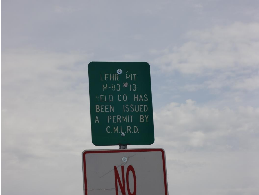
Lehr Pit mine sign