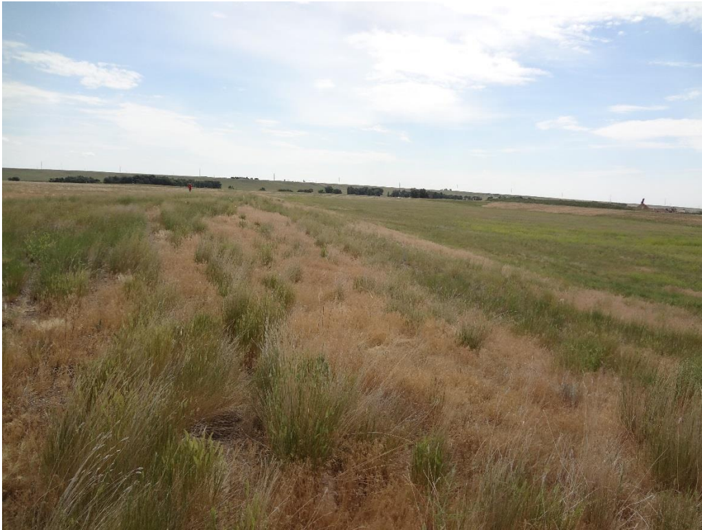
Looking east from NW corner of site