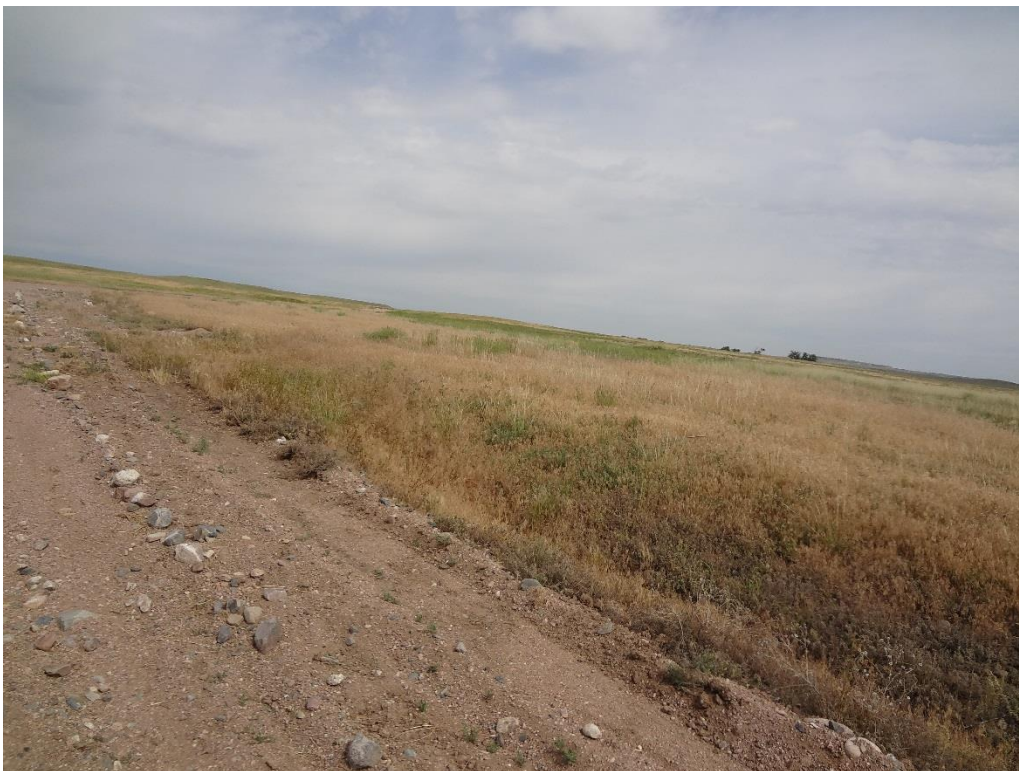
Looking NW at cheatgrass patch along access road