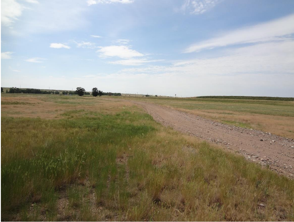
Looking south from topsoil stockpile