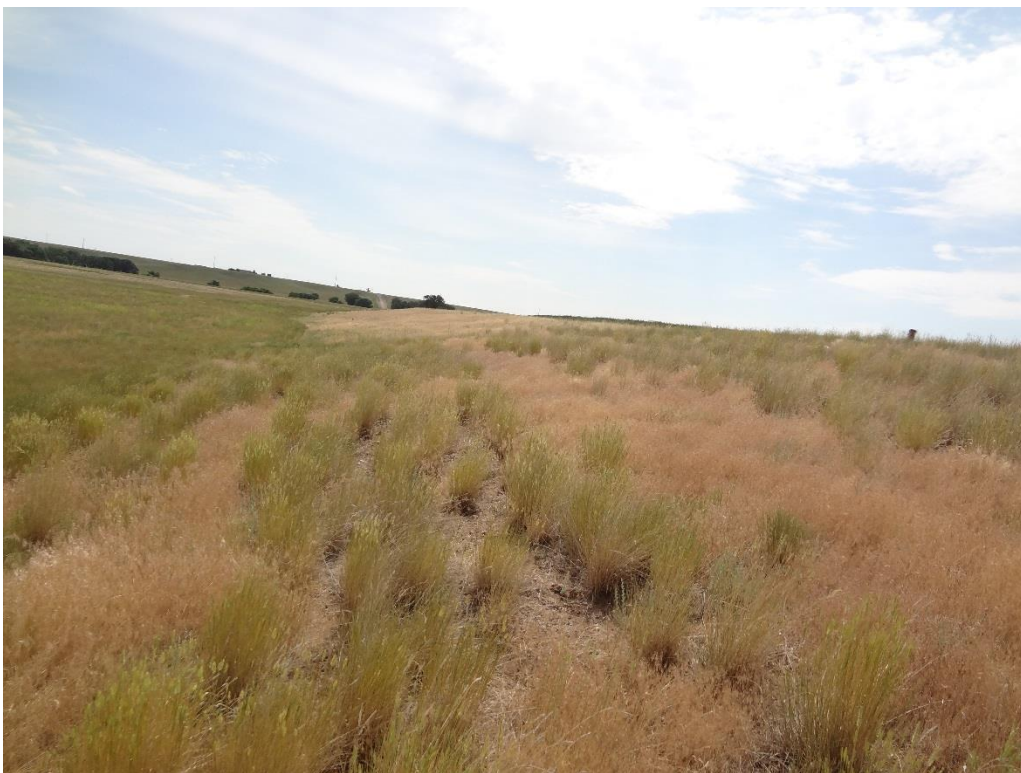
Looking east at cheatgrass and crested wheatgrass on south slope