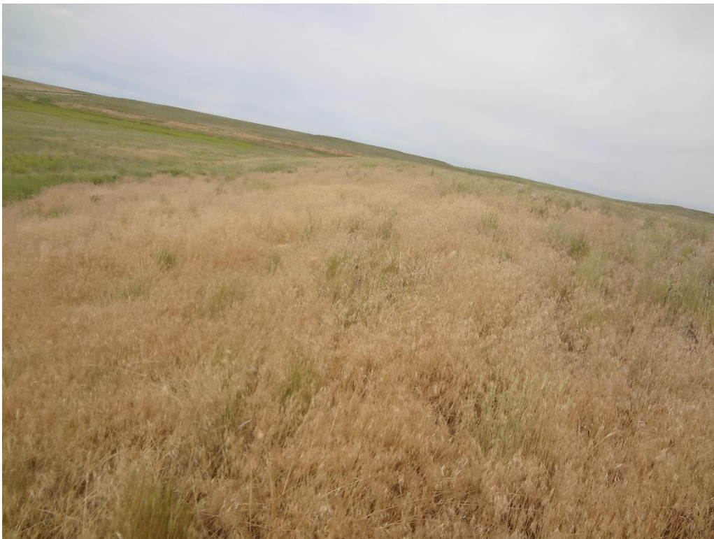
Looking west at cheatgrass patch on north slope