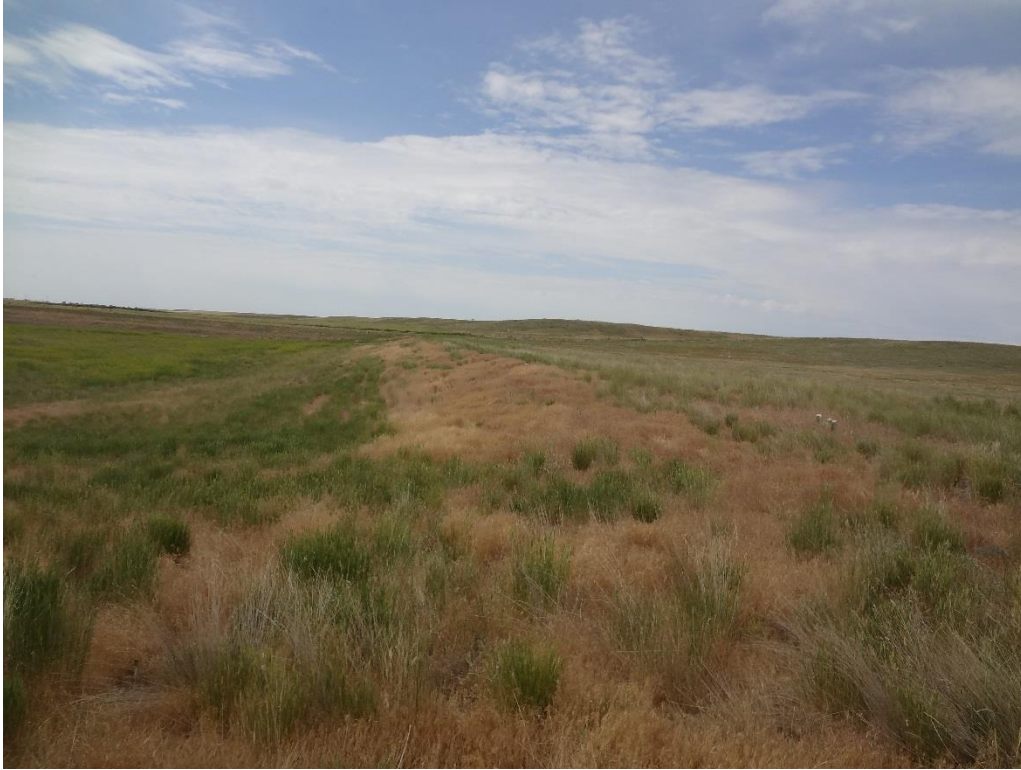
Looking south from NW corner of site at cheatgrass on west slope