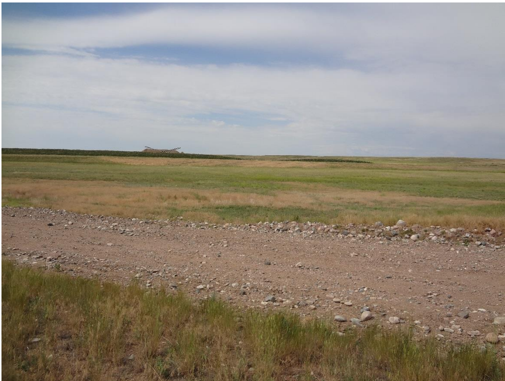
Looking southwest from topsoil stockpile