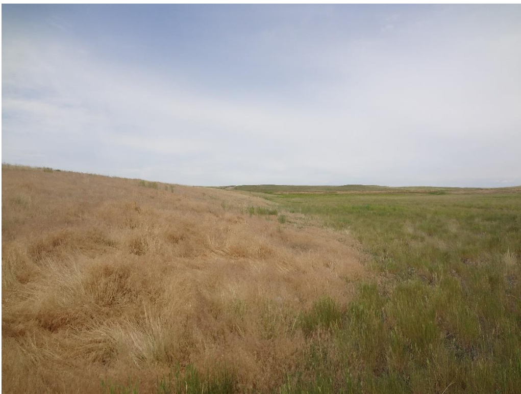
Looking at large cheatgrass patch at east end of the south slope