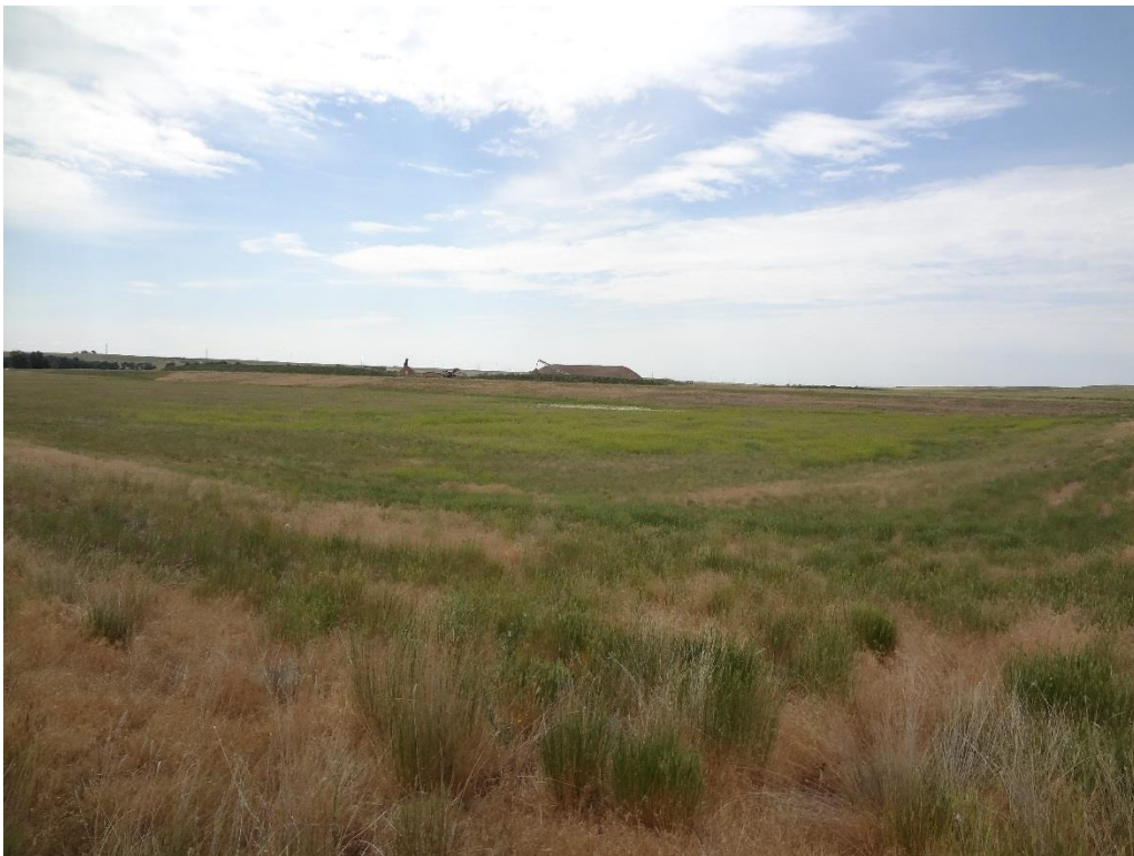
Looking SE from NW corner of site