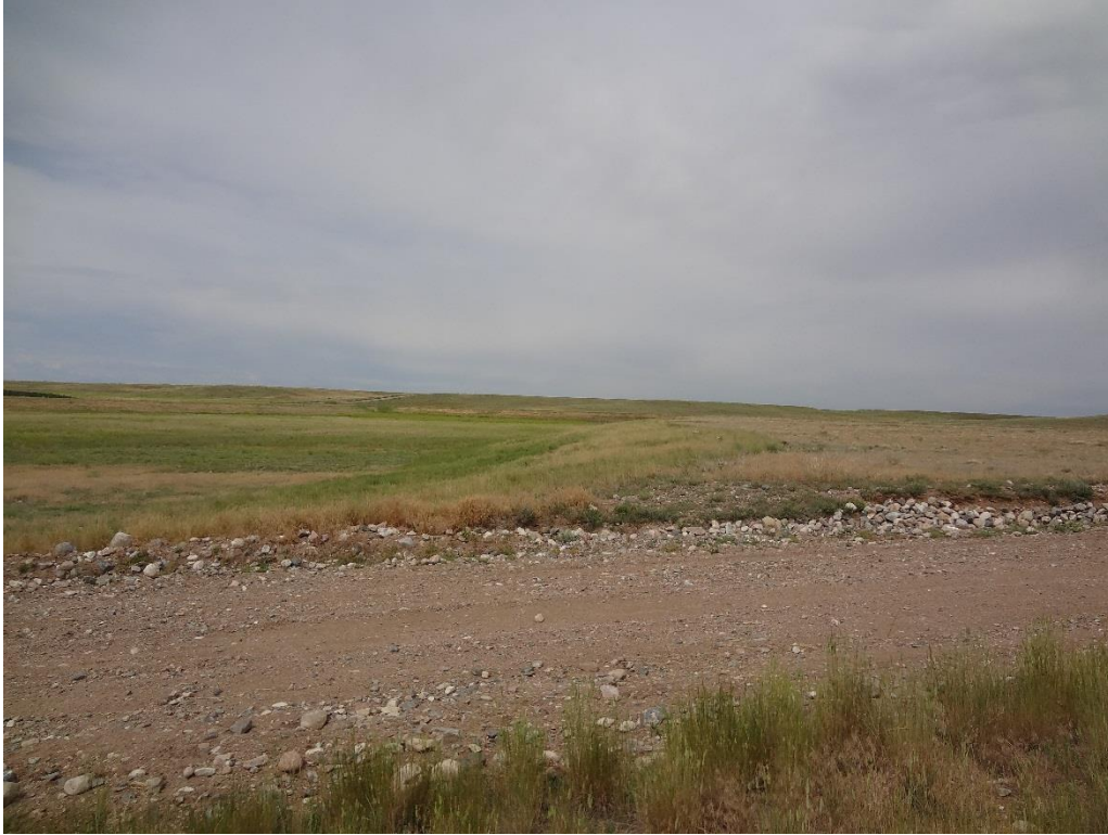
Looking west from topsoil stockpile