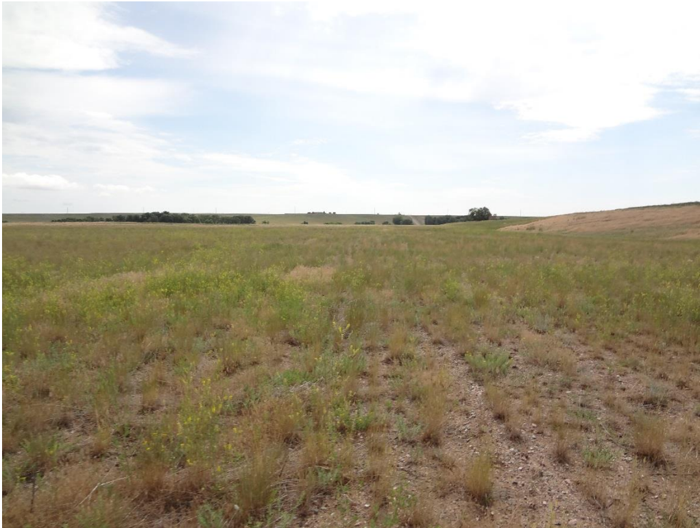
Looking east at southeast corner of pit floor