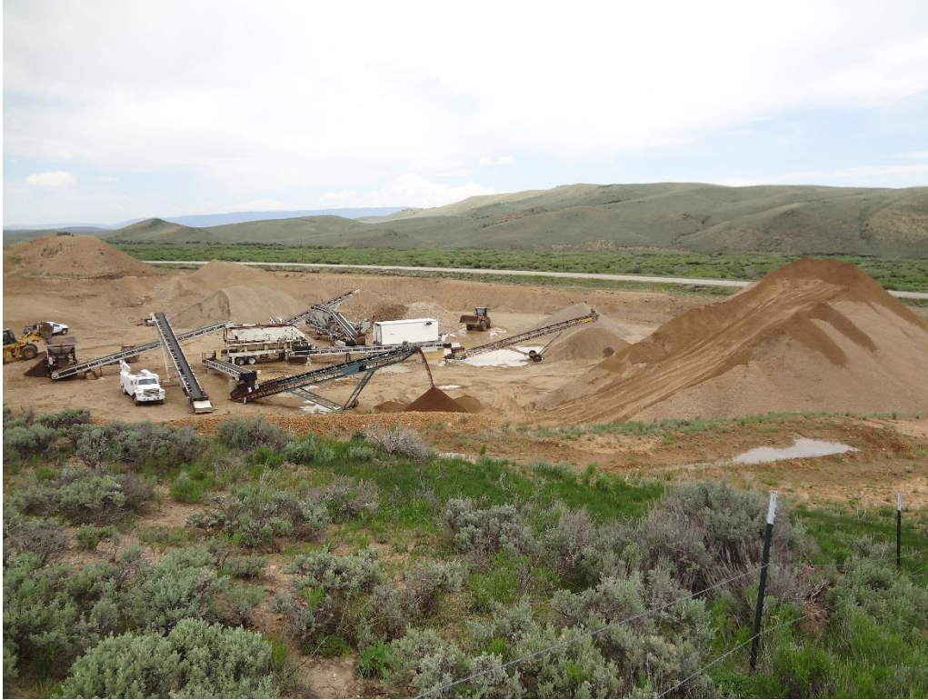
Looking processing plant and stockpiles on pit floor