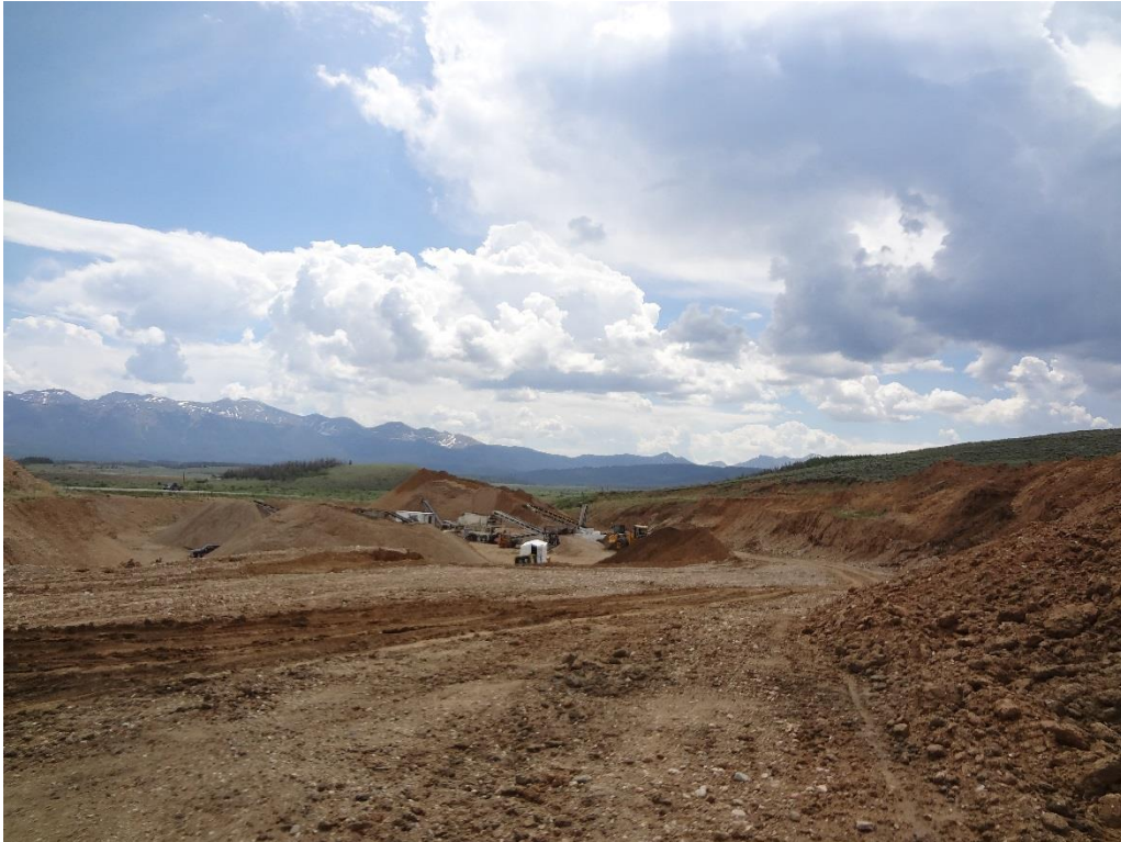
Looking SE at pit floor and processing plant