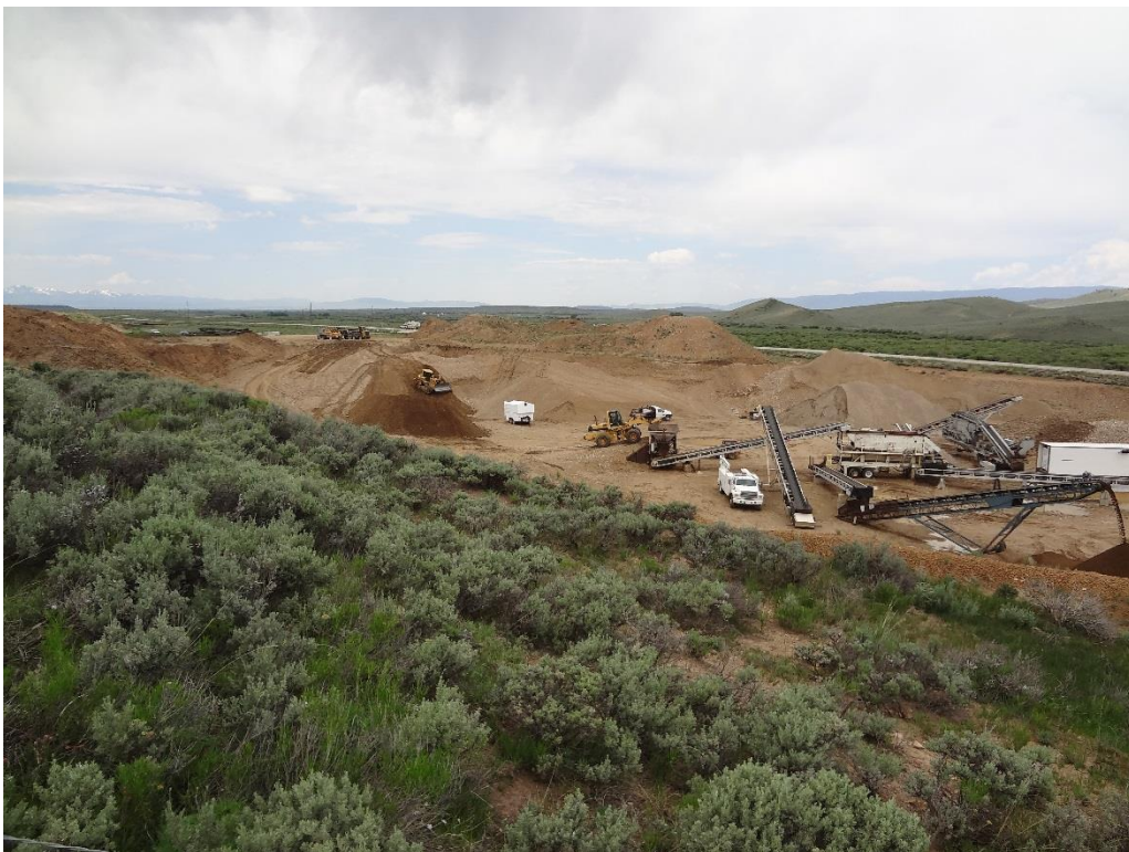
Looking NW at mining activity