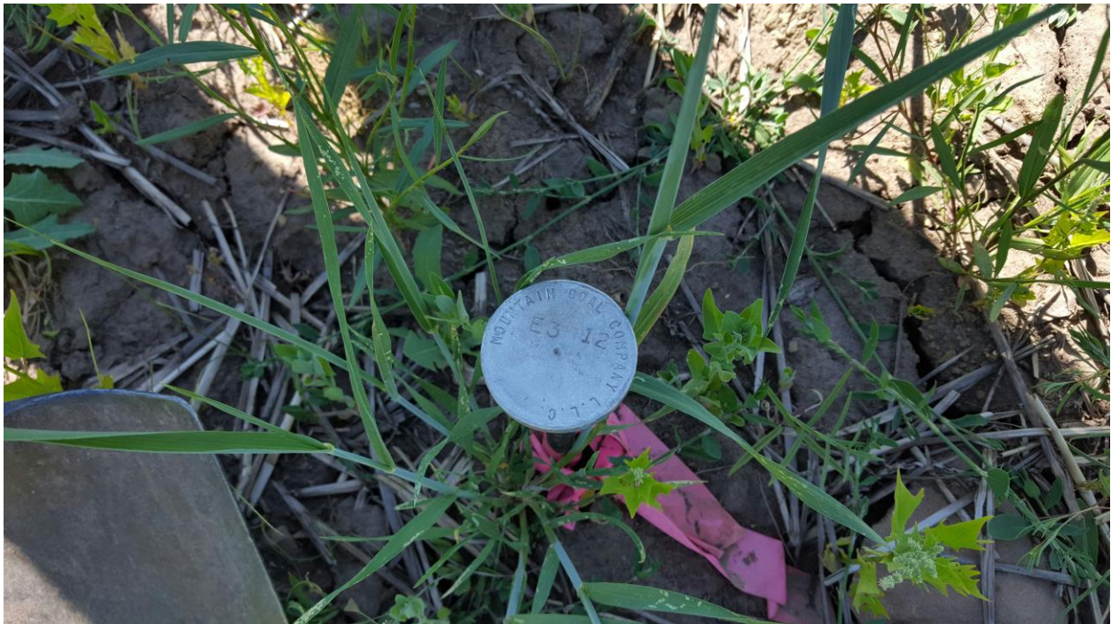
Figure 10: E3-12

Number of Partial Inspection this Fiscal Year: 8