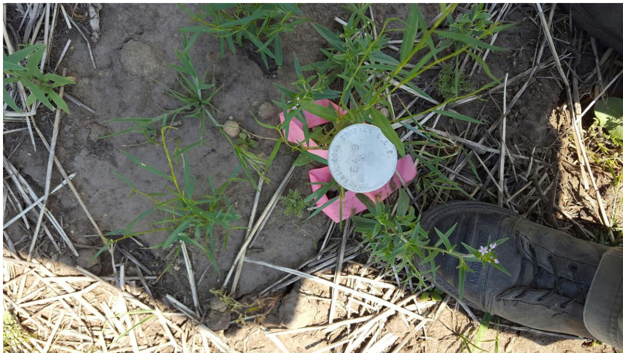
Figure 19: E4-09