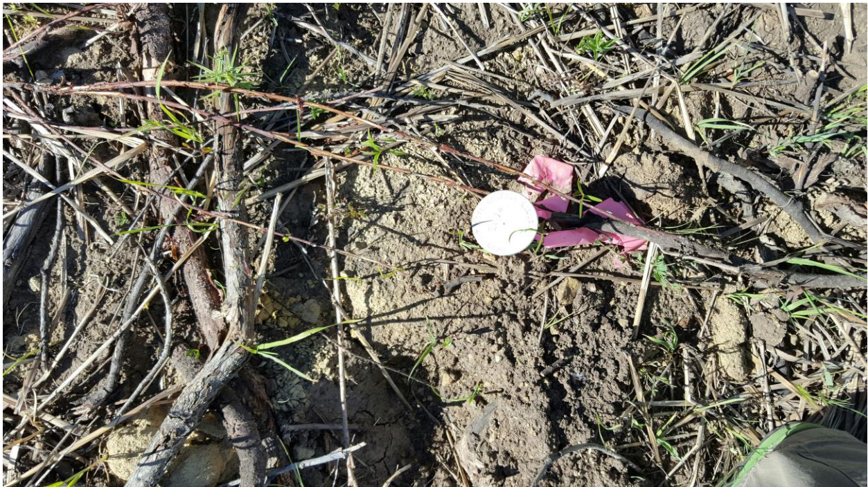
Figure 24: E4-14

Number of Partial Inspection this Fiscal Year: 8