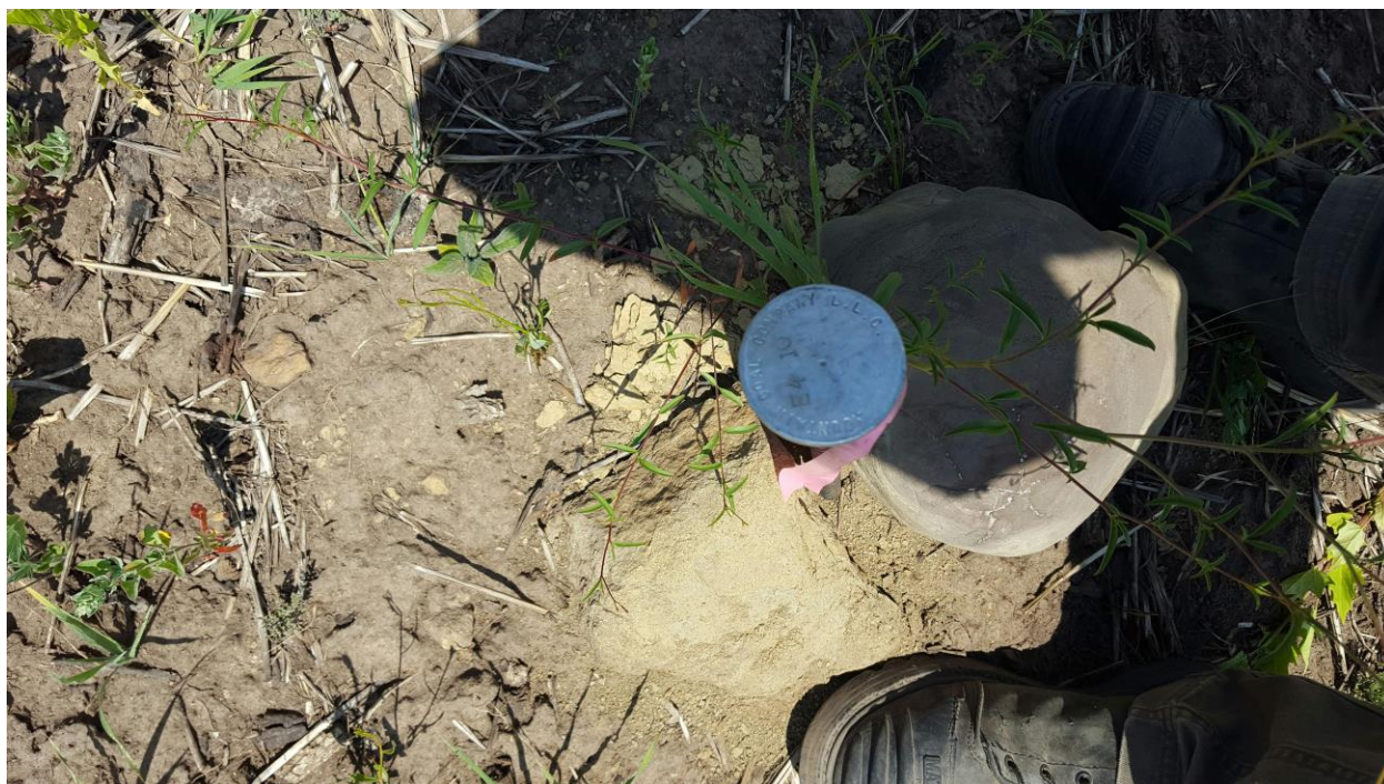
Figure 20: E4-10

Number of Partial Inspection this Fiscal Year: 8