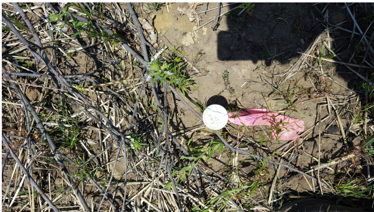
Figure 12: E4-02

Number of Partial Inspection this Fiscal Year: 8