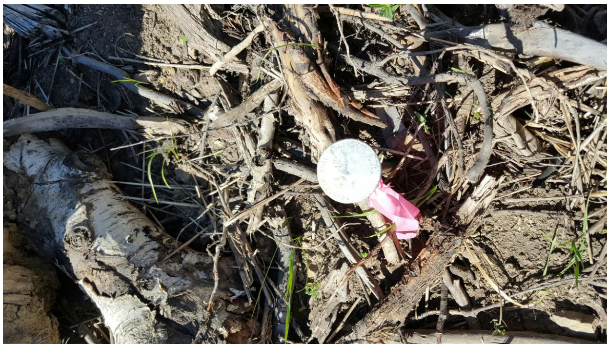
Figure 22: E4-12

Number of Partial Inspection this Fiscal Year: 8