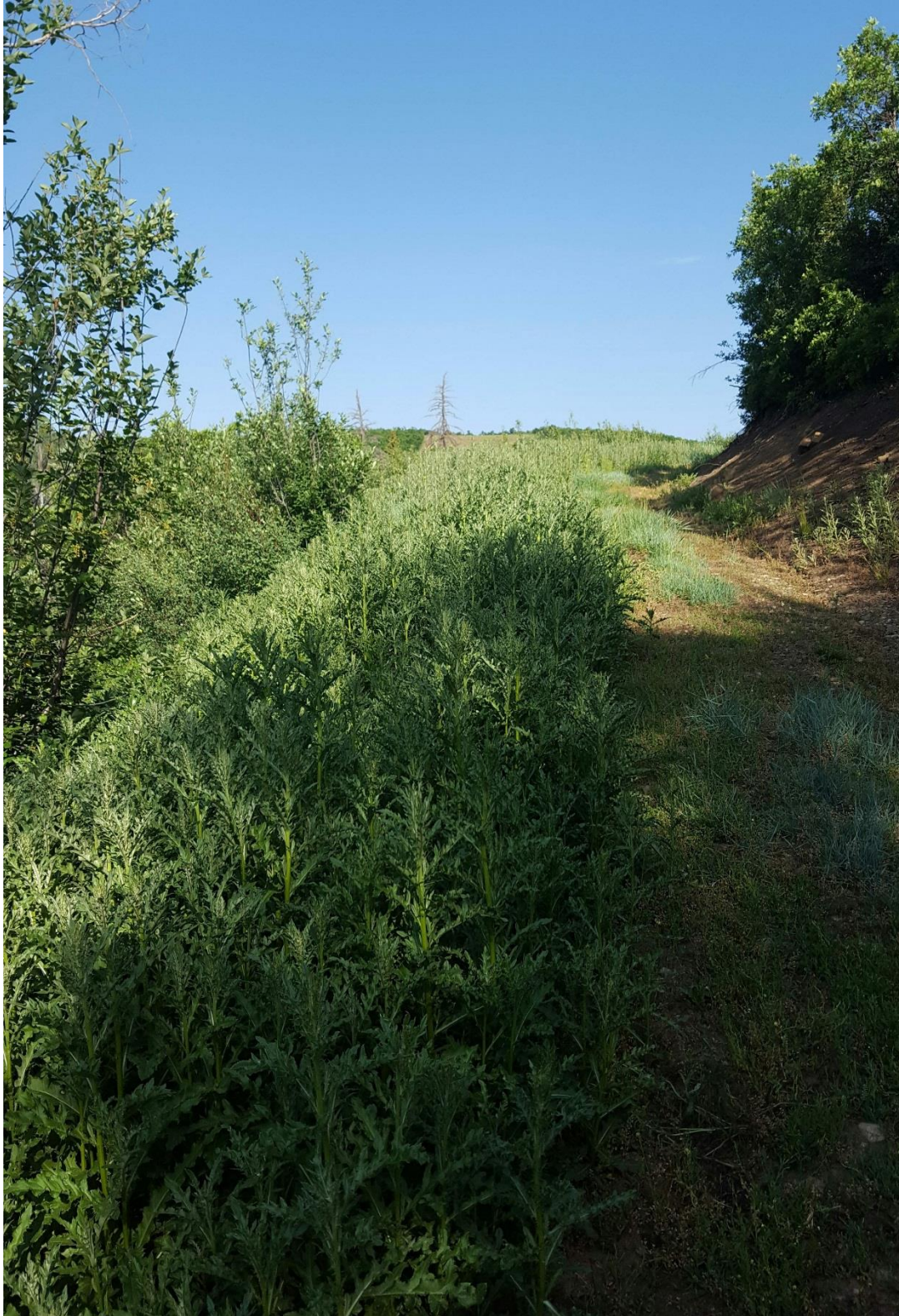
Figure 8: Dense thistle along Upper Deep Creek Road, south of 96-2-2

Number of Partial Inspection this Fiscal Year: 8