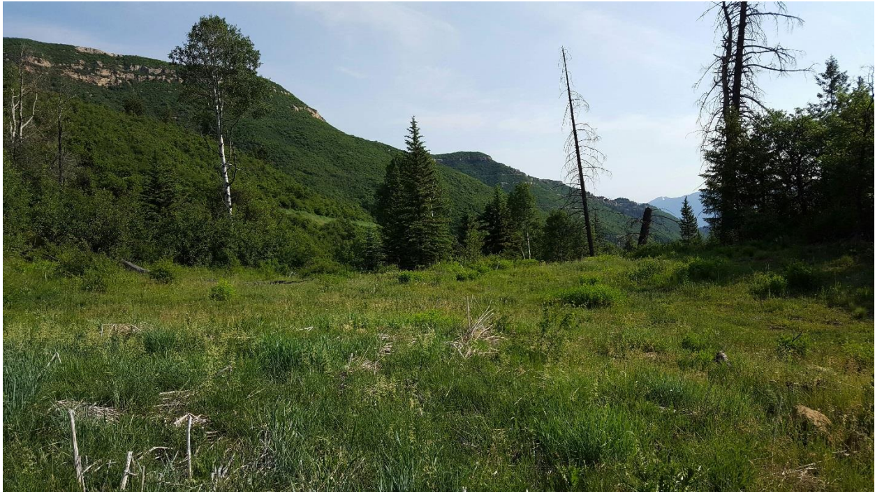
Figure 6: Dense patch of thistle on 16-01