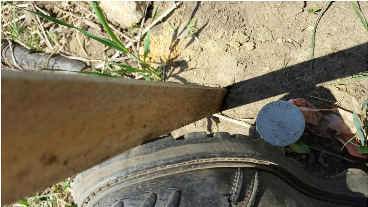
Figure 18: E4-08

Number of Partial Inspection this Fiscal Year: 8