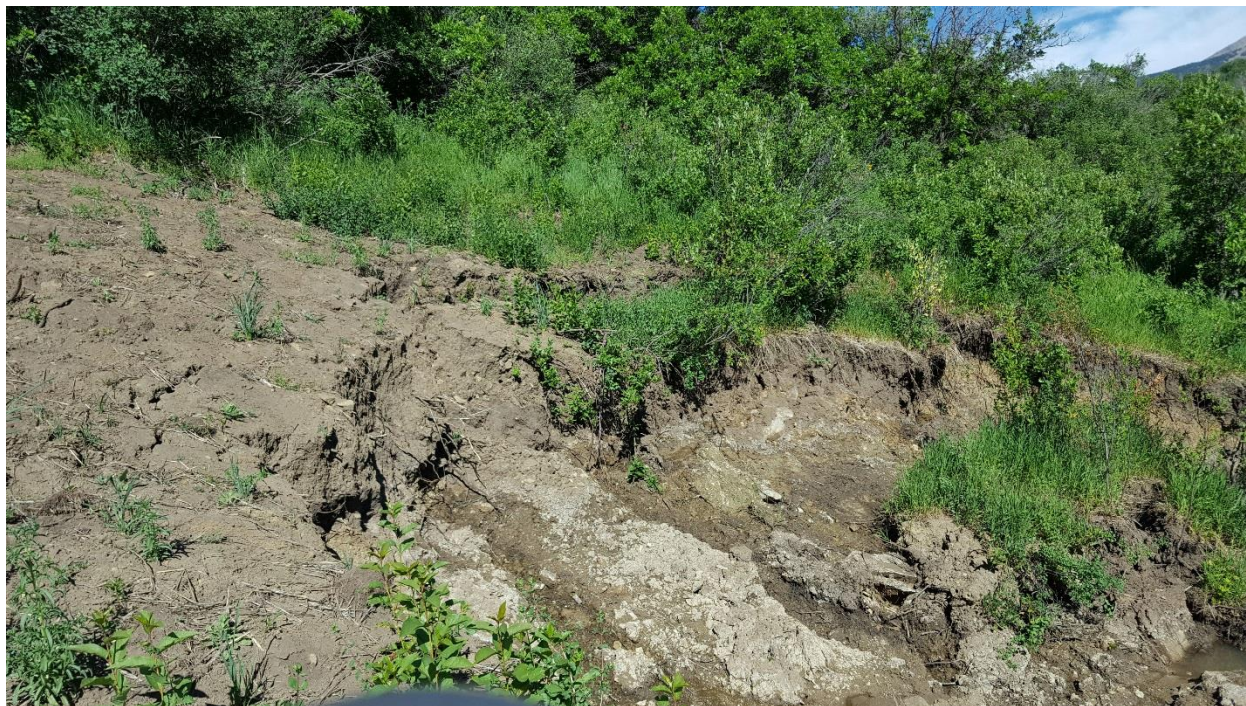
Figure 2: Slump on E3-17.5