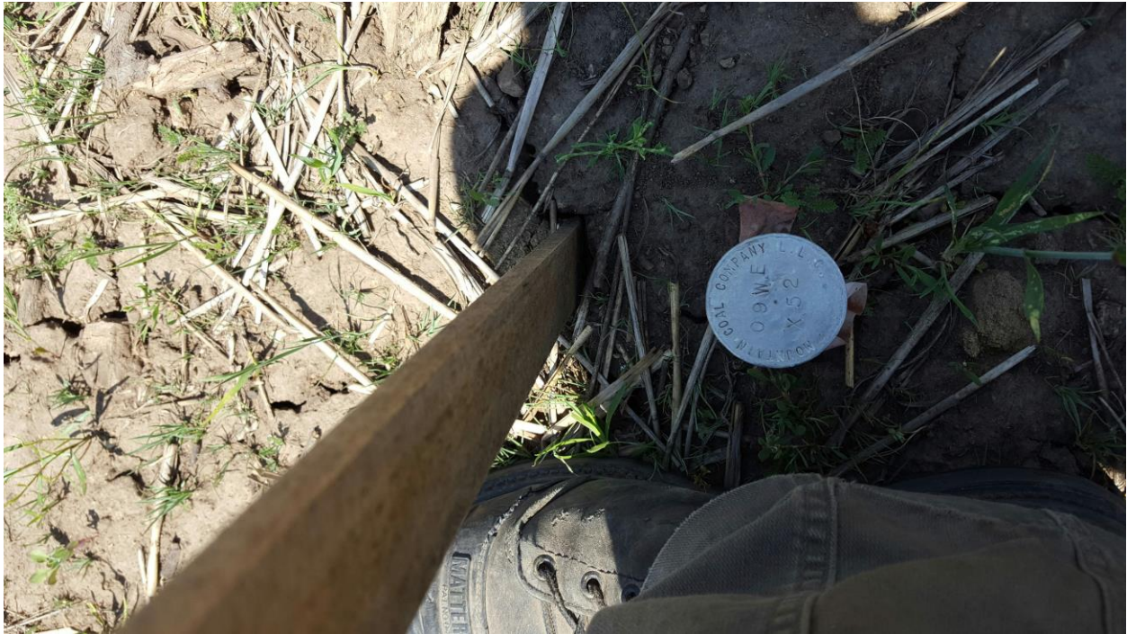
Figure 9: 09LWE4X52