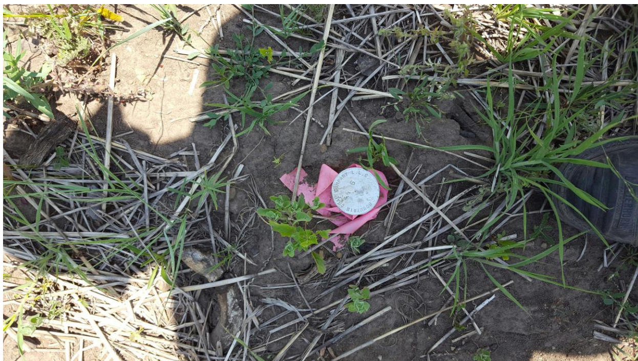
Figure 16: E4-06

Number of Partial Inspection this Fiscal Year: 8