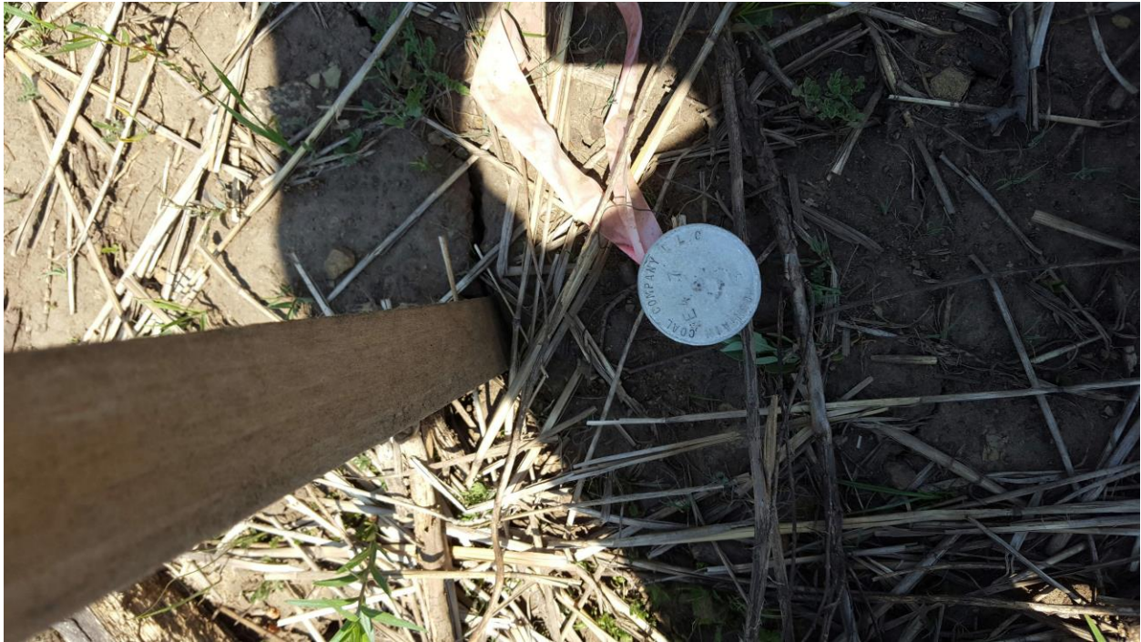
Figure 17: E4-07