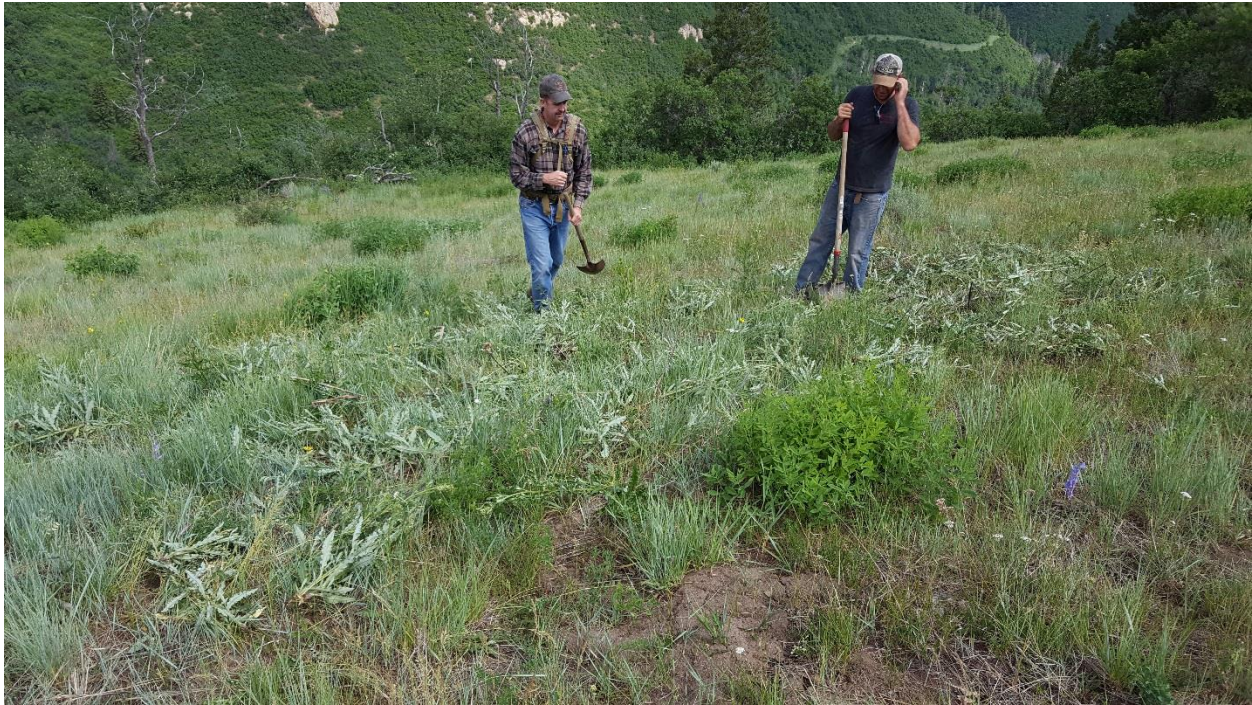
Figure 4: Thistles removed on 17-01a/b/c