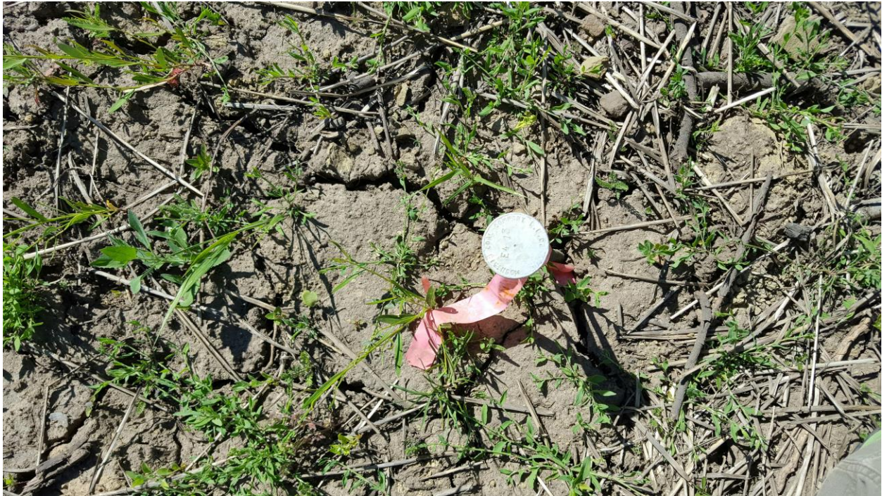
Figure 23: E4-13