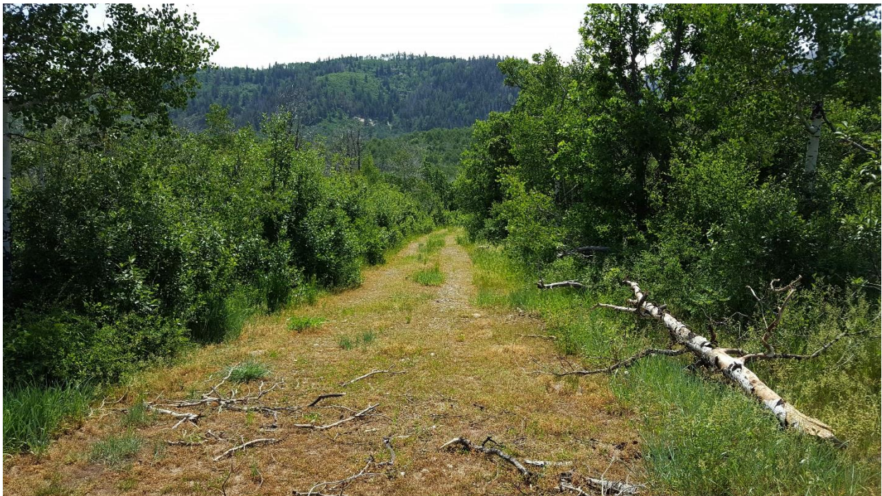
Figure 7: Deep Creek Road from 96-2-2, not yet reclaimed

Number of Partial Inspection this Fiscal Year: 8