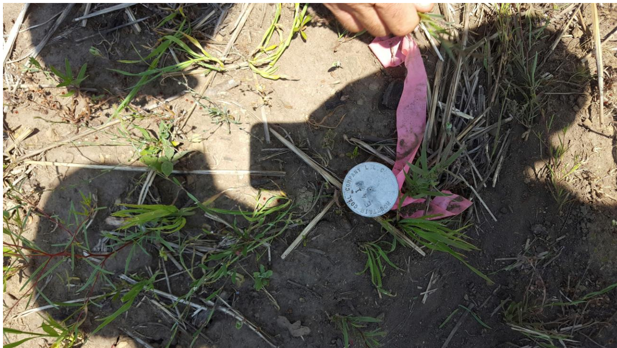
Figure 11: E4-01