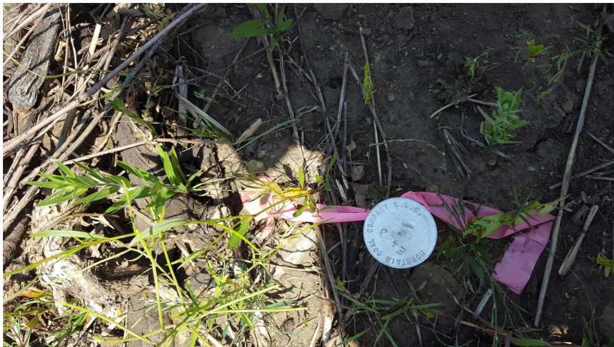
Figure 13: E4-03