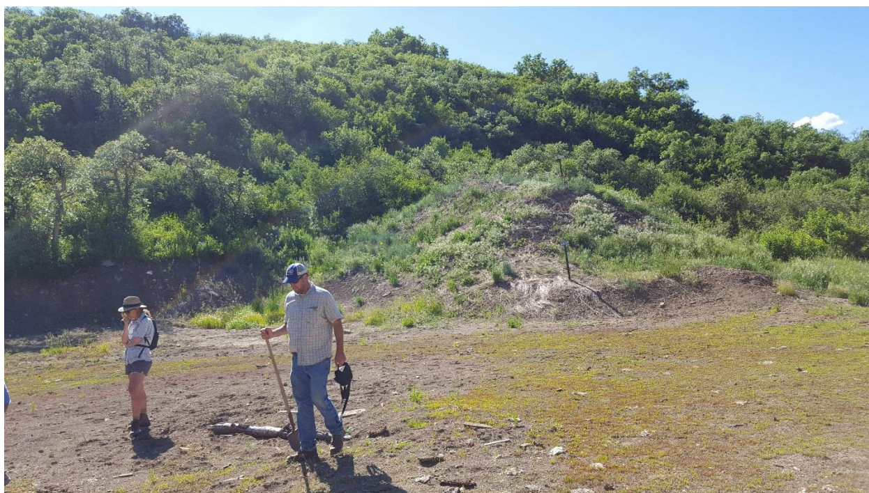
Figure 3: E3-29, not yet reclaimed

Number of Partial Inspection this Fiscal Year: 8