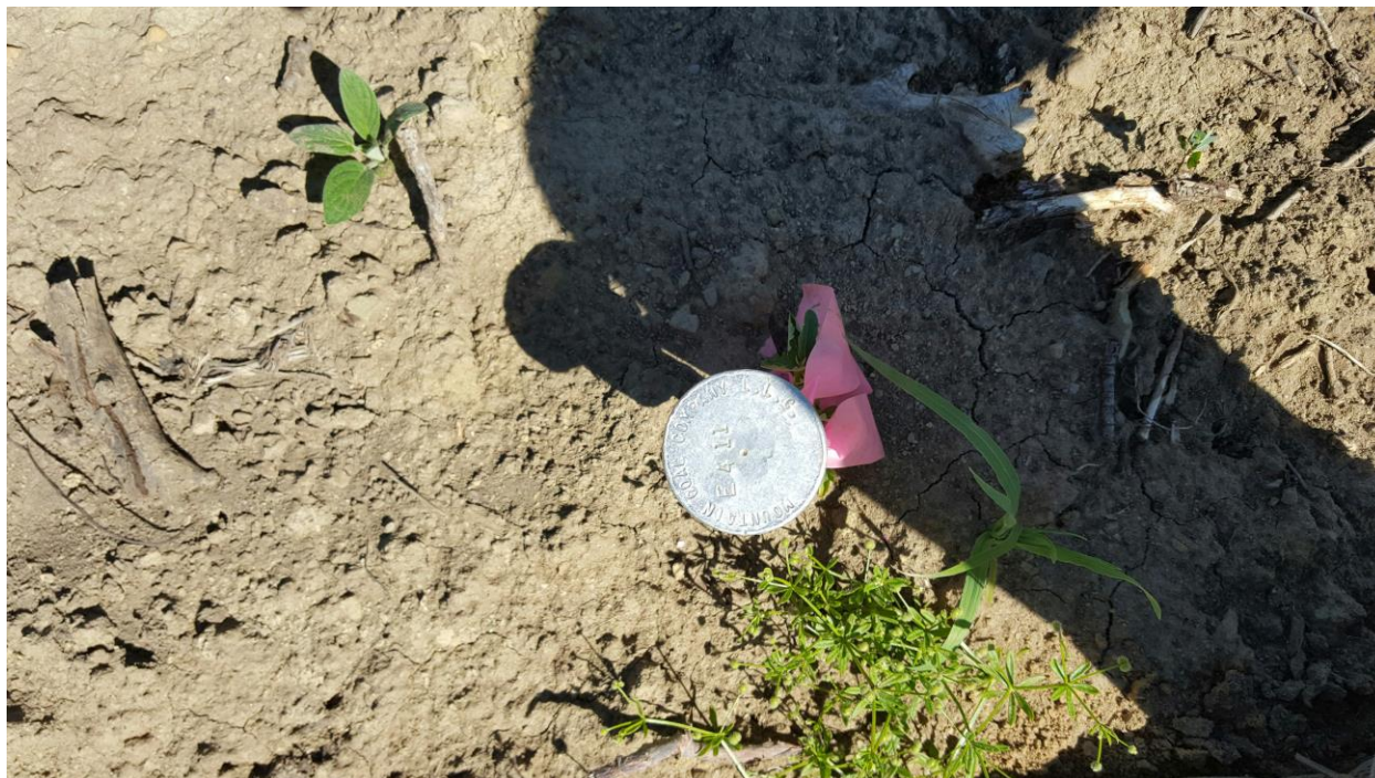
Figure 21: E4-11