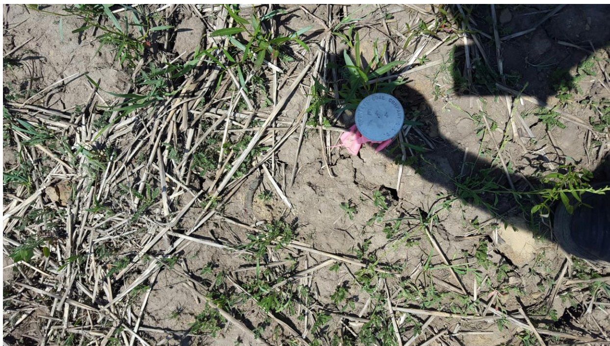
Figure 14: E4-04

Number of Partial Inspection this Fiscal Year: 8