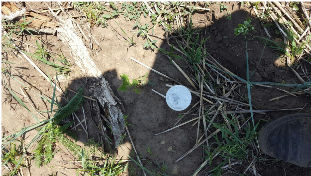
Figure 15: E4-05