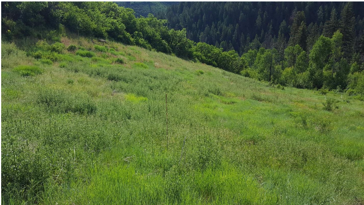
Figure 5: Dense thistle on 15-01/15-01a

Number of Partial Inspection this Fiscal Year: 8