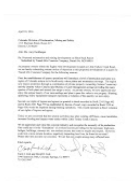
quarry protest.jpeg 1265K