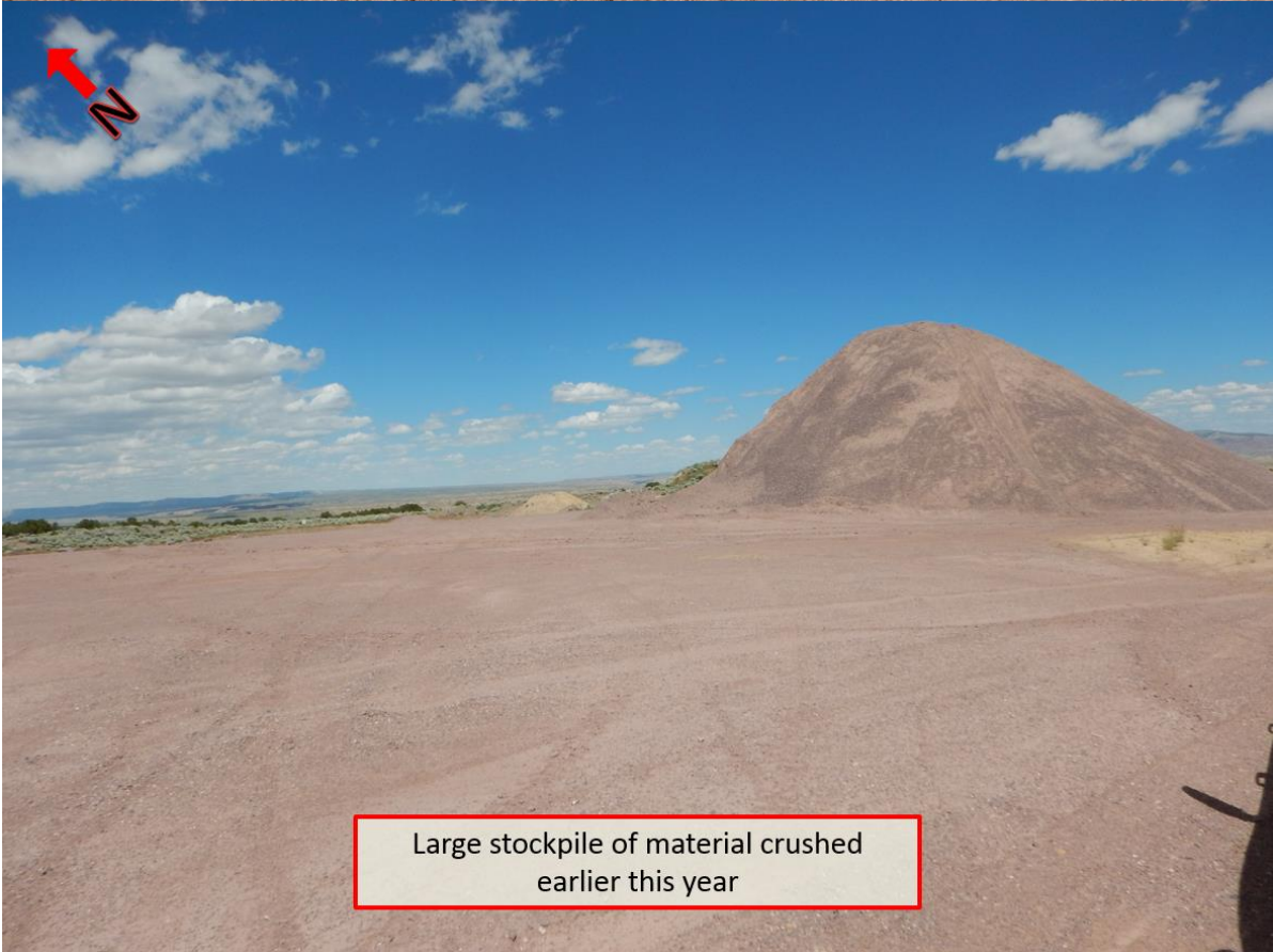
Large stockpile of material crushed earlier this year