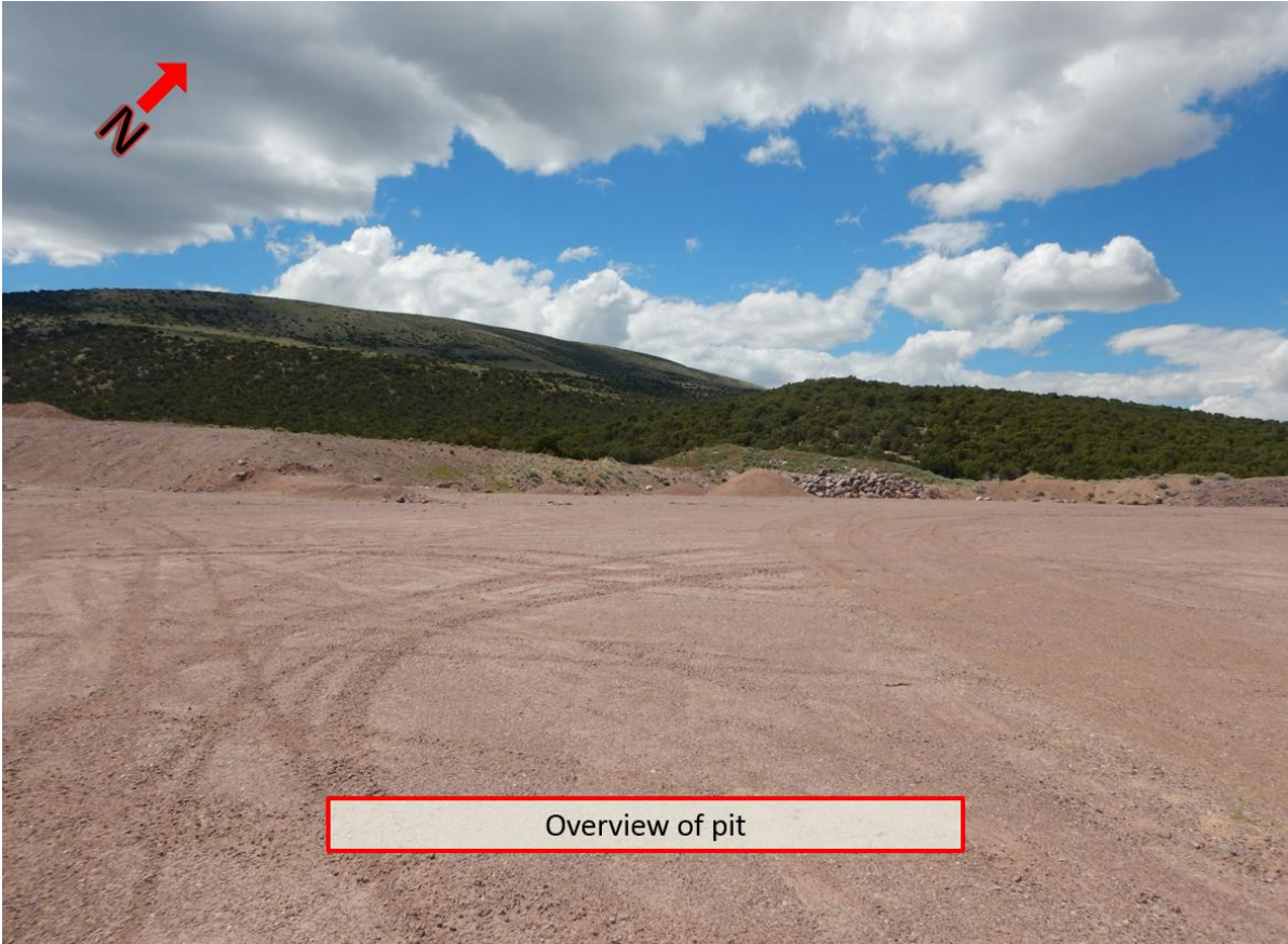
Overview of pit