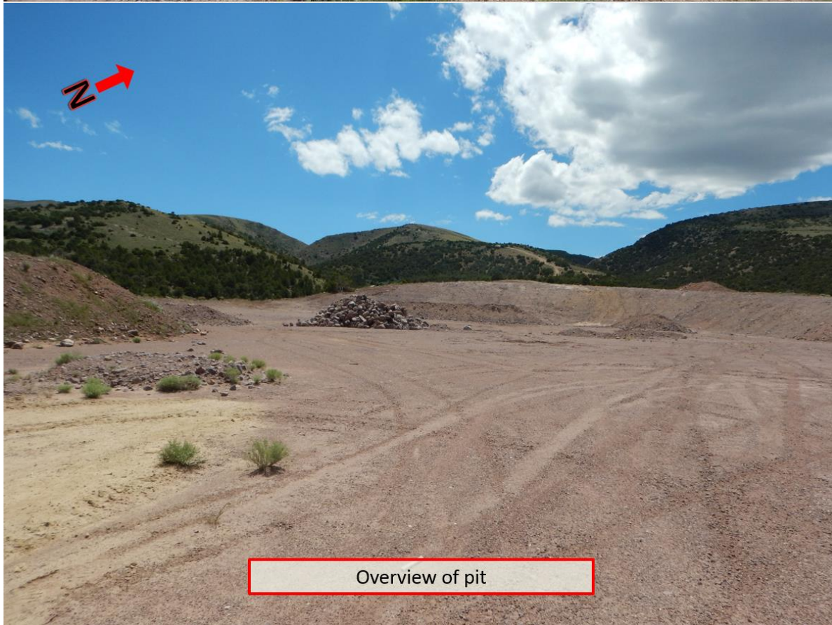
Overview of pit