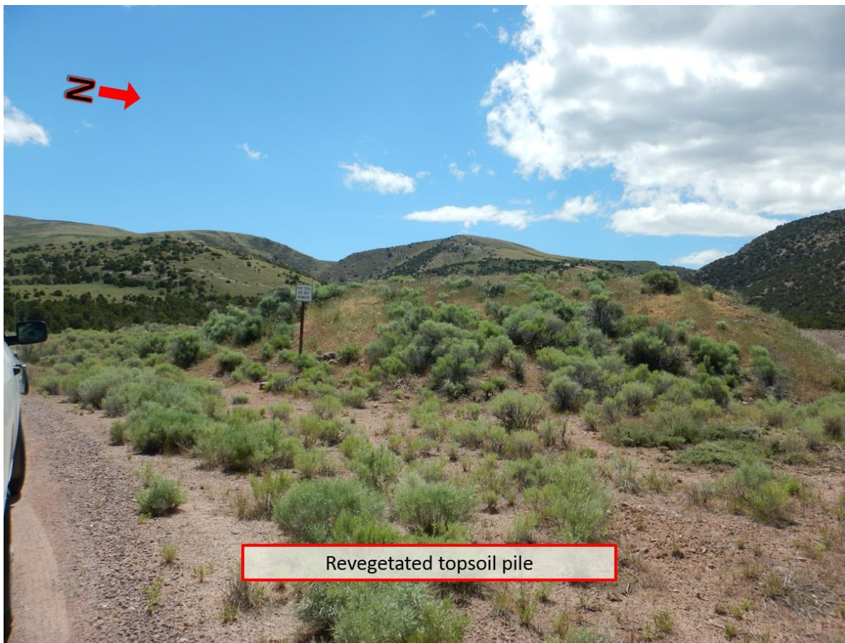
Revegetated topsoil pile