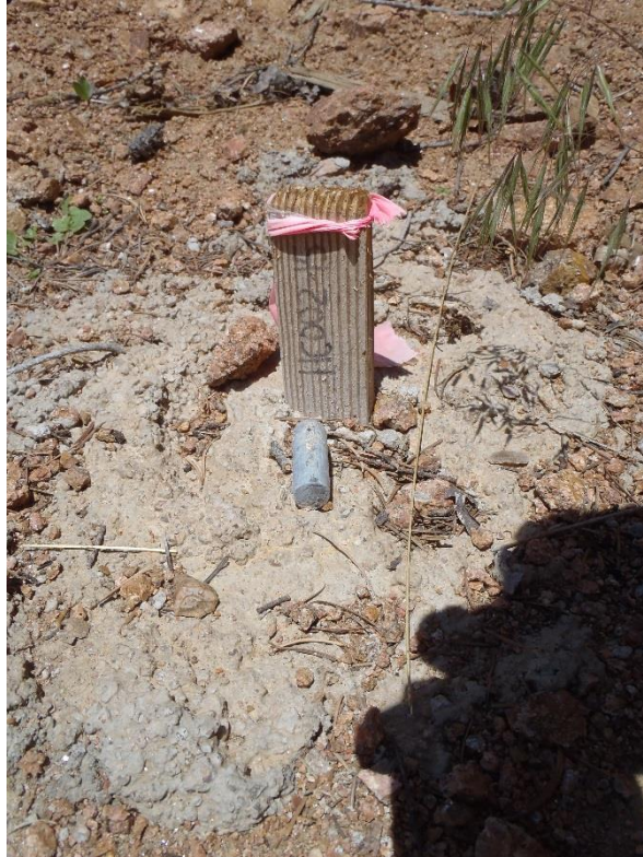
Photo 1. Borehole HC002-15 appeared to be sealed