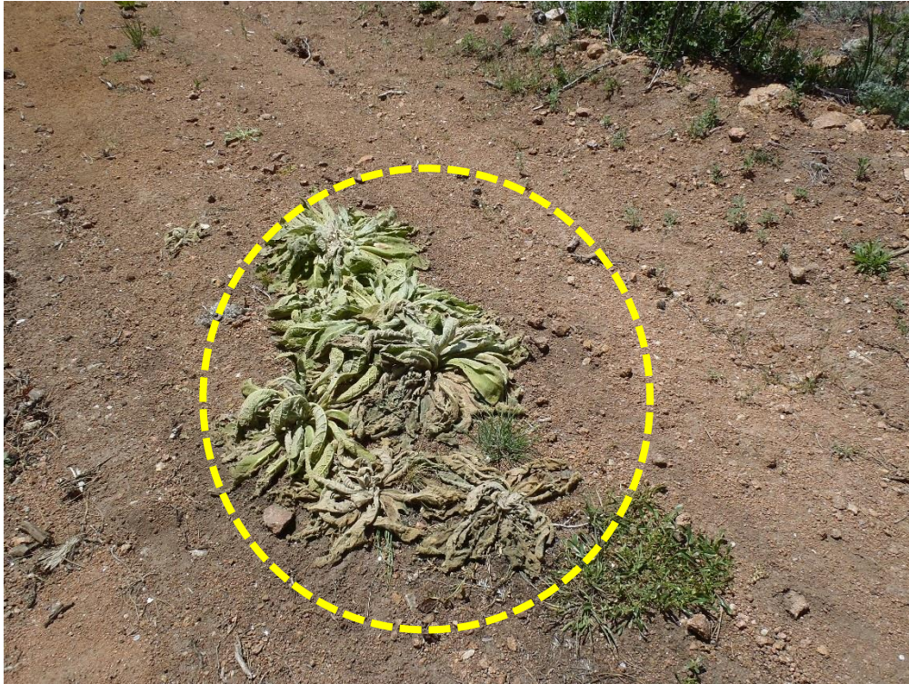
Photo 3. Treated Common Mullein on Drill Road between Boreholes B-2 and B-3.

Jerry Schnabel Transit Mix Concrete Co. 444 East Costilla Colorado Springs, CO 80903