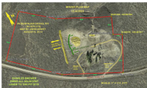
PICKENPAUGH MINING (NEW).jpg 990K