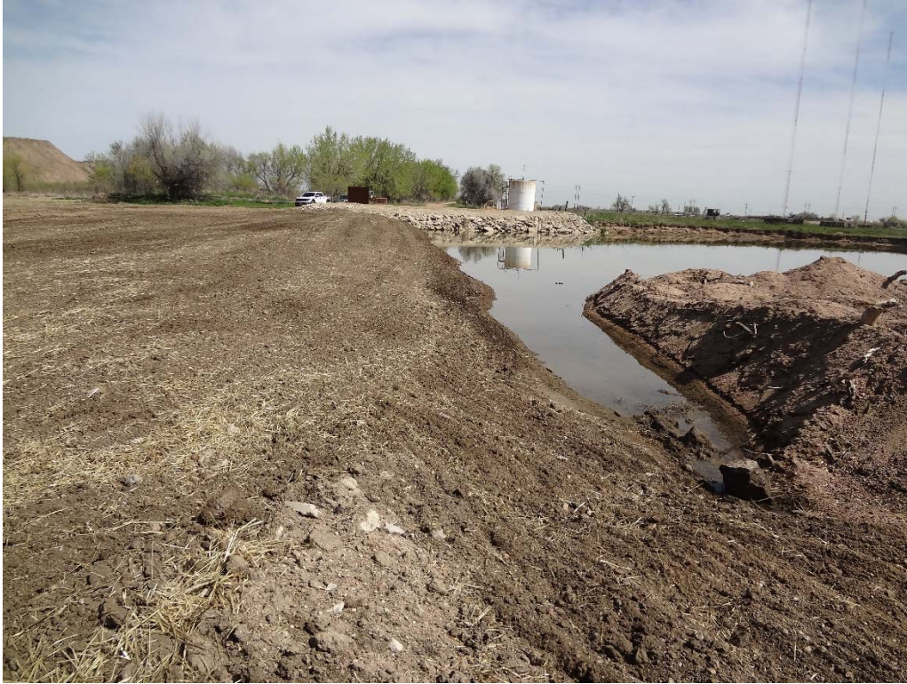
Looking north from the south end of breach repair