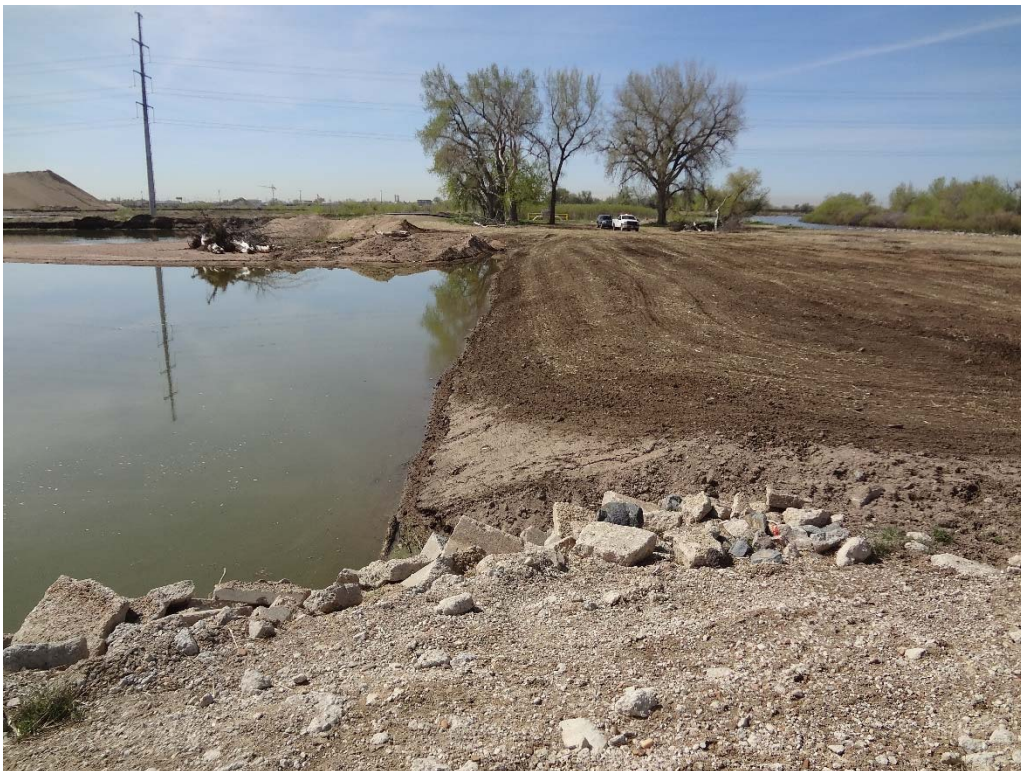
Looking south from NW AI property corner