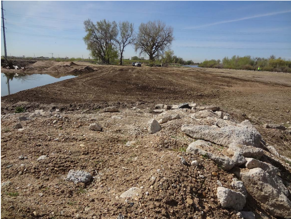
Looking south from NW AI property corner