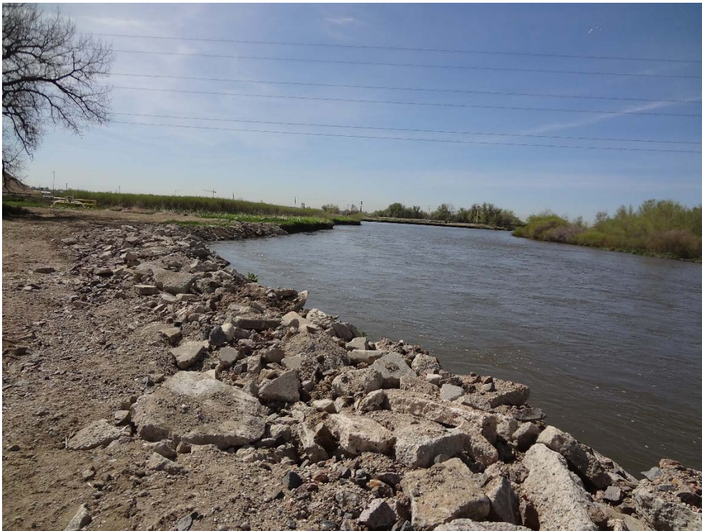
Looking south at Platte River