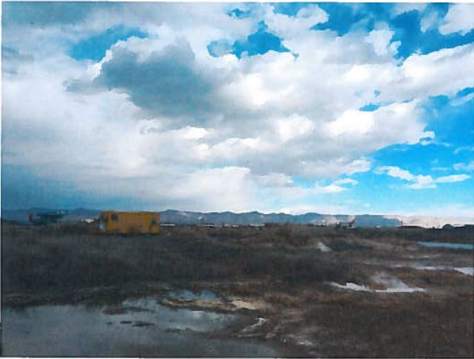
Some standing water- less than 72 hour retention