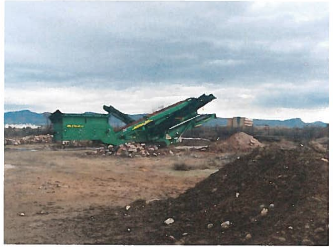
Crusher on site