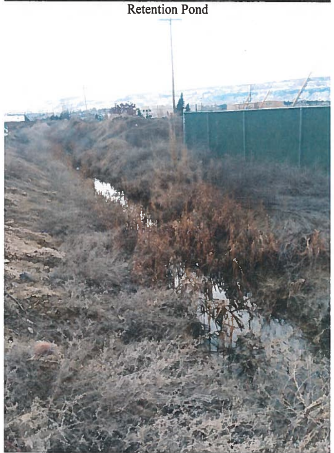
Ditch along west boundary