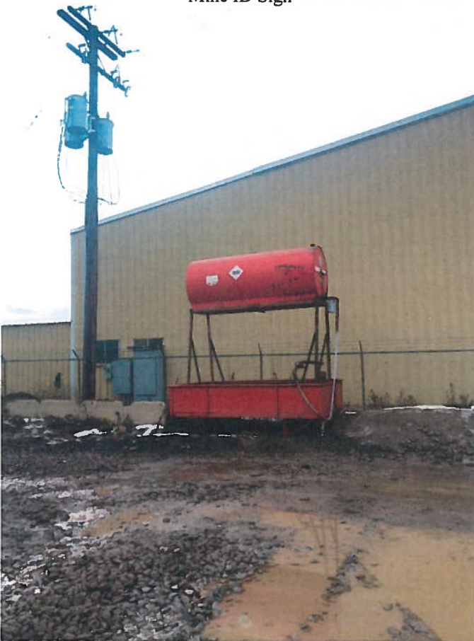
Fuel Tank with Secondary containment