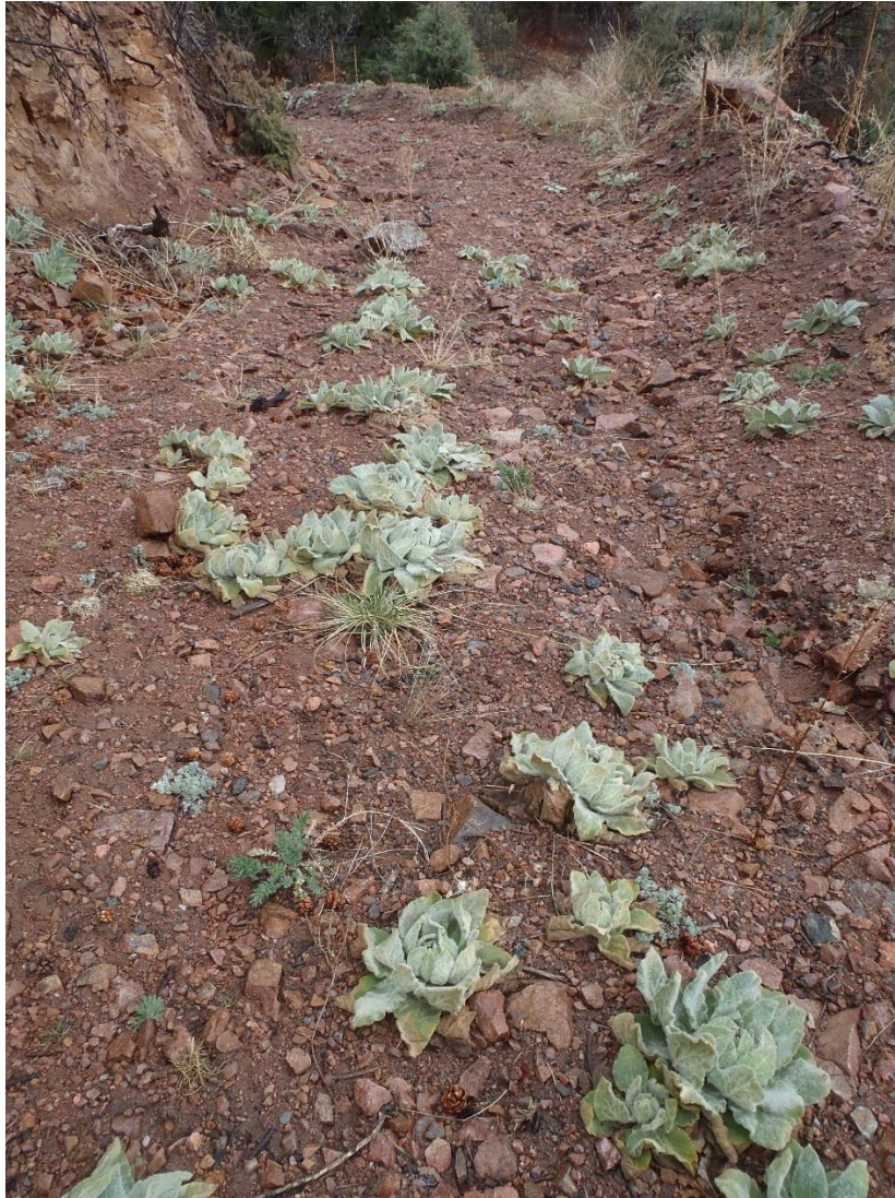
Photo 3. Common Mullein on B-1 Drill Road.