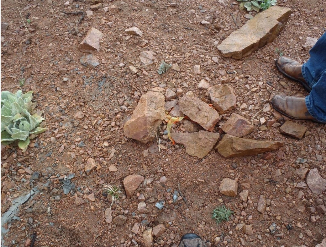
Photo 1. Borehole B-1 appeared to be sealed