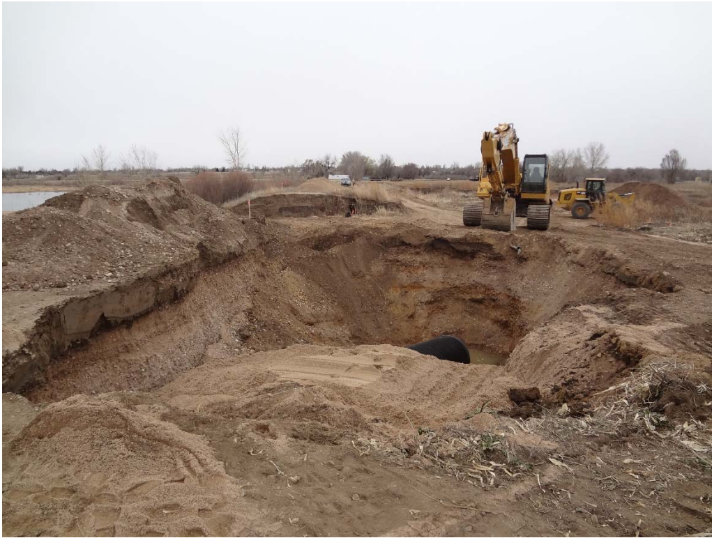
Looking south at Boyd-Freeman ditch repair