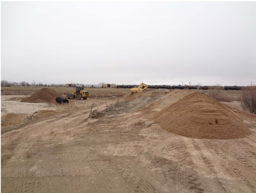
Looking north at Boyd-Freeman ditch repair