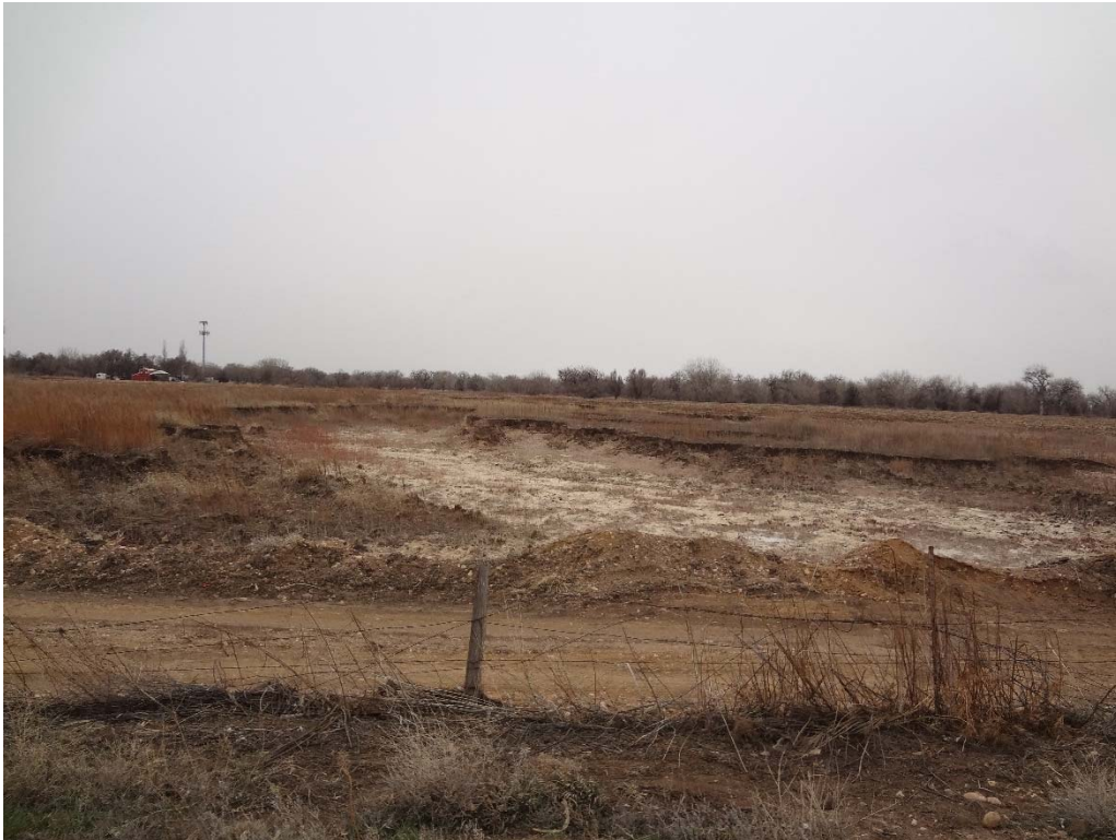
Looking west at flood damage west of mine site