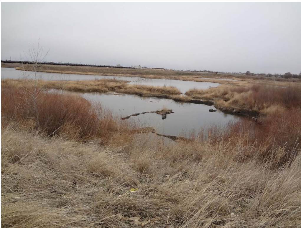
Looking east from southwest corner of site