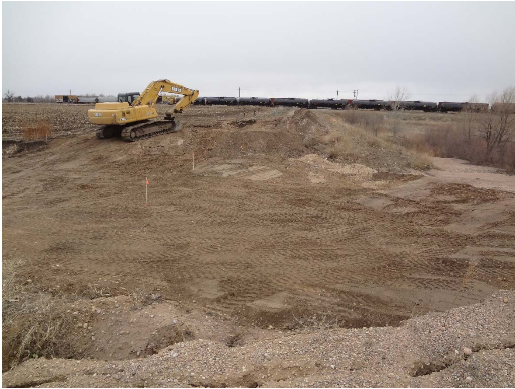
Looking north at Boyd-Freeman ditch repair