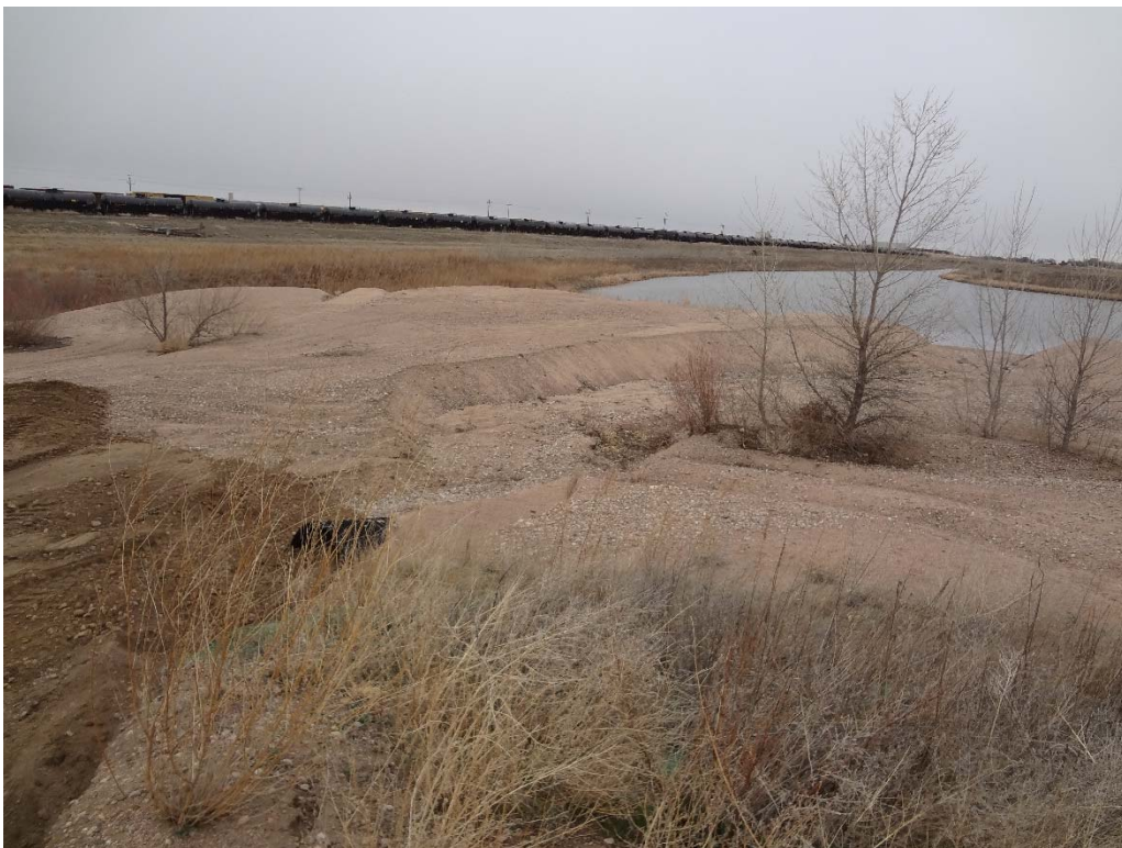
Looking northeast at fan created by 2014 flood event