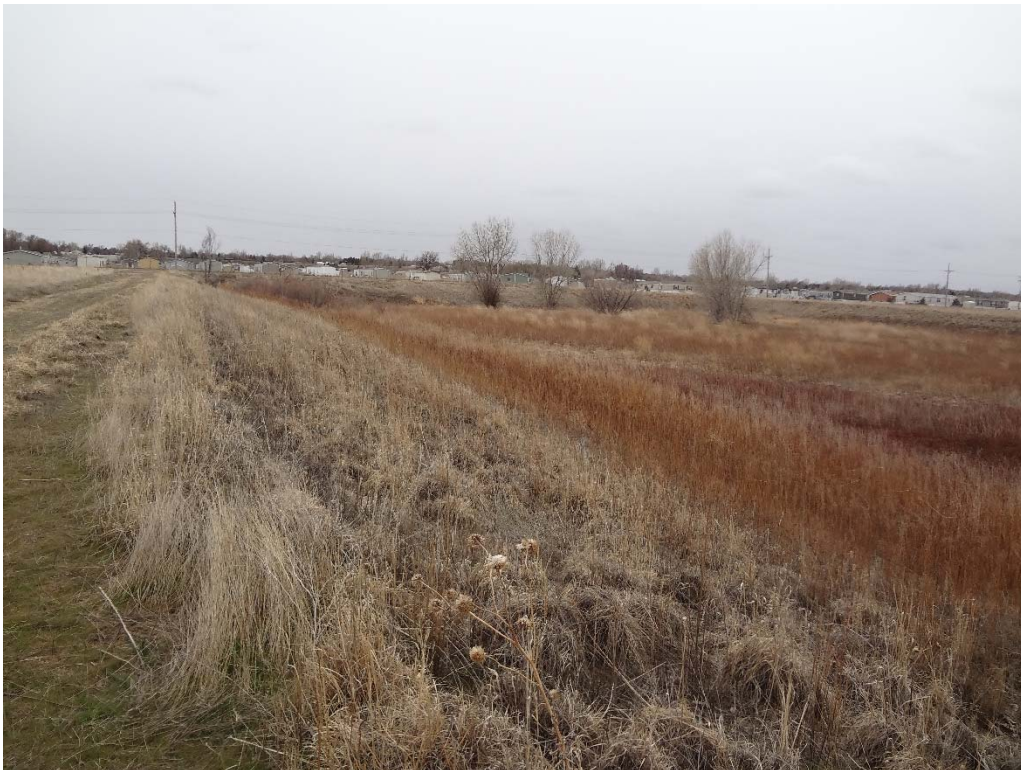
Looking south from northeast corner of site