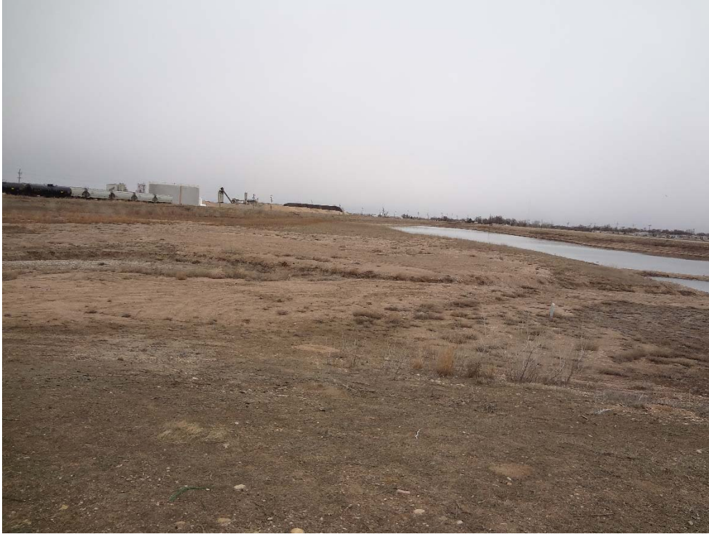
Looking east from middle of the site between the 2 lakes