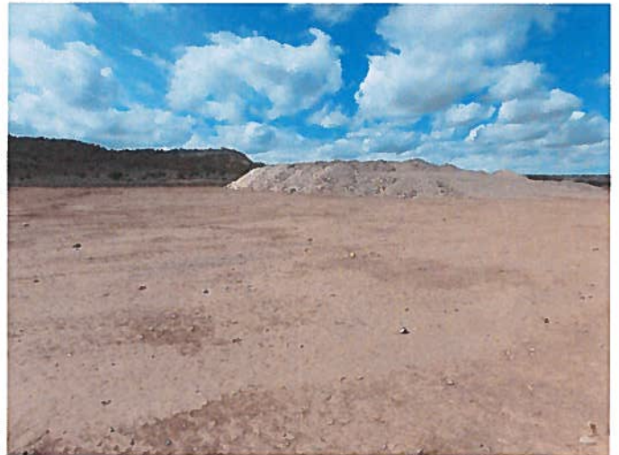
Figure 8: Plant area