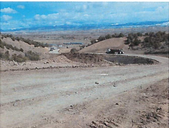
Figure 5: Looking down the access road