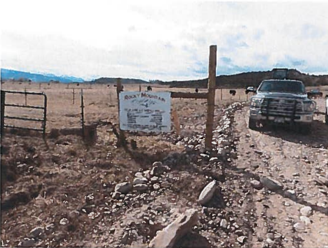
Figure 1: Site entrance