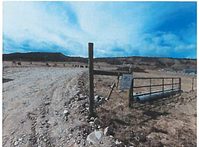
Figure 2: Site entrance