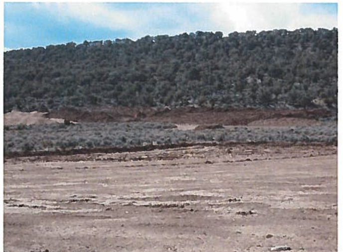
Figure 10: Topsoil stockpiled on west side of Phase 1 area