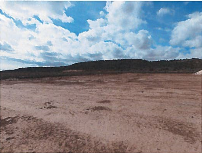
Figure 9: Plant area