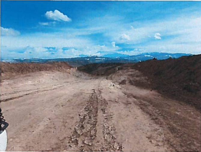
Figure 7: Upper end of the access road where it enters the Phase 3 area