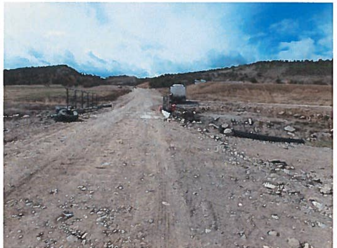
Figure 4: Access road canal crossing