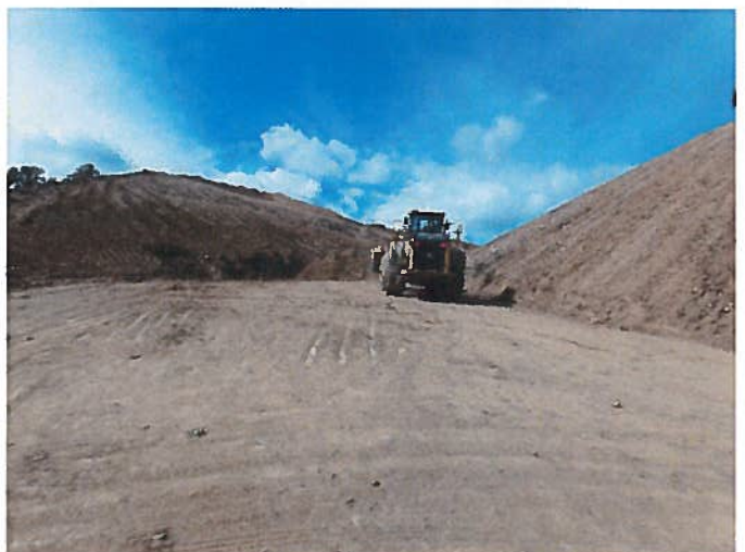
Figure 6: Upper extent of the access road construction