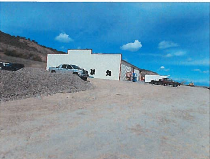
Figure 11: Shop/office area