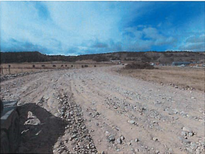
Figure 3: Access road