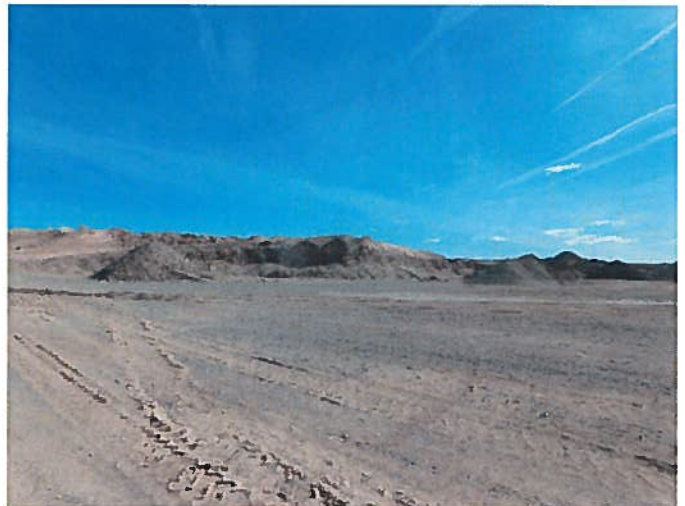
Figure 2: Stockpile area