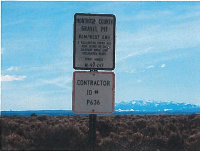
Figure 1: Sign at entrance.