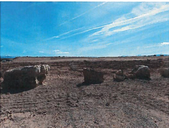
Figure 5: Looking east at the Phase 1a reclamation area