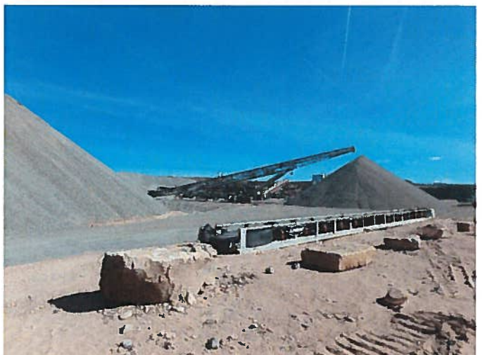
Figure 6: Process area