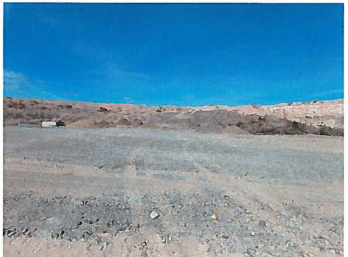
Figure 4: Woody debris and mulch stored on west side of stockpile area