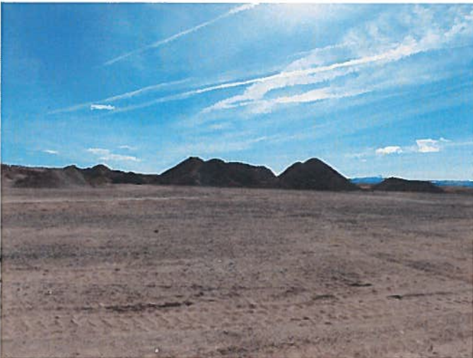
Figure 3: Stockpile area