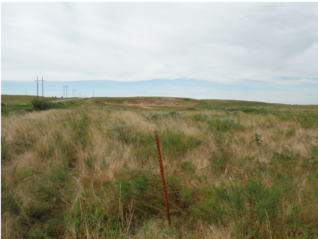
Northern boundary corner; looking south.