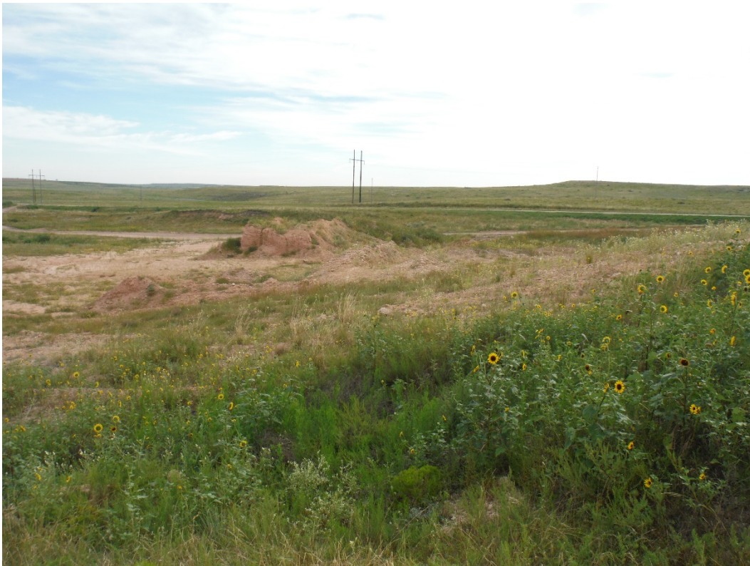
Southern mine face and stockpile material; looking northeast.