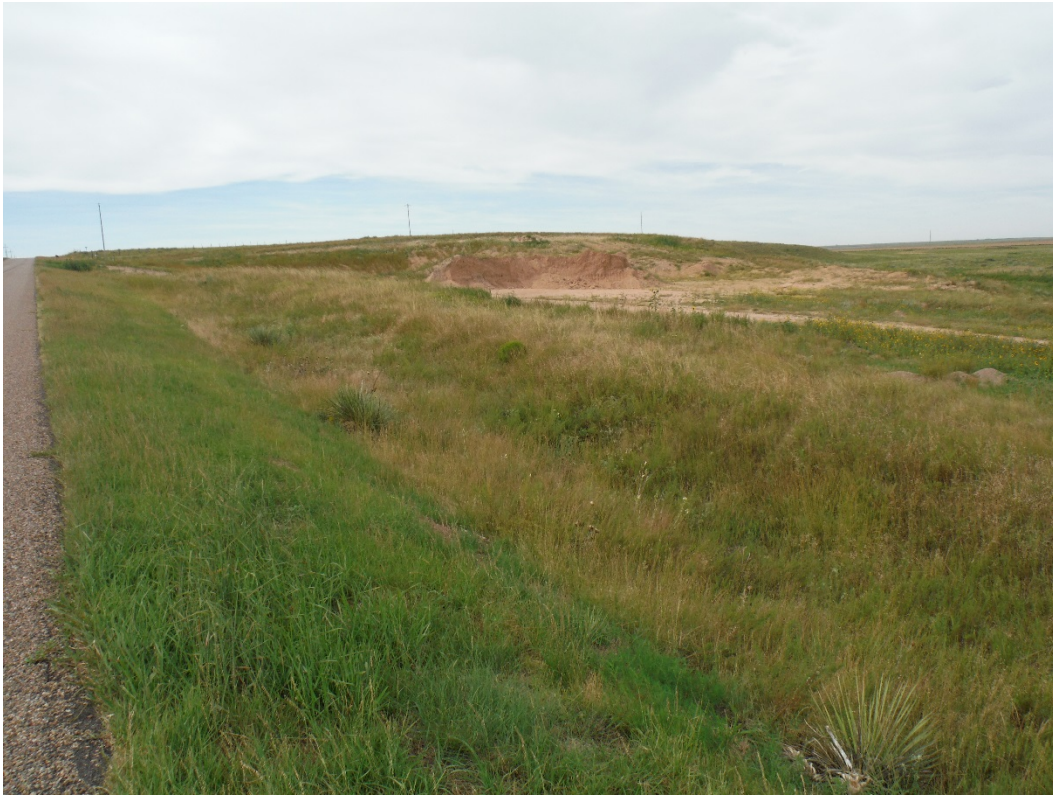
Site overview; looking southwest.