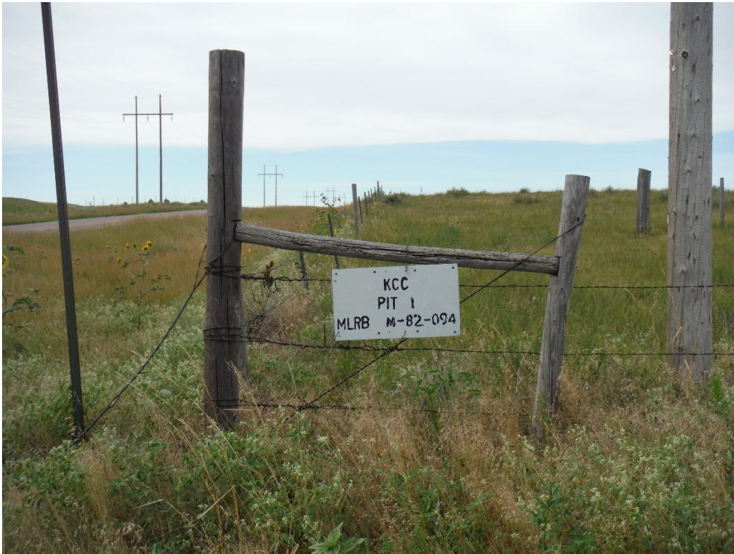
Mine identification sign posted at the site entrance; looking south.