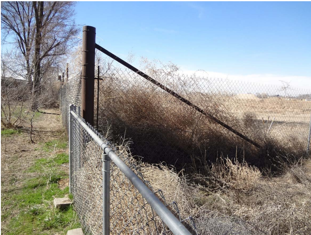
Looking west at fence between Taylor property and Loloff Mine