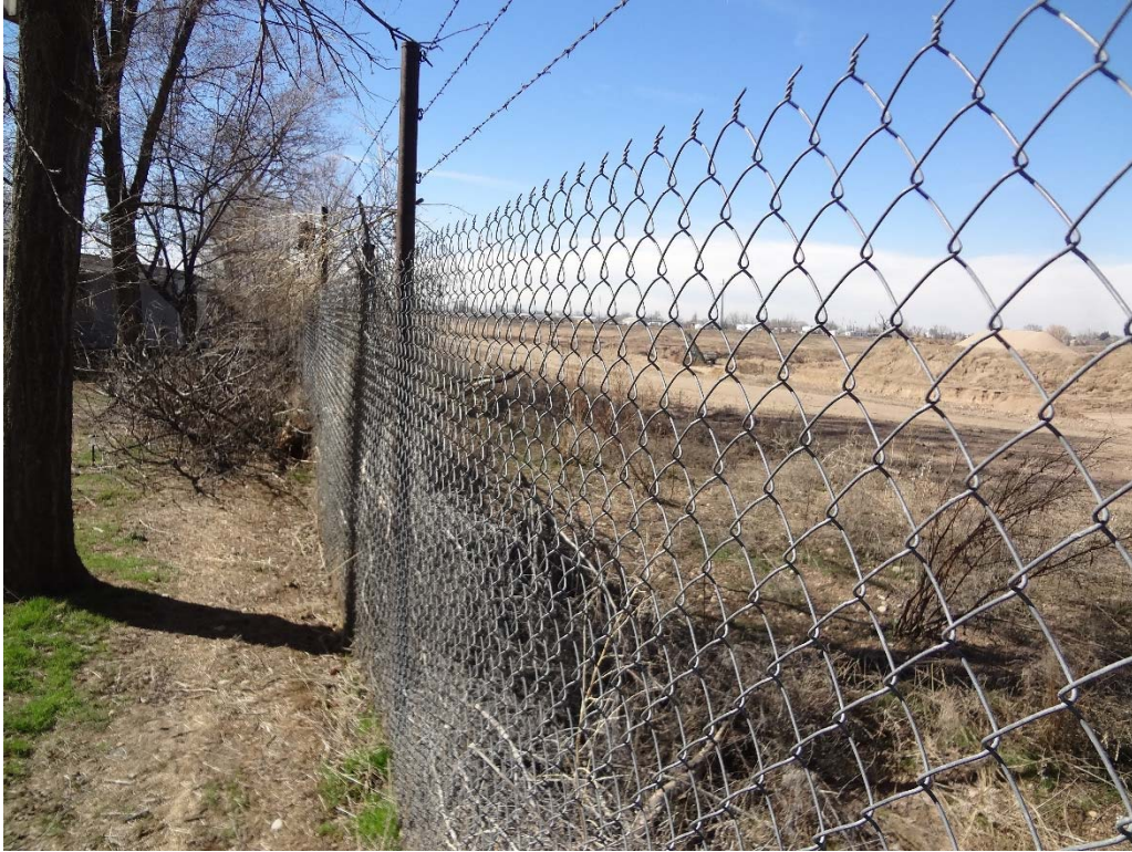
Looking NW from Taylor yard at Loloff Mine