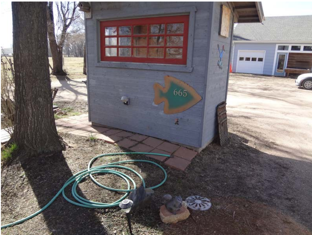
Taylor well pump house