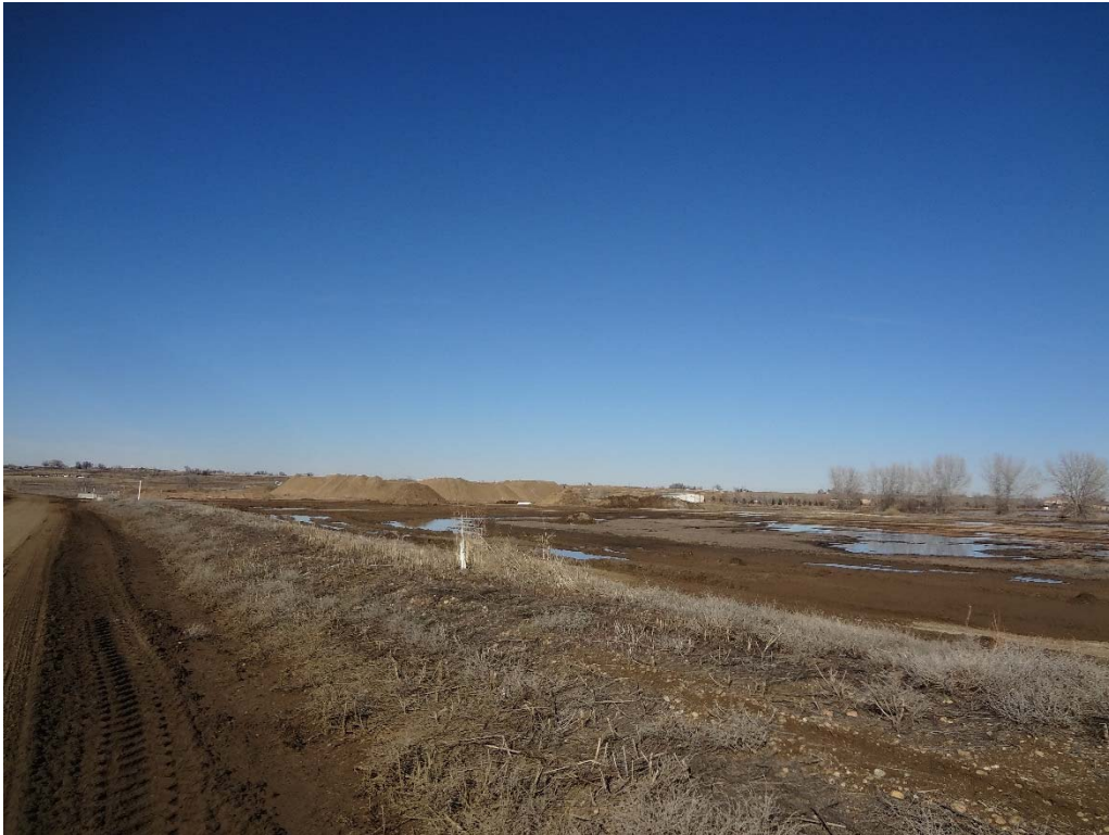
Looking NE from the SW corner of Phase 3