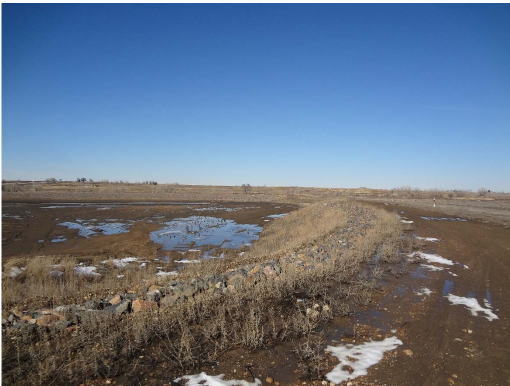
Looking north from the SE corner of Phase 2