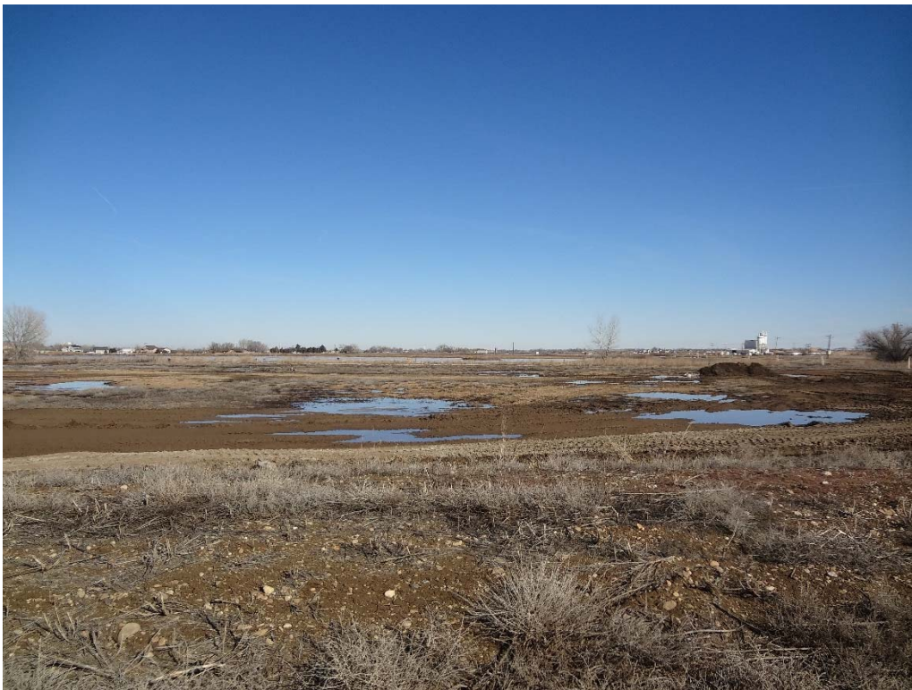
Looking east from the SW corner of Phase 3