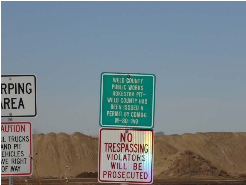
Hokestra Pit Mine Sign