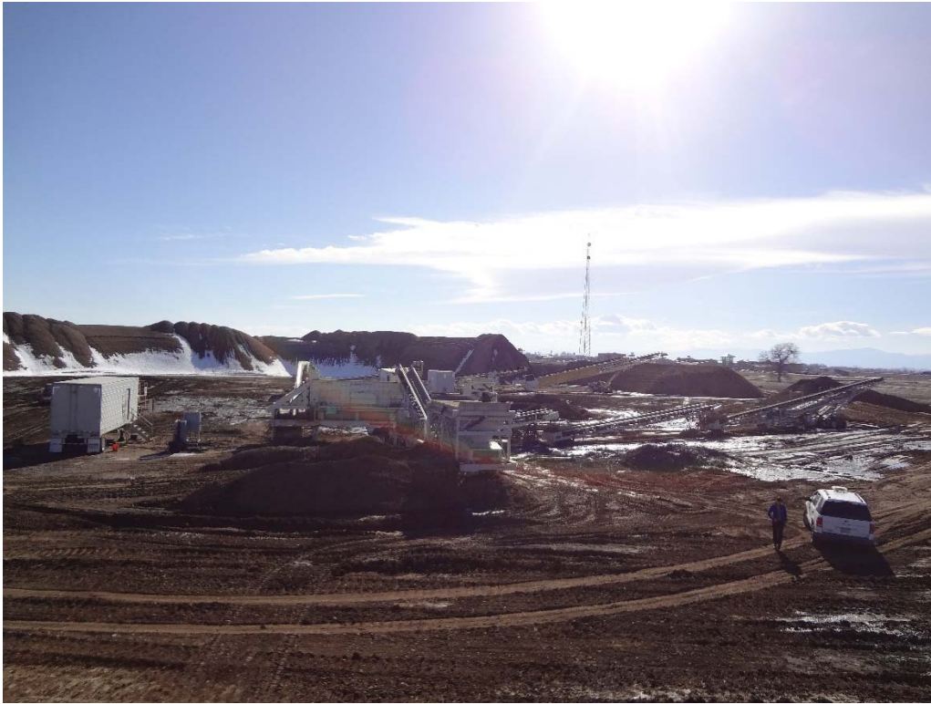
Looking south from middle of Phase 4