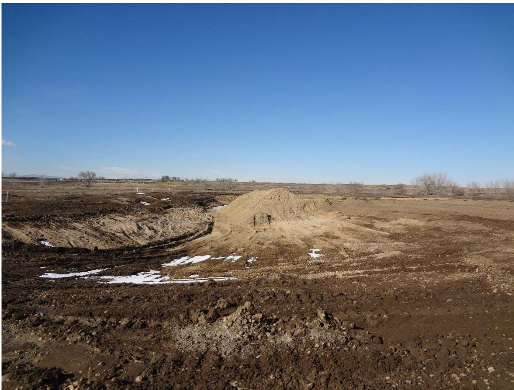
Looking north from middle of Phase 4