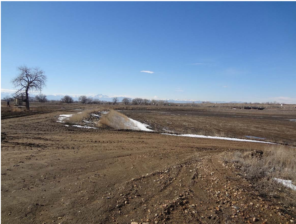
Looking west from the SE corner of Phase 2