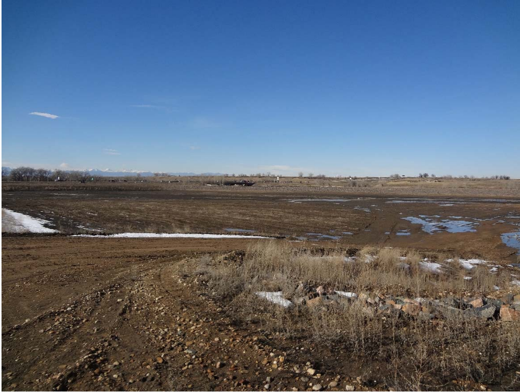
Looking NW from the SE corner of Phase 2