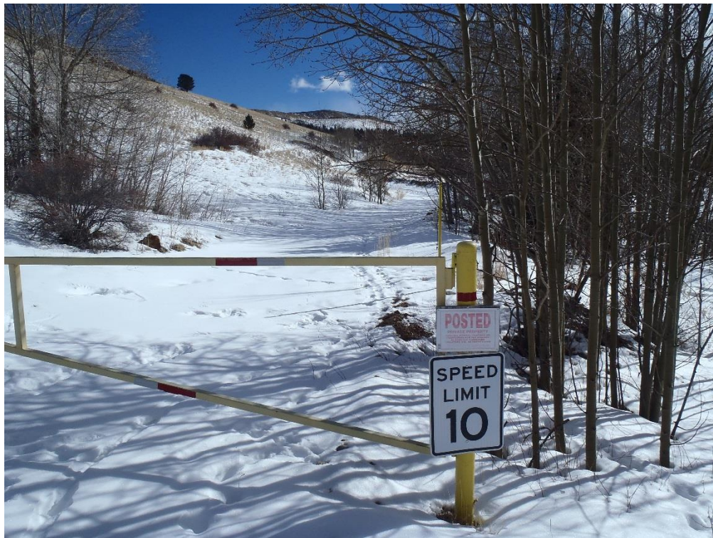
Photo 1. Missing permit sign at entrance gate.