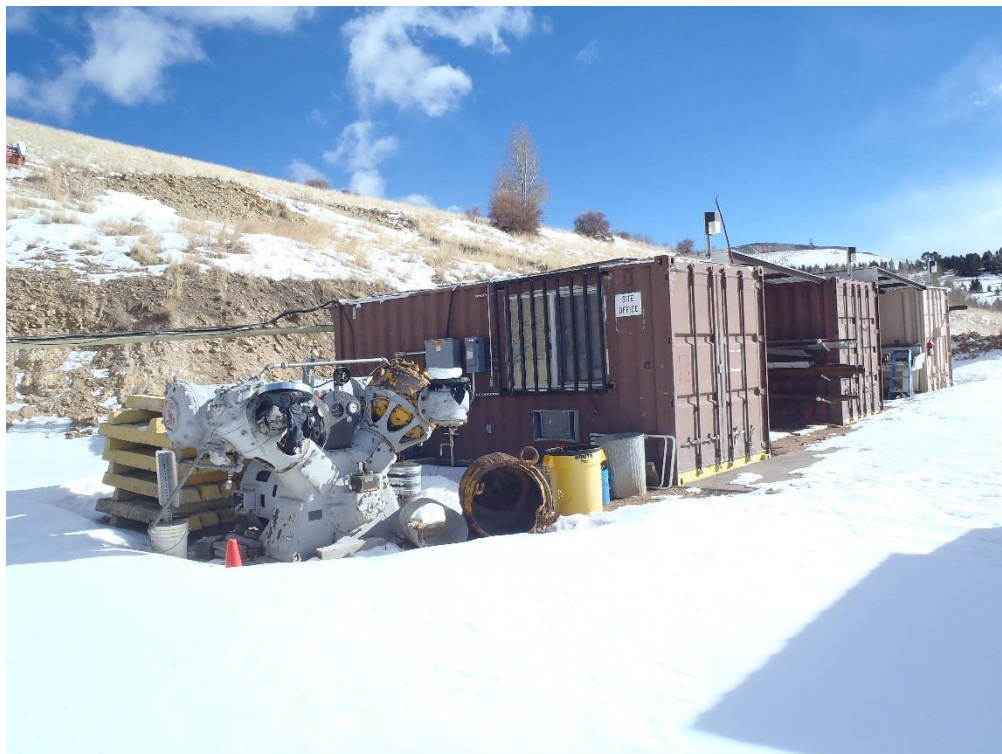
Photo 3. Small temporary buildings and equipment near adit (looking south).