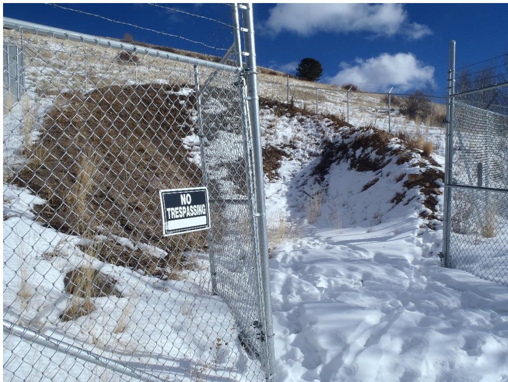
Photo 5. Explosives magazine (2 of 2) removed – previously inside fenced area.