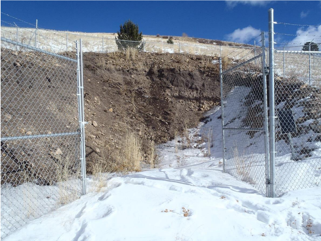
Photo 4. Explosives magazine (1 of 2) removed – previously inside fenced area.