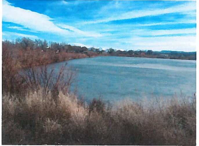
Lake Loughrey- Looking East