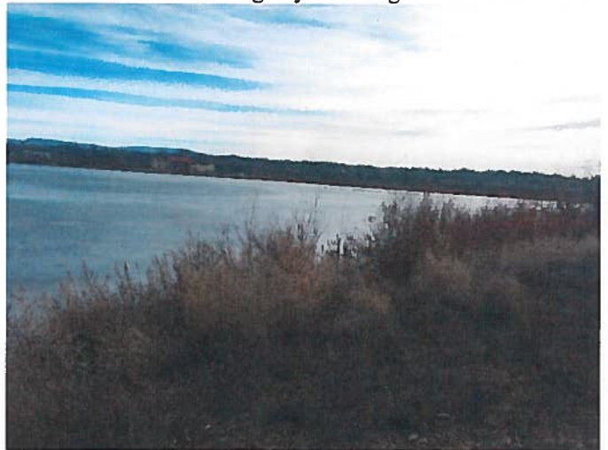
Black Lake- Looking SE