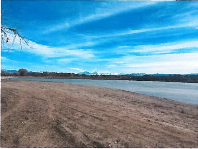
Pit No. 1 pond- Looking East