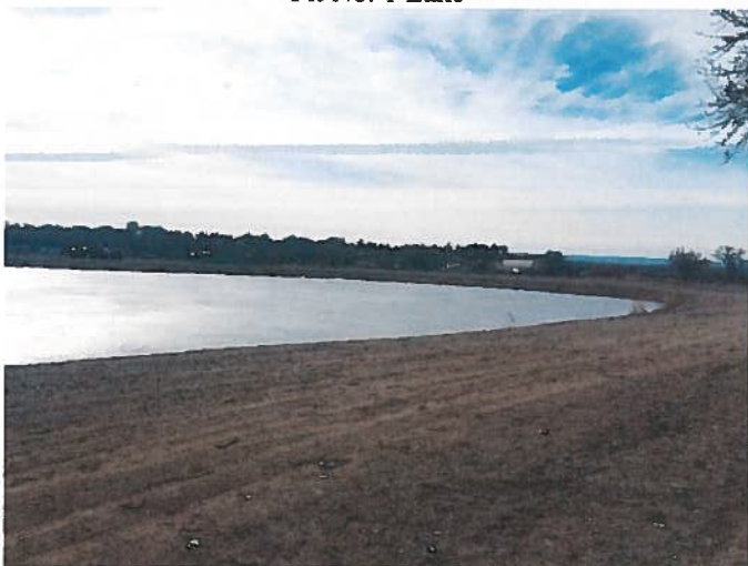
Pit No. 1