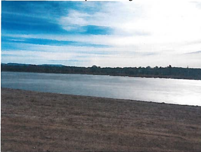
Pit No. 1 Lake