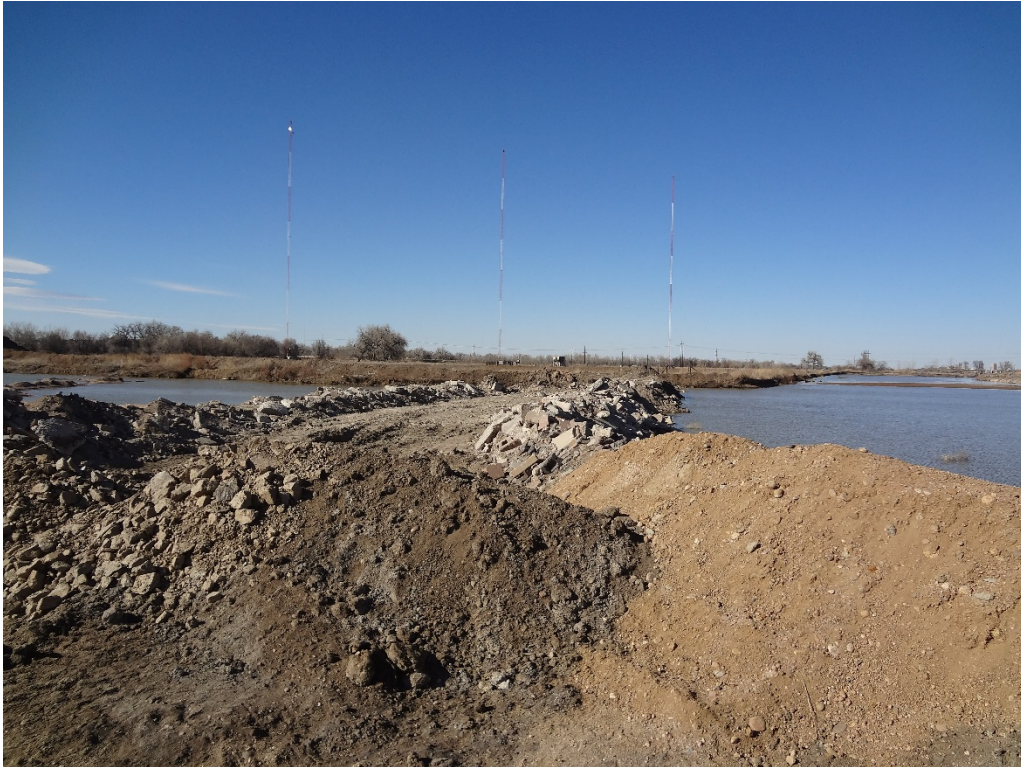
Looking NW at haul road through the Phase 3 pond