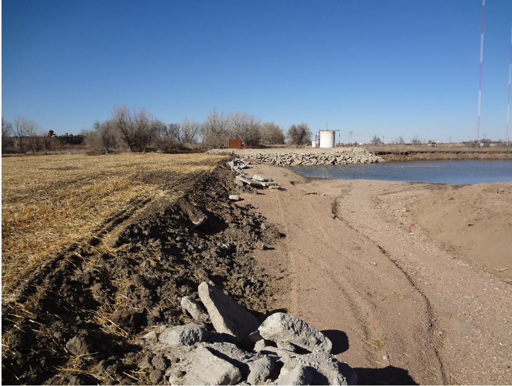
Looking at the toe of slope along the western shoreline of Phase 3