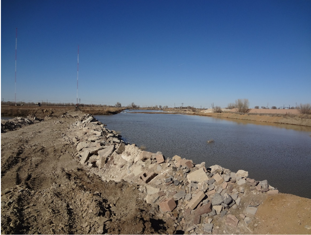
Looking north at the eastern portion of the Phase 3 pond