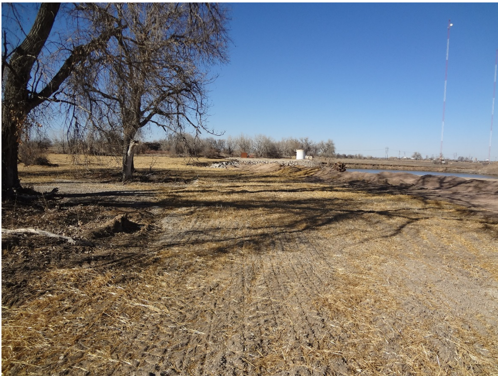
Looking north at breach repair from SW corner of Phase 3