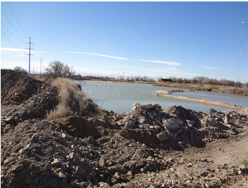
Looking west at the western portion of the Phase 3 pond