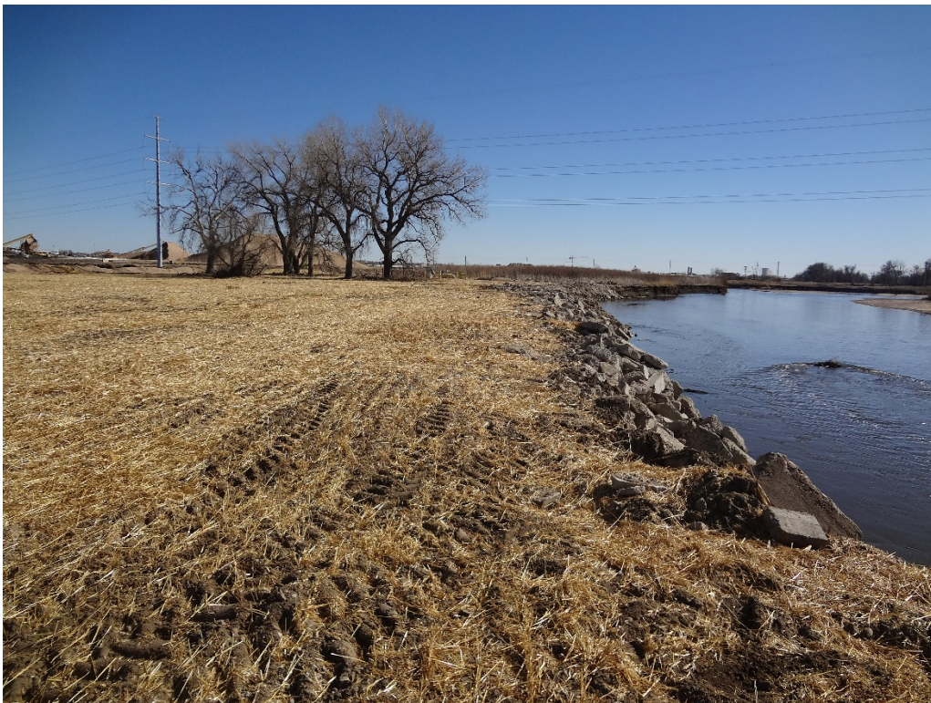
Looking SE from NW corner of breach repair