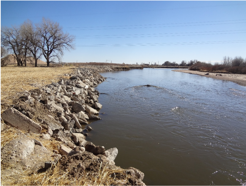
Looking south along bank of Platte River