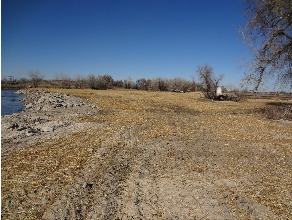
Looking north from SE corner of breach repair