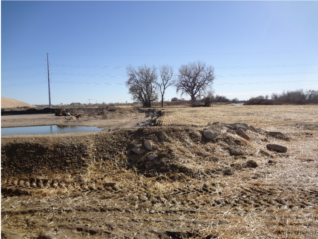
Looking south from NE corner of breach repair