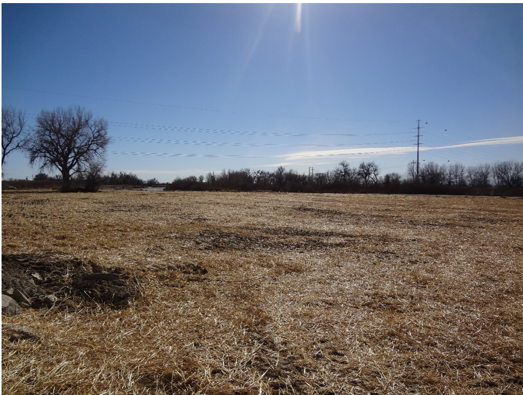
Looking SW from NE corner of breach repair