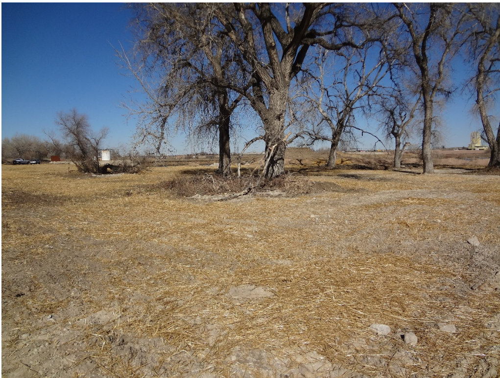
Looking NE from SE corner of breach repair