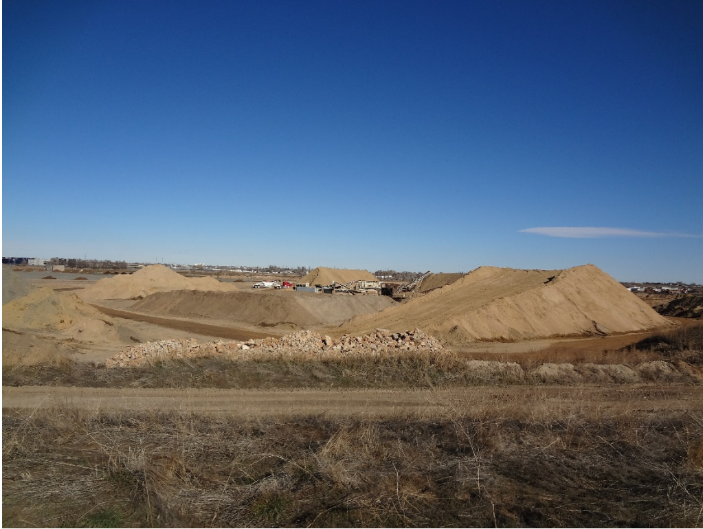
Looking north from south side of Tract A