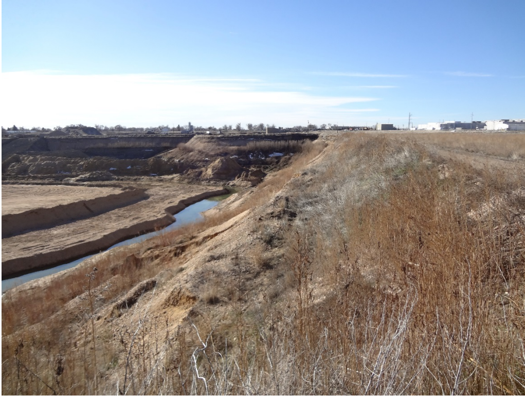
Looking south from NW corner of Tract C