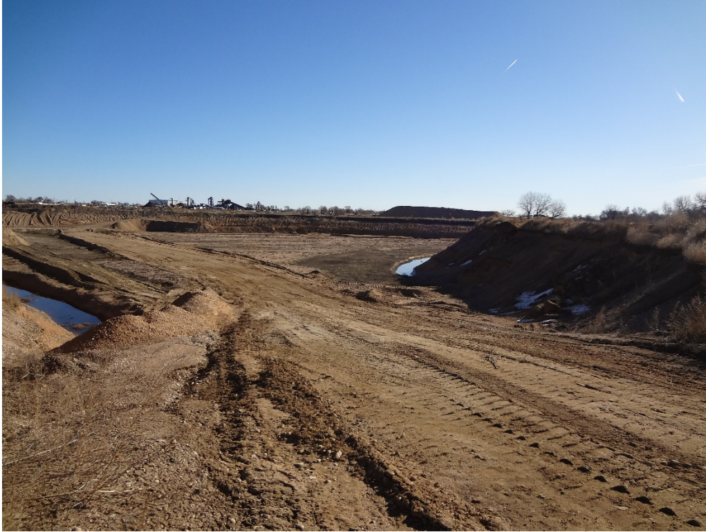
Looking east from SW corner of Tract D