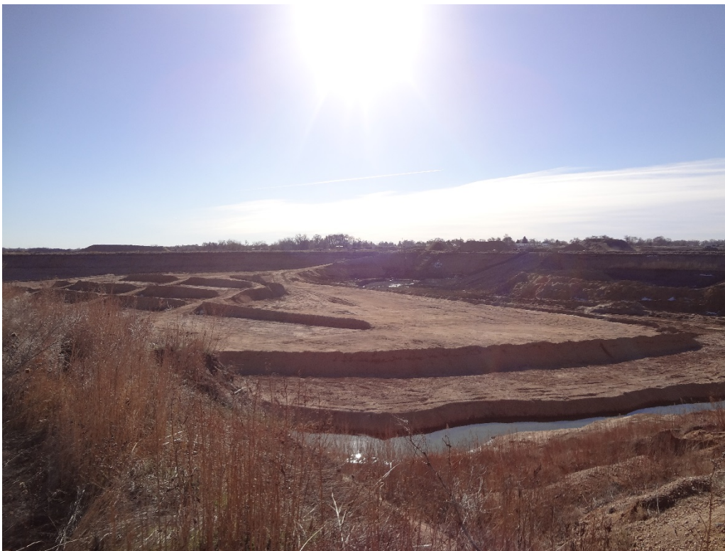
Looking SE from NW corner of Tract C