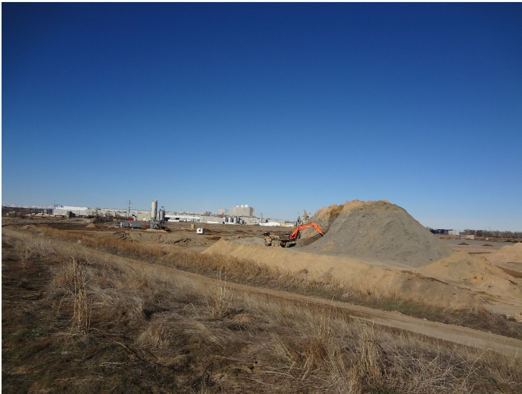
Looking NW from south side of Tract A