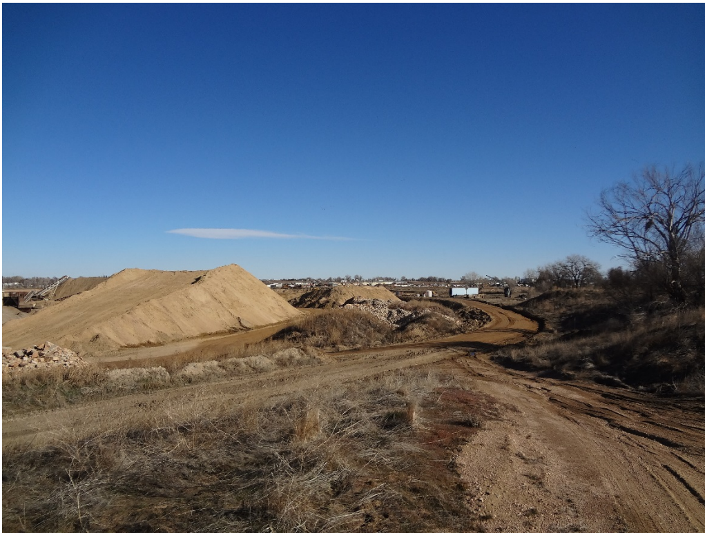
Looking NE from south side of Tract A