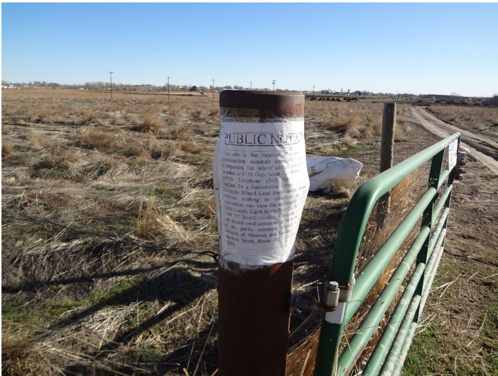
Western Sugar AM-01 Notice sign at Ash St. entrance