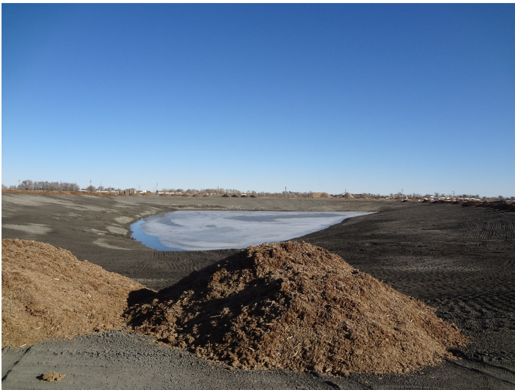
Looking north from SW corner of Tract B