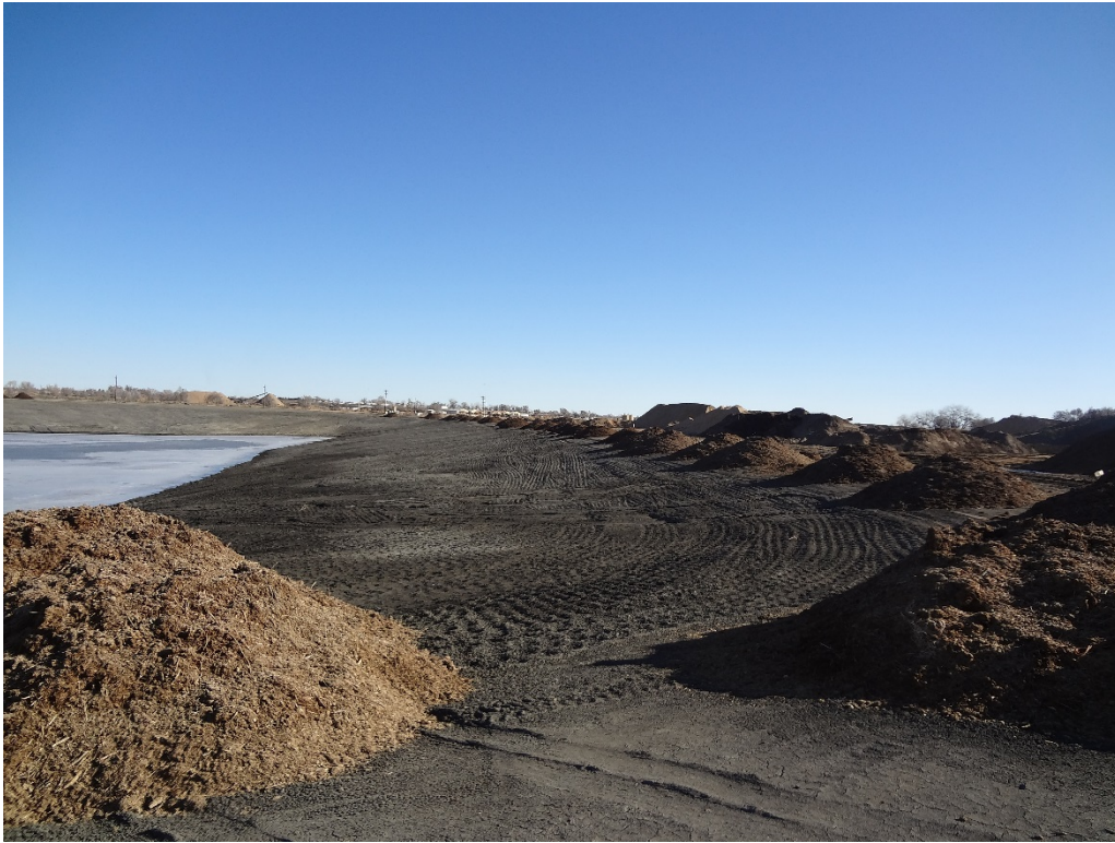
Looking NE from SW corner of Tract B