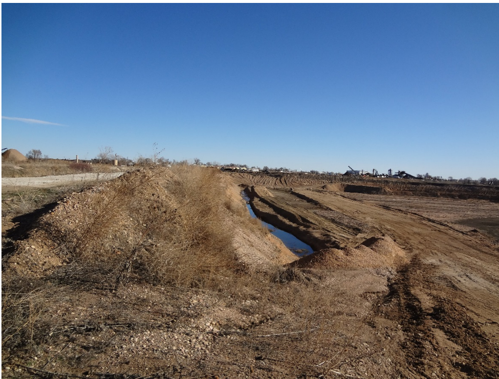
Looking NE from SW corner of Tract D