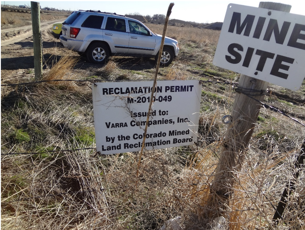
Western Sugar mine sign at Ash St. entrance