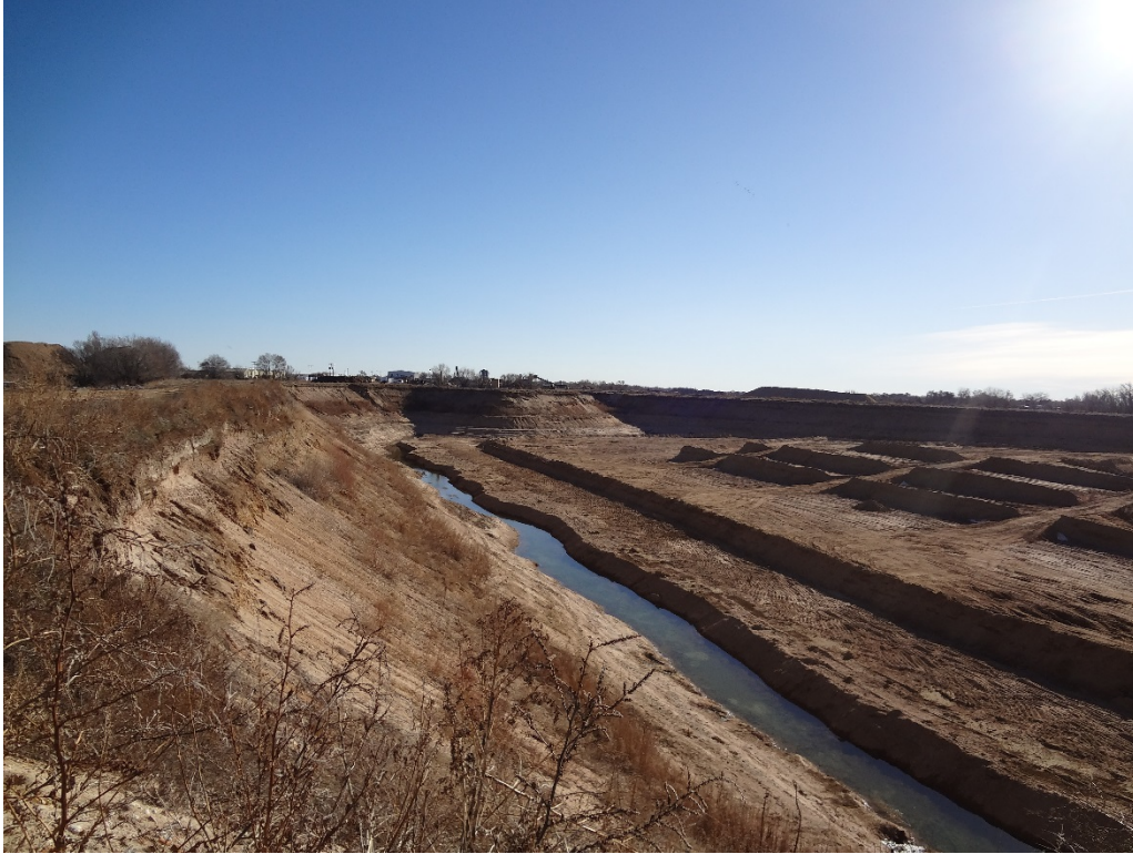
Looking east from NW corner of Tract C