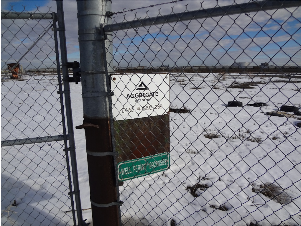
83 rd Joint Venture mine sign