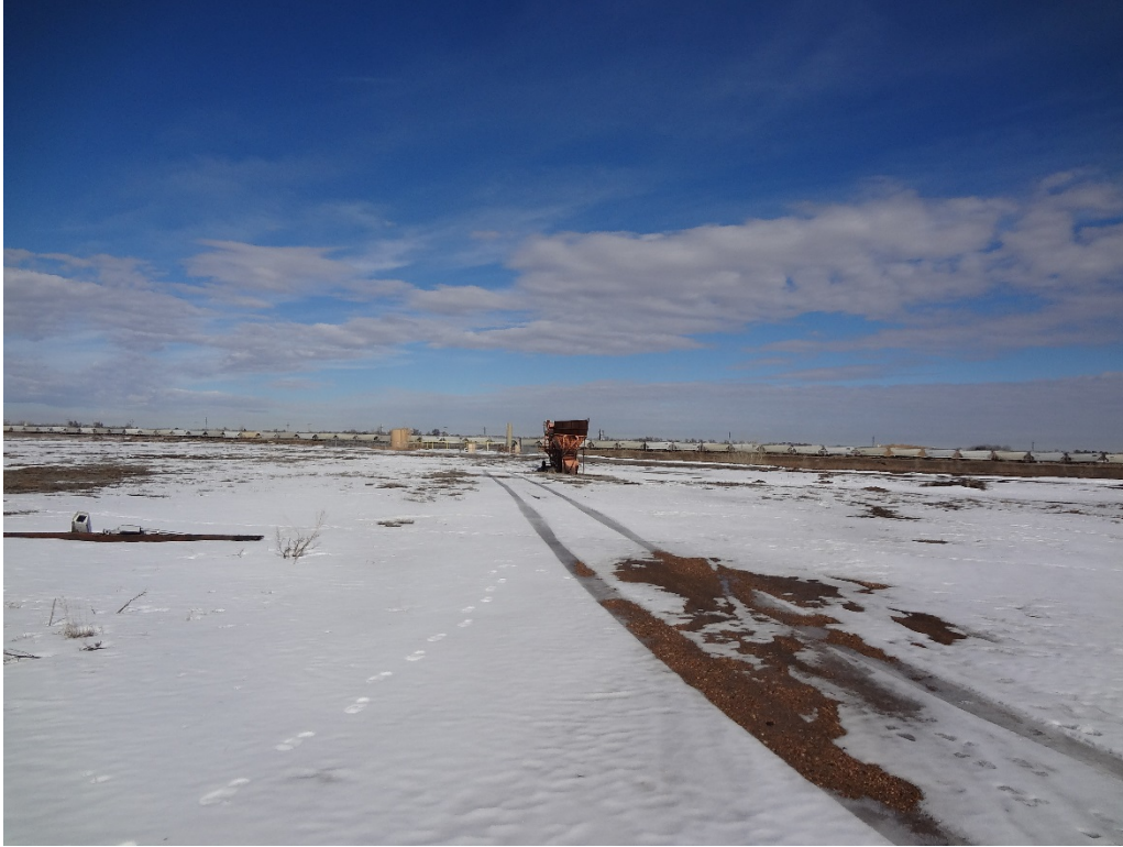
Looking north from entrance gate at site