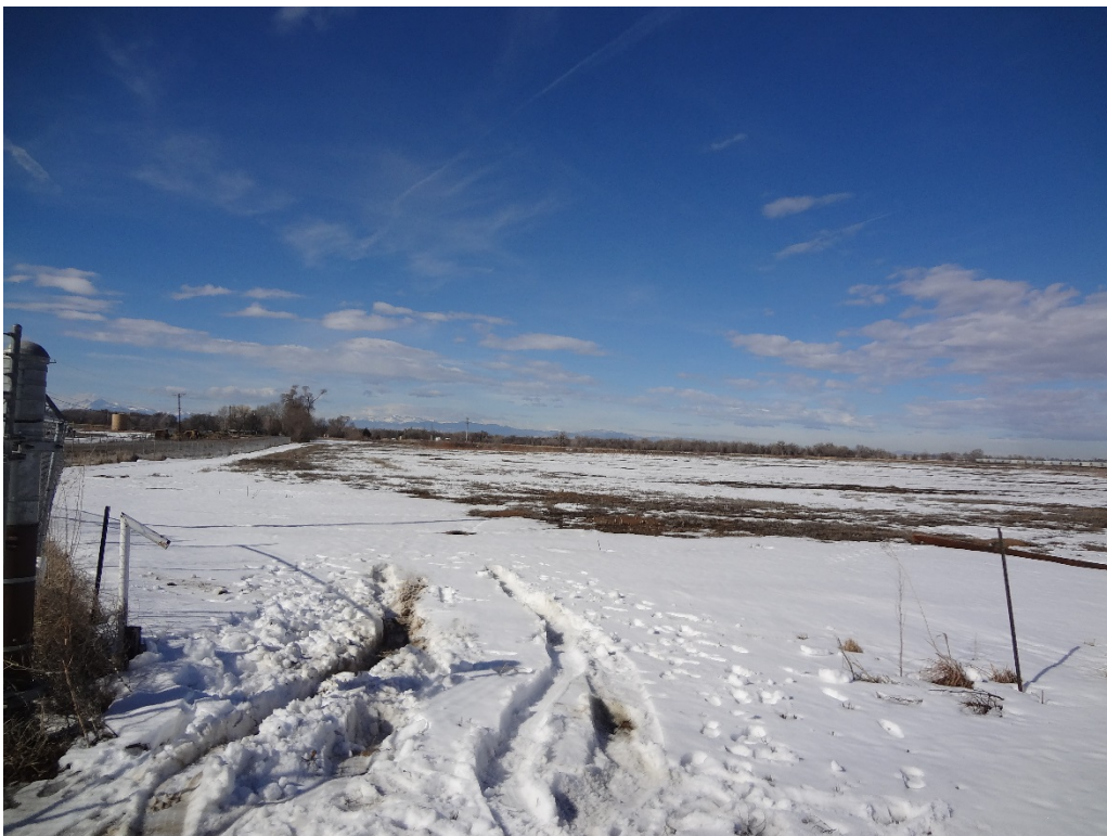
Looking west from entrance gate at site