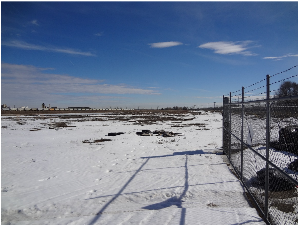
Looking east from entrance gate at site