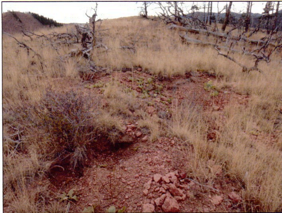
Photo 3 – Area of disturbance that contained 3 holes. Each hole measured about 2x2ft. Note the vegetation growing in the waste rock.