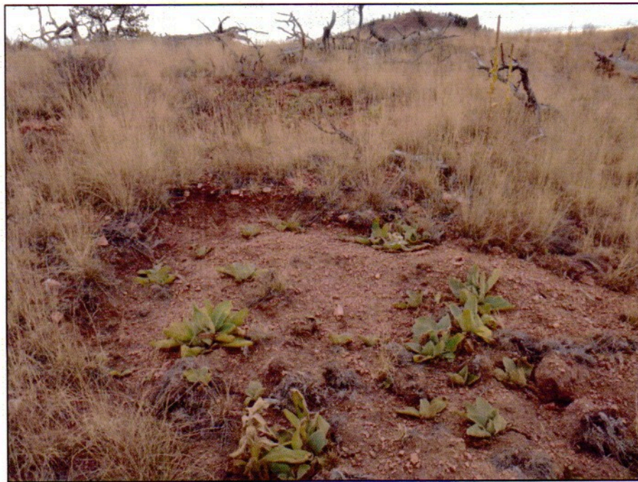
Photo 4 – More disturbance with vegetation growing in the waste rock pile.