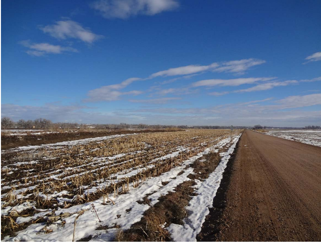
Looking east at eastern portion of site from road 396