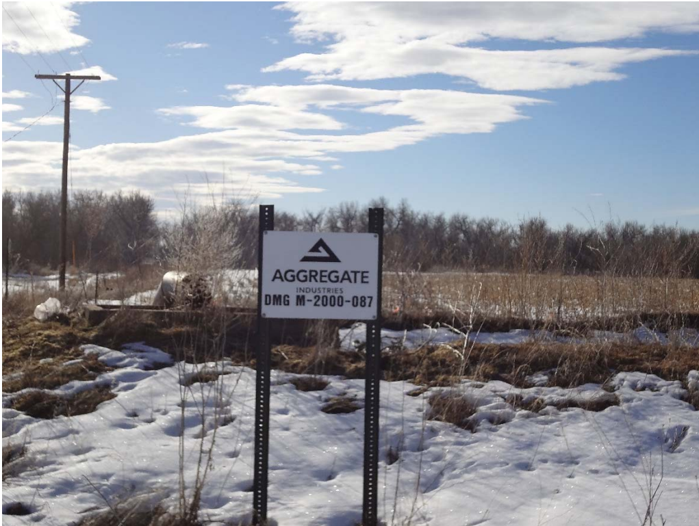
Milliken Resource Mine Sign