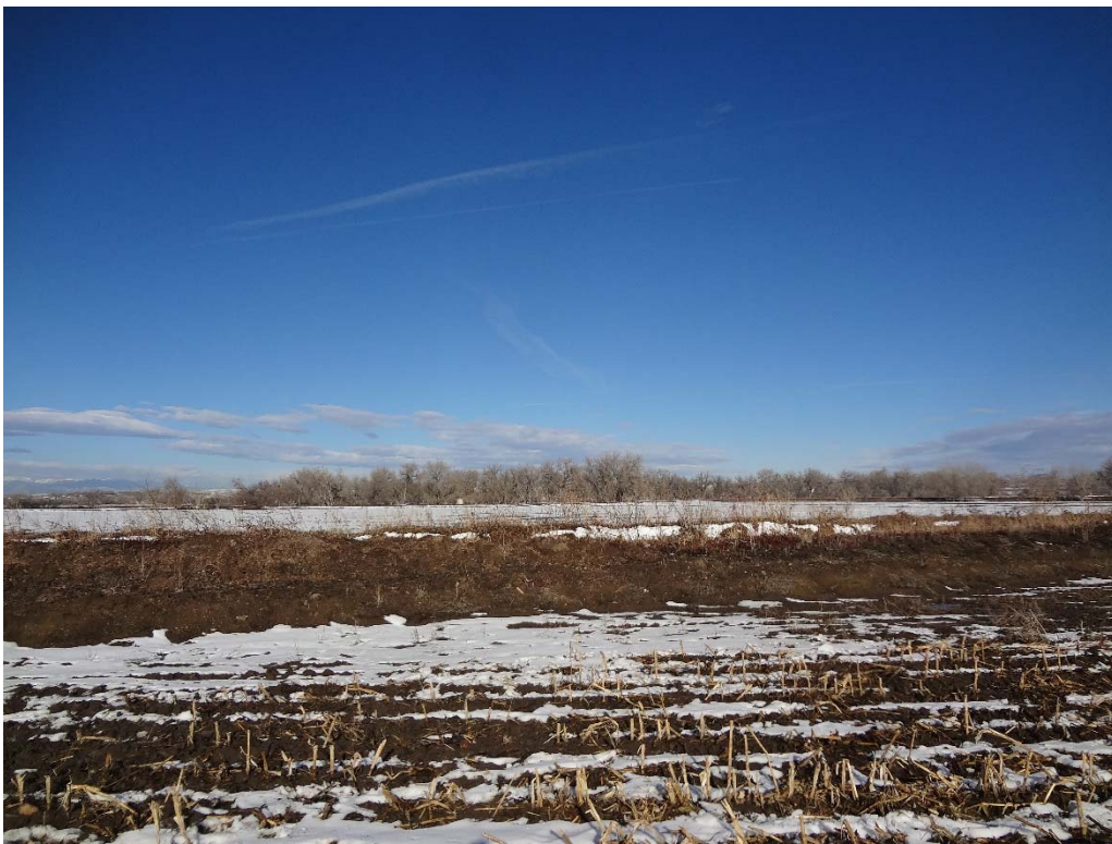
Looking north at eastern portion of site from road 396