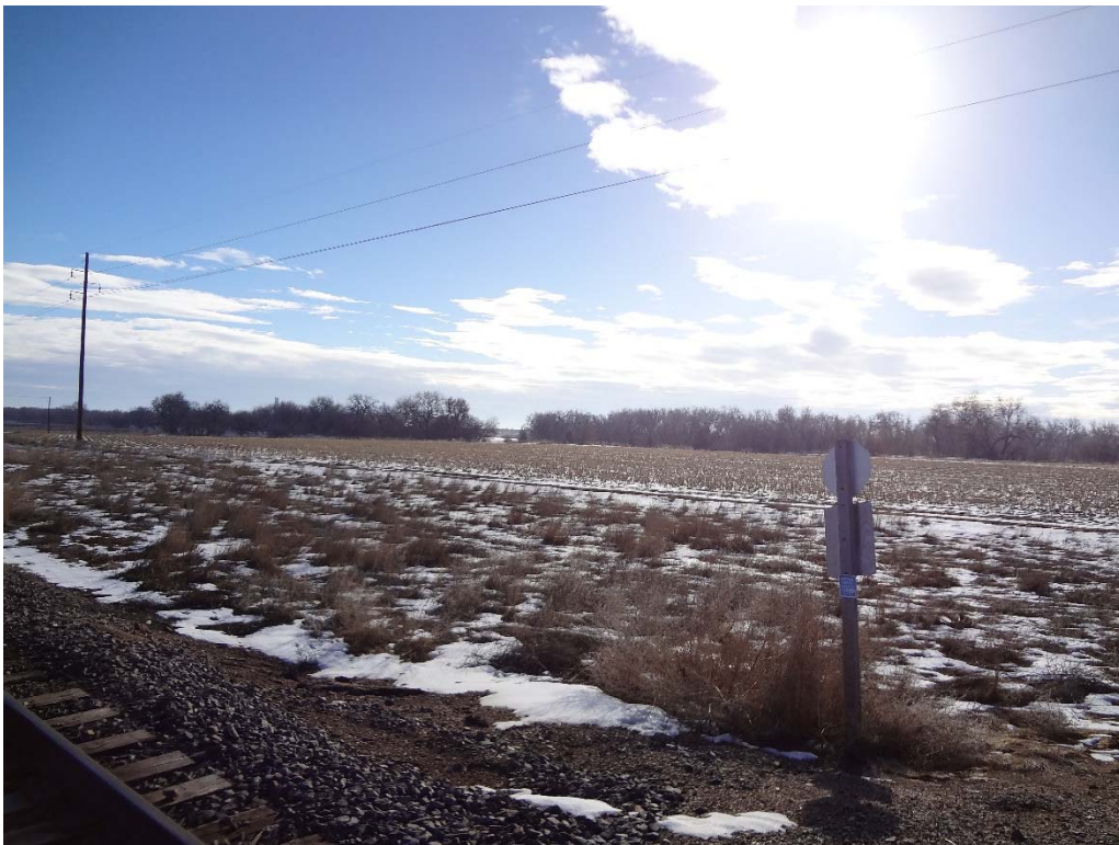
Looking SE from first access road railroad crossing