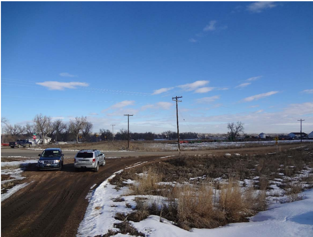
Looking north from first access road railroad crossing