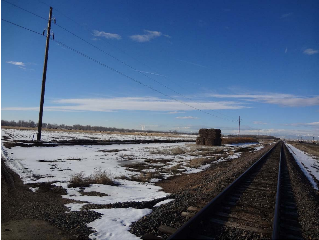
Looking SW from first access road railroad crossing