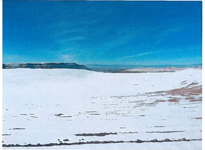
Pit area- reclaimed