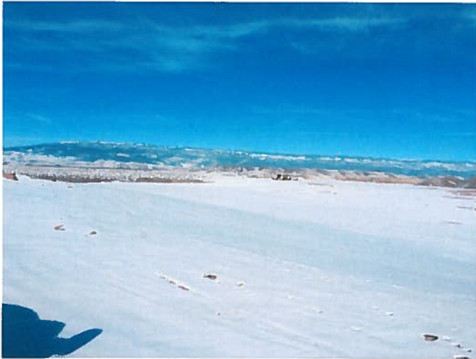
Looking to the NW