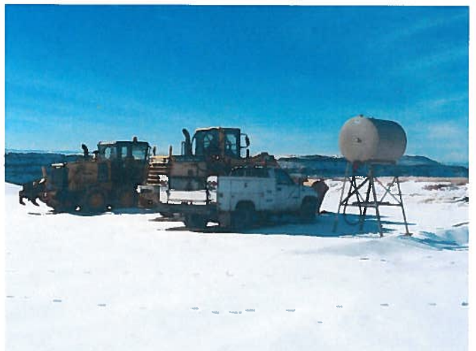
Fuel inadequately contained