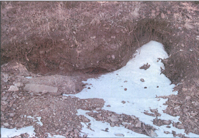
1. Excavation on northern bank of Russell Gulch.