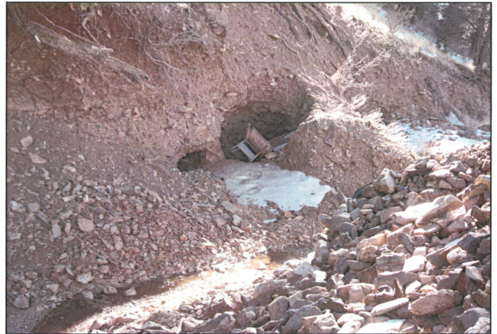
2. Excavation on northern bank of Russell Gulch.