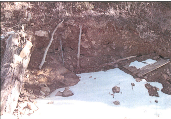
3. Excavation on northern bank of Russell Gulch.