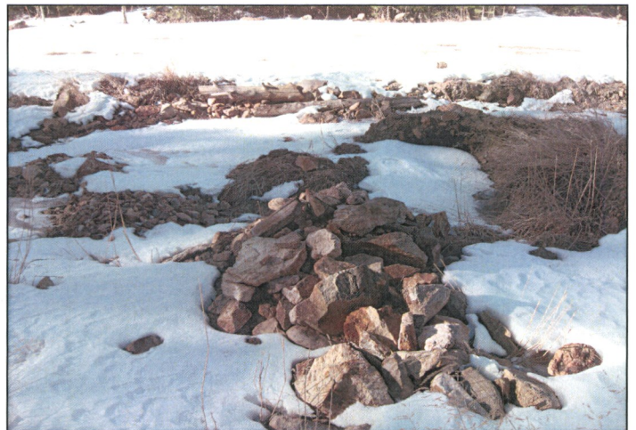
4. Rock check dam within Russell Gulch.