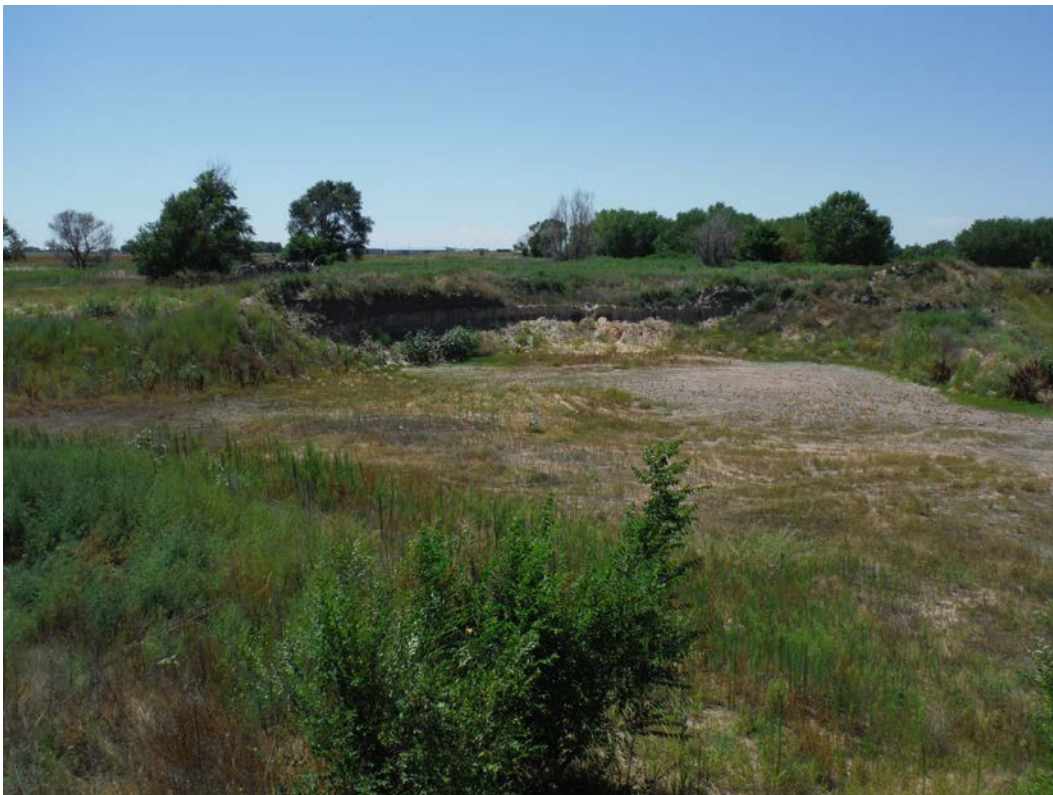
Active mining face/highwall; looking southwest into expansion area.