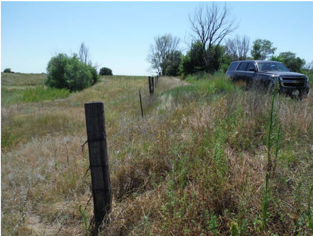
Eastern boundary marker; looking south.