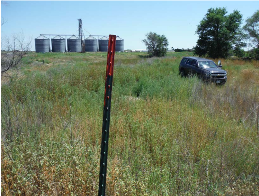
Eastern/central boundary marker; looking southeast.