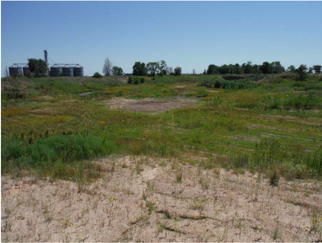
Overview of the original pit area; looking southeast.