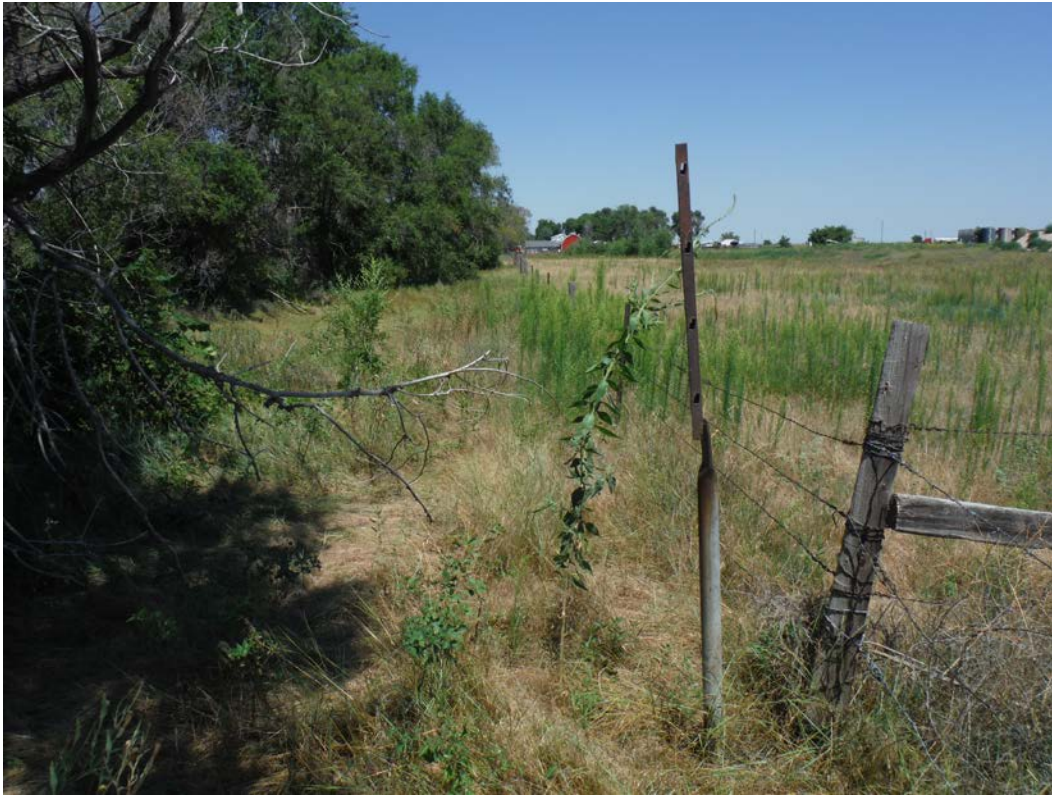
Southeastern boundary marker; looking north.