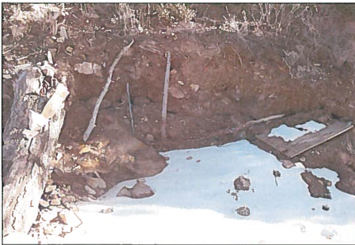
3. Excavation on northern bank of Russell Gulch.