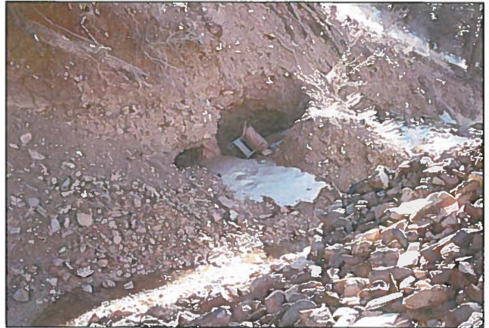
2. Excavation on northern bank of Russell Gulch.