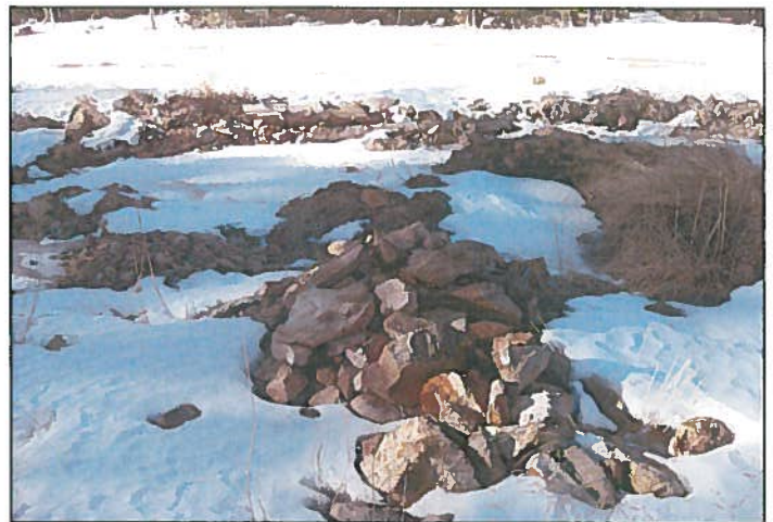
4. Rock check dam within Russell Gulch.