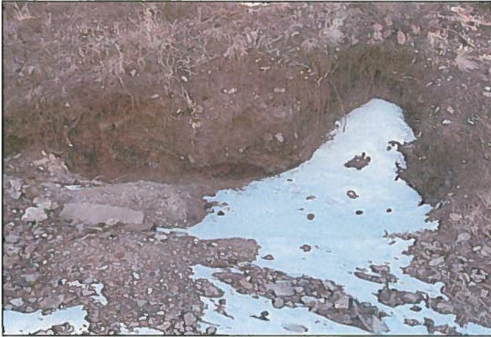
1. Excavation on northern bank of Russell Gulch.