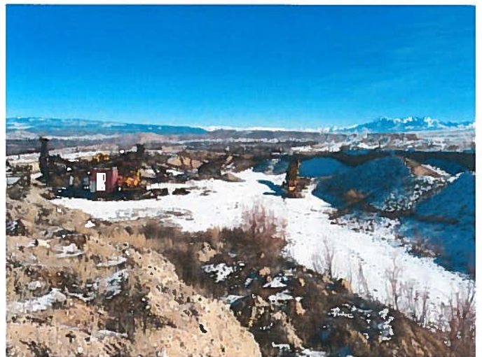
Overall Site looking North