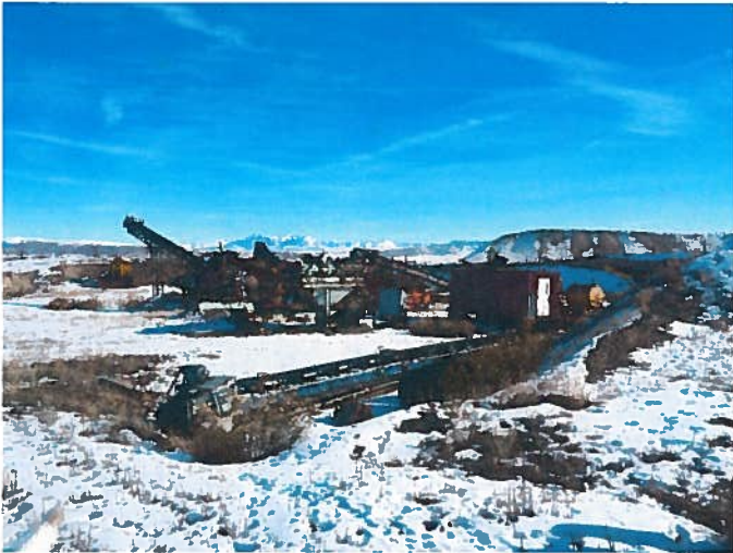
Overall Site- Looking East