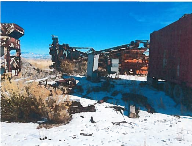
Equipment – Not in Operation